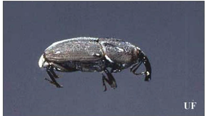
Figure 1. Adult hunting billbug, Sphenophorus venatus vestitus Chittenden.

The genus Sphenophorus contains 64 species in the United States, with 20 of these being recorded from Florida (Vaurie 1951). Sphenophorus venatus (Say) has been divided into five subspecies, of which only one ( vestitus Chitt.) is found in the southeast. This genus was previously called Calandra and Calendra , but these names have been suppressed in favor of Sphenophorus by the International Commission on Zoological Nomenclature (1959). Specimens of this group are often difficult to identify and should be sent to a specialist for confirmation.