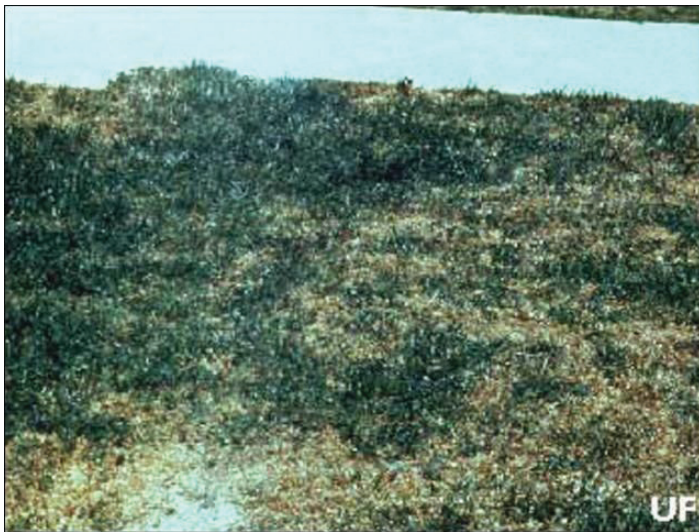
Figure 5. Damage caused by larvae of the hunting billbug, Sphenophorus venatus vestitus Chittenden.

To inspect for billbugs or grubs, cut three sides of a one foot square piece of sod about two inches deep with a spade under the sod and lay it back. See if the grass roots are chewed off and sift through the soil to determine if larvae are present. Replace the strip of sod. Inspect several areas in the lawn. As a rule of thumb, if an average of ten billbugs is found per square foot, apply an insecticide.