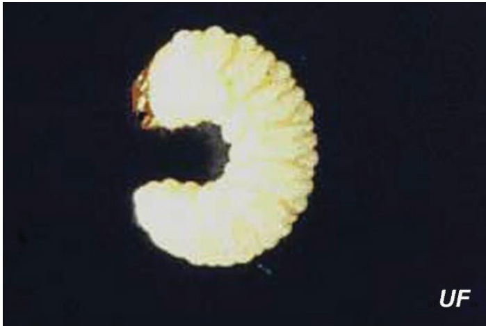
Figure 2. Larva of the hunting billbug, Sphenophorus venatus vestitus Chittenden.

The larva is typical of most weevil larvae, being thickest at the middle. The body is white to yellowish, the head tan to brown and mandibles mostly black.