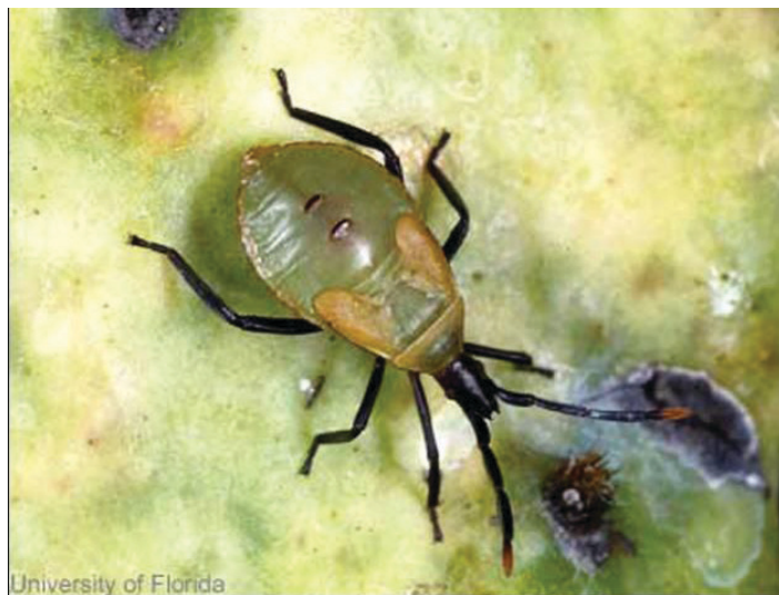
Figure 3. Nymph of Chelinidea vittiger aequoris McAtee, a cactus bug that feeds on prickly pear cacti, Opuntia spp. Feeding punctures result in circular discolored areas.

three months, the rate of nymphal development varies considerably, and adults are long lived (nine to 12 months under field conditions; a reared female of Chelinidea vittiger survived for 542 days under cage conditions in Australia according to Mann). Thus during warm weather, it is possible to have several stages present, contributing to confusion on the number of broods per year. For example, Hamlin (1924, 1932) suggested four to five broods annually, but Mann (1969) listed only two generations per year for Chelinidea vittiger aequoris . DeVol and Goeden (1973) reported Chelinidea vittiger vittiger as univoltine in southern California. Data on Florida specimens seen by us are for April to October, although literature records add the other months except January. Hamlin (1924) remarked that, with few exceptions, cactus feeding insects (including Chelinidea ) are sluggish. He ascribed this habit to their association with host plants that afford a high degree of protection because of their spines.