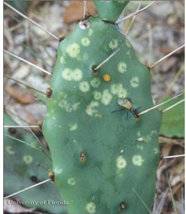
Figure 4. Nymph of Chelinidea vittiger aequoris McAtee, a cactus bug, and damage on prickly pear spine.