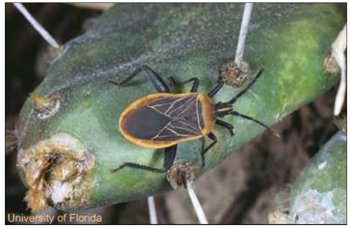
Figure 1. The cactus bug, Chelinidea vittiger aequoris McAtee, on an Opuntia cactus.

Hunter et al. (1912) described the egg and five nymphal stages of Chelinidea vittiger . Hamlin (1924) gave detailed descriptions of the egg and each instar (stage) of Chelinidea vittiger aequoris . He also listed color changes that occur from one instar to another and described three color forms within the 5th instar.