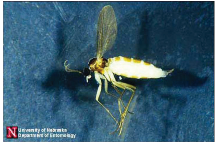
Figure 4. Adult darkwinged fungus gnat.