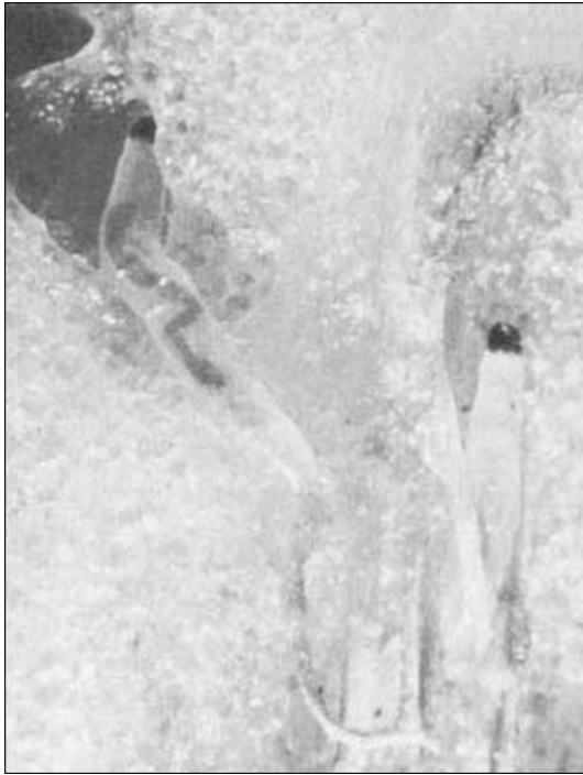
Figure 1. Darkwinged fungus gnat, Bradysia coprophila (Linter), larvae feeding on cactus tissues.