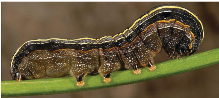
Figure 3. Lateral view of a larva of the yellowstriped armyworm, Spodoptera ornithogalli (Guenée).

Larvae initially are gregarious in behavior, but as they mature they disperse, sometimes spinning strands of silk upon which they are blown by the wind. There usually are six instars, although seven instars have been reported. Head capsule widths are about 0.28, 0.45, 0.8–1.0, 1.4–1.6, 2.0–2.2, and 2.8–3.0 mm, respectively, for instars one through six. The larva grows from about 2.0 to 35.0 mm ( \sim\frac{1}{8} in to 1.5 in) in length over the course of development. Coloration is variable, but mature larvae tend to bear a broad brownish band dorsally, with a faint white line at the center. More pronounced are black triangular markings along each side, with a distinct yellow or white line below. A dark line runs laterally through the area of the spiracles, and below this is a pink or orange band. The head bears a light-colored inverted V on the face.