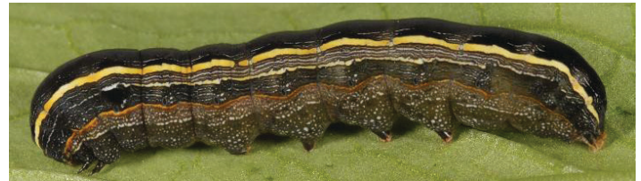
Figure 1. Lateral view of a larva of the yellowstriped armyworm, Spodoptera ornithogalli (Guenée). The yellow dorsolateral line running the length of the body is the basis for the common name of this insect.

and adults of yellowstriped armyworm may be present in autumn or early winter, they cannot withstand cold weather, and perish. Development time, from egg to adult, is about 40 days.