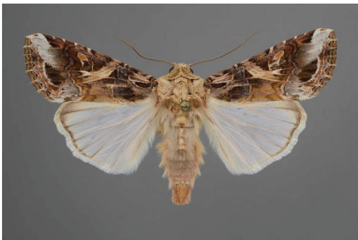
Figure 6. Adult yellowstriped armyworm, Spodoptera ornithogalli (Guenée).