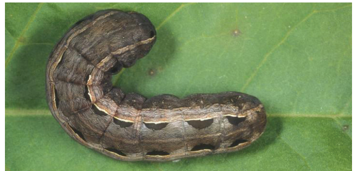
Figure 2. Dorsal view of a larva of the yellowstriped armyworm, Spodoptera ornithogalli (Guenée).