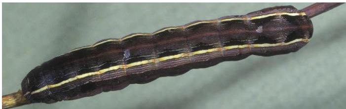
Figure 4. Dorsal view of a larva of the yellowstriped armyworm, Spodoptera ornithogalli (Guenée).