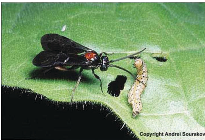
Figure 5. The wasp parasitoid Cardiochiles nigriceps Viereck, approaches a potential host, an adult tobacco budworm, Heliothis virescens (Fabricius).