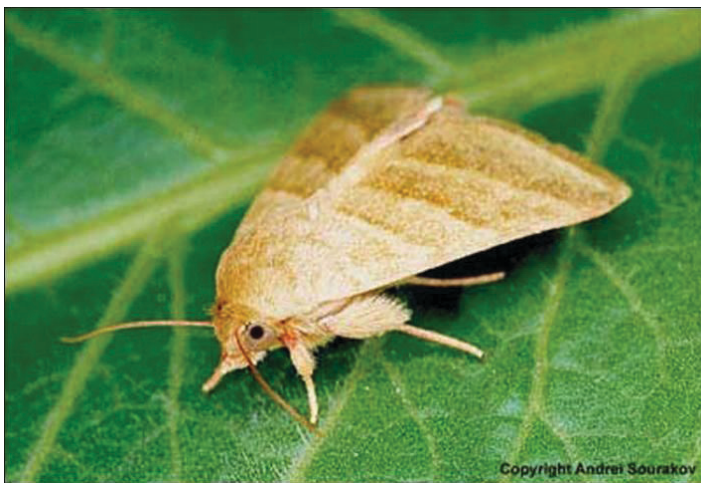
Figure 4. An adult tobacco budworm, Heliothis virescens (Fabricius).