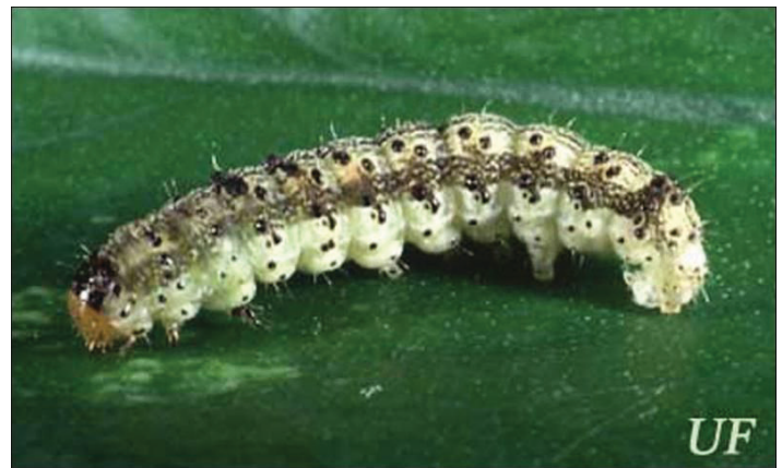
Figure 2. Larva of the tobacco budworm, Heliothis virescens (Fabricius).

Early instars are difficult to separate from corn earworm ; Neunzig (1964) gives distinguishing characteristics. Starting with the third instar, close examination reveals tubercles with small thorn-like microspines on the first, second, and eighth abdominal segments that are about half the height of the tubercles. In corn earworm the microspines on the tubercles are absent or up to one-fourth the height of the tubercle. Larvae exhibit cannibalistic behavior starting with the third or fourth instar but are not as aggressive as corn earworm.