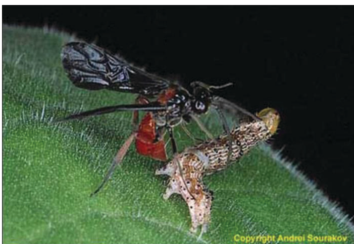
Figure 6. The wasp parasitoid Cardiochiles nigriceps Viereck, stinging a larva of a tobacco budworm, Heliothis virescens (Fabricius).