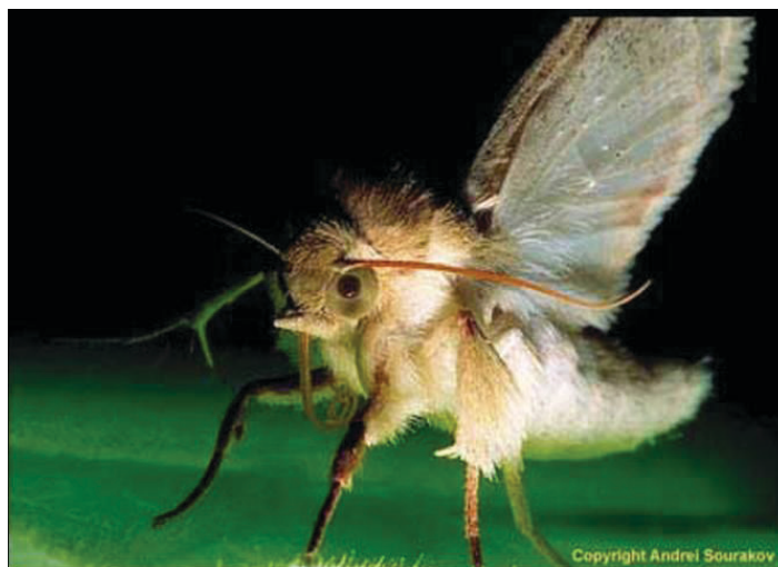
Figure 1. A closeup of an adult tobacco budworm, Heliothis virescens (Fabricius).

Moths emerge March through May in southern states, followed by four to five generations through the summer, with overwintering commencing September through November. Four generations have been reported from northern Florida and North Carolina, and at least five from Louisiana. Moths have been collected in New York July through September, but at such northern latitudes it is not considered to be a pest. This species overwinters in the pupal stage.