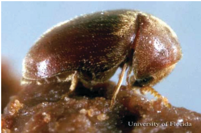
Figure 2. Adult cigarette beetle, Lasioderma serricorne (F.).