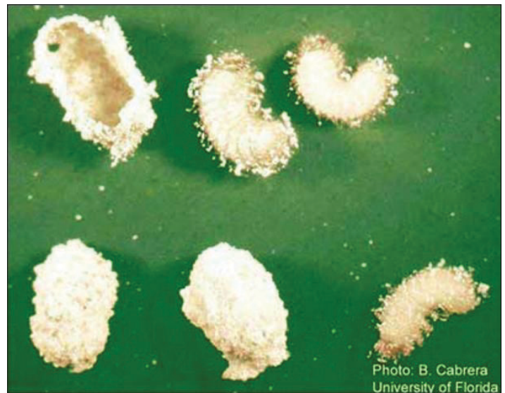
Figure 8. Larvae and cocoons of the cigarette beetle, Lasioderma serricorne (F.).