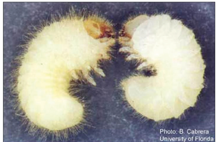
Figure 7. Comparison of a larva of a cigarette beetle, Lasioderma serricorne (F.), (left); and the drugstore beetle, Stegobium paniceum (L.) (right).

cardboard boxes, containers, and packaging cause indirect damage. Cocoons are often attached to a solid substrate and in severe infestations form large clusters. Larvae will sometimes bore their way through cardboard boxes and other packaging in search of a place to pupate.