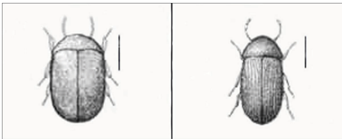
Figure 5. Comparison of the elytra and antennae of the cigarette beetle, Lasioderma serricorne (F.), (left), and drugstore beetle, Stegobium paniceum (L.) (right).

plants and herbarium specimens, dried floral arrangements, potpourri, decorative grapevine wreaths, prescription drugs and pills, medicinal herbs, pinned insects, furniture stuffing, papier-mâché, and bookbinding paste. Cigarette beetles harbor symbiotic yeasts that produce B vitamins. The yeasts are deposited on the eggs as they pass through the oviduct and are consumed by the larvae during egg hatch. These yeasts enable the cigarette beetle to feed and survive on many foods and other items of poor nutritional quality. The drugstore beetle also has symbiotic yeasts but they are of a completely different species.