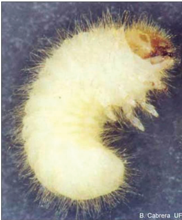
Figure 6. Larva of the cigarette beetle, Lasioderma serricorne (F.).