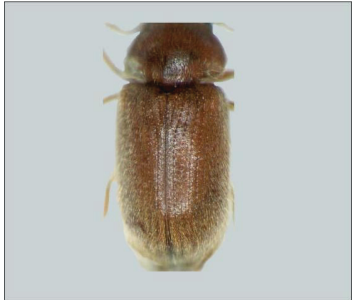
Figure 4. Striated elytra of an adult drugstore beetle, Stegobium paniceum (L.).