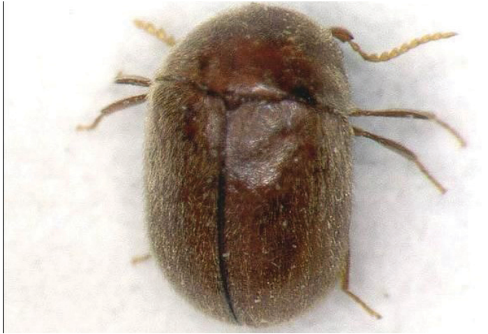
Figure 1. Adult cigarette beetle, Lasioderma serricorne (F.).

with a convex boundary that extends halfway up the frons. An arolium (pad-like structure between the tarsal claws) is also present and extends beyond the middle of the claw on each tarsus.