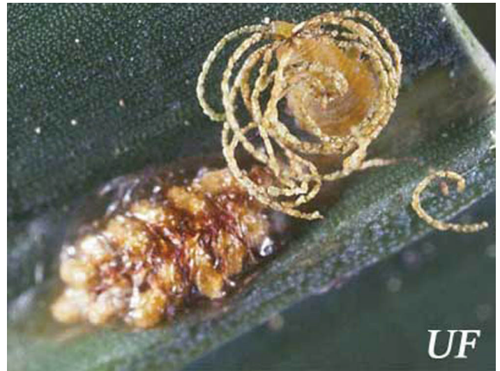
Figure 3. Feces-covered eggs and young larva of Hemisphaerota cyanea (Say).

The Florida tortoise beetle is found most commonly on native saw palmetto, Serenoa repens , but also feeds on cabbage palm, Sabal palmetto (W. Bartram) Small, dwarf palmetto, Sabal minor (Jacq.) Pers., scrub palmetto, Sabletonia Swingle ex Nash, and probably other native palms. It also has been reported from a variety of exotic palms in Florida.