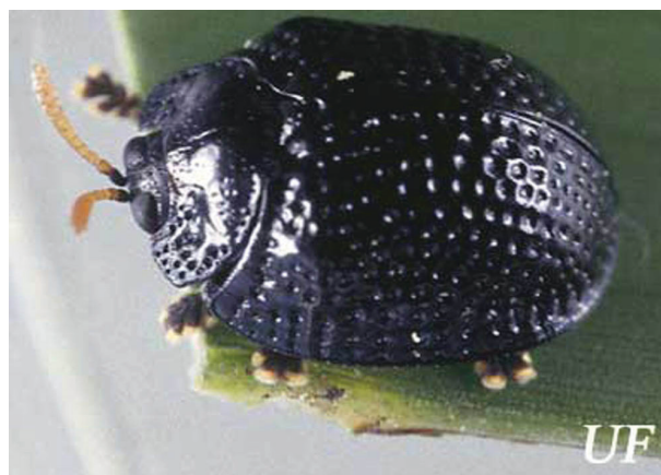
Figure 1. Adult Hemisphaerota cyanea (Say) (dorsal view).

with the surface and secretes oil onto the pads. With the adhesive force created by the oil between the leaf surface and tarsi, the beetle is able to clamp its hemispherical shell down tightly against the leaf and has been demonstrated to withstand pulling forces of approximately 60 times its own weight for up to two minutes. This time period is sufficient to thwart the efforts of predatory ants attempting to pry the beetle from the leaf. The oils used are similar to those of the cuticle of insects and are not believed to be unique for the defensive function. The wheel bug , Arilus cristatus (L.) (Hemiptera: Reduviidae) is able to overcome the defenses of the beetle—possibly by injecting toxic saliva to kill the beetle.