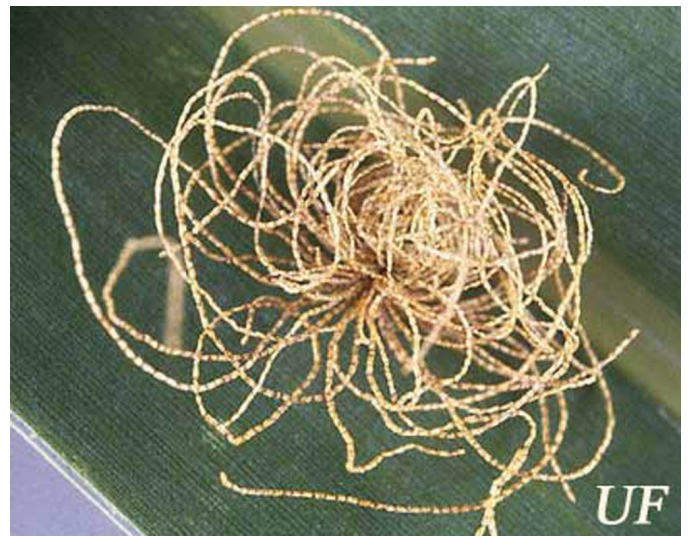
Figure 4. Dorsal view of feces-covered mature larva of Hemisphaerota cyanea (Say).