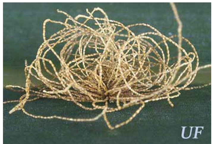
Figure 5. Lateral view of feces-covered mature larva of Hemisphaerota cyanea (Say).