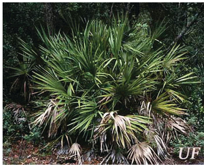
Figure 7. Saw palmetto, Serenoa repens (Arecaceae), a host of the Florida tortoise beetle, Hemisphaerota cyanea (Say).