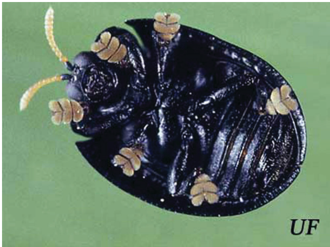
Figure 2. Adult Hemisphaerota cyanea (Say) (ventral view).