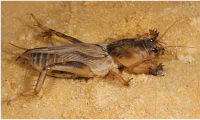
Figure 3. Adult tawny mole cricket, Neoscapteriscus vicinus (Scudder).