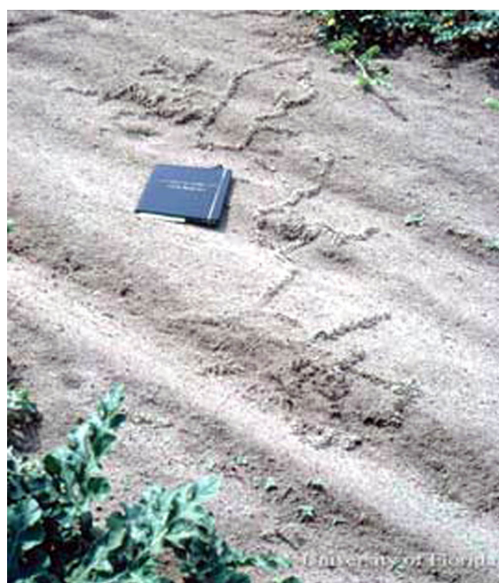
Figure 9. Tunnels formed by mole crickets burrowing near the soil surface.

The crickets usually damage seedlings, feeding above-ground on foliage or stem tissue, and belowground on roots and tubers. Girdling of the stems of seedling plants at the soil surface is a common form of injury, though young plants are sometimes severed and pulled belowground to be consumed. Additional injury to small plants is caused by soil surface tunneling, which may dislodge seedlings or cause them to desiccate. Southern mole cricket does much more tunneling injury than tawny mole cricket.