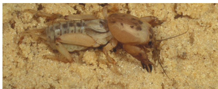
Figure 1. Adult shortwinged mole cricket, Neoscapteriscus abbreviatus (Scudder).

information on mole cricket biology, distribution, damage, management (including biological controls) and training tutorials.