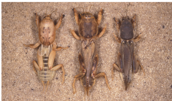
Figure 8. Three mole cricket species: shortwinged mole cricket, Neoscapteriscus abbreviatus (left); tawny mole cricket, Neoscapteriscus vicinus (center); southern mole cricket, Neoscapteriscus borellii (right).