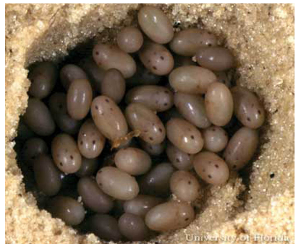
Figure 4. Eggs of the shortwinged mole cricket, Neoscapteriscus abbreviatus (Scudder).

The eggs are deposited in a chamber in the soil adjacent to one of the tunnels. The chamber is constructed at a depth of 5 to 30 cm below the soil surface. It typically measures 3 to 4 cm in length, width, and height. The eggs are oval to bean-shaped, and initially measure about 3 mm in length and 1.7 mm in width. The eggs increase in size as they absorb water, eventually attaining a length of about 3.9 mm and a width of 2.8 mm. The color varies from grey to brownish. The eggs are deposited in a loose cluster, often numbering 25 to 60 eggs. Duration of the egg stage is 10 to 40 days. Total fecundity is not certain, but more than 100 eggs have been obtained from a single female, and the mean number of egg clutches produced per female is 4.8 (Hayslip 1943).