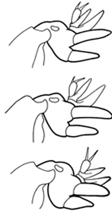
Figure 6. Differences in the shape of the dactyls of three mole cricket species: shortwinged mole cricket, Neoscapteriscus abbreviatus (top); southern mole cricket, Neoscapteriscus borellii (middle); and tawny mole cricket, Neoscapteriscus vicinus (bottom).

The shortwinged mole cricket bears forewings that are shorter than the pronotum. The forewings cover the hind wings, which are very small. The body is mostly whitish or tan in color, although the pronotum is brown, mottled with darker spots. Also, the abdomen is marked with a row of large spots dorsally, and smaller spots dorsolaterally. These crickets measure 22 to 29 mm in length. The two dactyls on the foretibiae are slightly divergent, and separated at the base by a space equal to at least half the basal width of