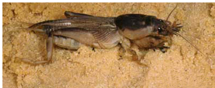
Figure 2. Adult southern mole cricket, Neoscapteriscus borellii (Giglio-Tos).