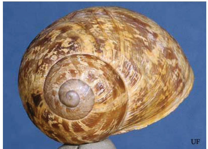
Figure 4. The brown garden snail, Cornu aspersum (Müller), showing yellow coloring.

Frequency of oviposition is subject to temperature, humidity, and soil conditions. Low temperature and low humidity inhibit the activity of the snail, and dry soil is unsuitable for the preparation of a nest. During warm, damp weather, oviposition may occur once a month. If each individual is capable of laying eggs once every six weeks from February to October, then oviposition occurs approximately five times a year and 430 eggs are laid (Basinger 1931).