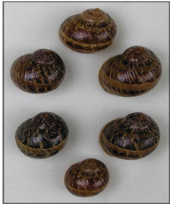
Figure 3. Shells of the brown garden snail, Cornu aspersum (Müller), displaying various color shades encountered.

Mating requires four to 12 hours. Oviposition occurs three to six days after fertilization. White spherical eggs about ⅛ inch in diameter are deposited in a nest constructed by the snail. The snail builds the nest by using its foot to shovel soil upwards. The nest is about 1 to 1.5 inches deep. The egg mass is concealed by a mixture of soil, mucus, and excrement. The number of eggs deposited at one time varies from 30 to 120 (Capinera 2001). Basinger (1931) reported an average of 86 eggs laid during each oviposition.