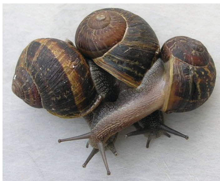
Figure 1. Adult brown garden snails, Cornu aspersum (Müller). Photograph taken in southern San Diego County, California.

capable of self-fertilization, although cross fertilization is normal. Adults deposit eggs.