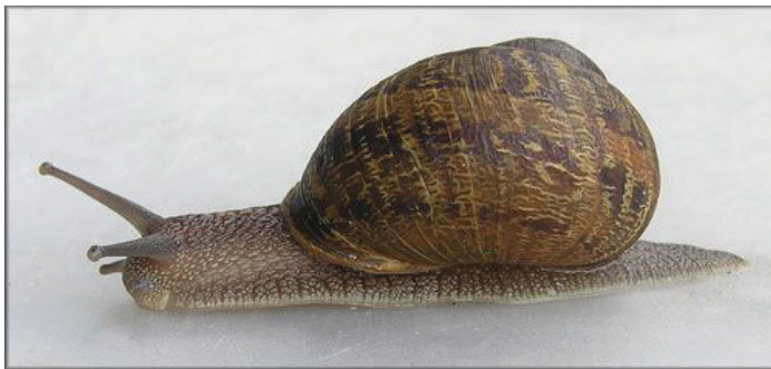
Figure 2. Extended adult brown garden snail, Cornu aspersum (Müller).

The shell is large, globose, rather thin, imperforate or nearly so, moderately glossy, and sculptured with fine wrinkles. The shell may be either yellow or horn-colored with chestnut brown spiral bands interrupted by yellow flecks or streaks. The aperture is roundly lunate to ovate-lunate, with the lip turned back. Adult shells (four to five whorls) measure 28 to 32 mm (1½–1¼ in) in diameter (Burch 1960).