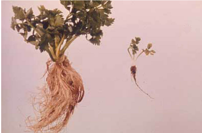
Figure 2. Awl nematodes ( Dolichodorus spp.) cause severe stunting, which can be seen in the celery plant on the right. The plant on the left is unaffected.

The damage caused by awl nematodes leads to severe stunting of the entire plant because of depletion of the root system. The roots are often coarse with stubby tips. The few secondary roots that remain are stubby as well.