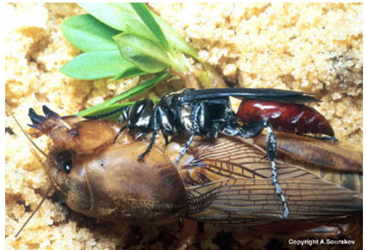
Figure 7. An adult Larra bicolor Fabricius feeding on a mole cricket by imbibing hemolymph.

prey items into cells that they have dug in the ground, and there lay eggs on them. Larra is thus exceptional among these wasps because females of the other genera dig cells in which to deposit their paralyzed hosts.