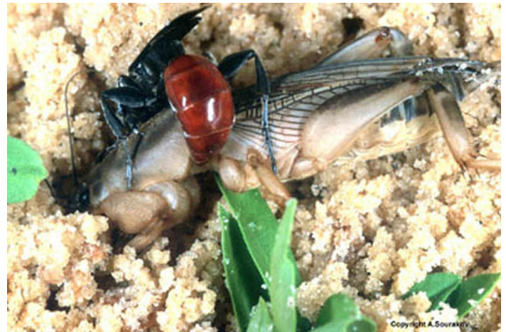
Figure 3. An adult Larra bicolor Fabricius preparing to sting a mole cricket it has chased from a gallery excavated by the mole cricket.

When they are not feeding at flowers, wasps are seldom seen. A lucky or patient observer may see a female wasp running on the ground stopping and running again during the brightest hours of the day. With luck, the observer will see the female wasp enter a gallery (= horizontal burrow) made by a mole cricket. Shortly thereafter, a mole cricket may be seen emerging from the ground, with the wasp in pursuit. She will pounce on it, wrestle with it, and sting it on its soft underside, thus immobilizing it for a few minutes. As the mole cricket lies inert on the ground, the wasp lays a single egg on its underside. The oviposition may easily be staged in a laboratory by inserting a mole cricket into a glass or plastic vial containing a female wasp. She wastes little time in attacking it. Female Larra analis oviposit behind a hind leg of the host (Smith 1935) whereas female Larra bicolor oviposit between the first and second pairs of legs of the host (Castner 1988b).