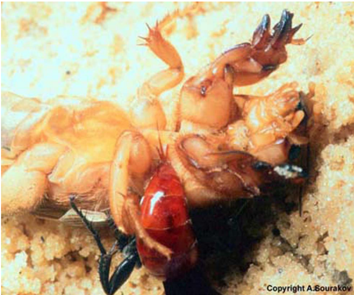
Figure 5. The ovipositor of an adult Larra bicolor Fabricius is plainly seen as the wasp lays an egg while the mole cricket is paralyzed.