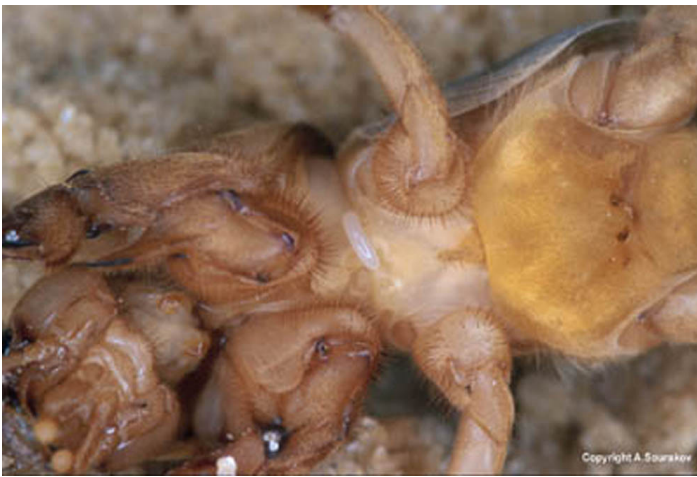
Figure 6. An egg of the wasp parasitoid Larra bicolor Fabricius deposited on the ventral side of the thorax of a mole cricket. The elongate, pearly white egg is central in the picture.

After the mole cricket is paralyzed, the female wasp may imbibe a little hemolymph from it before she oviposits, in a process called “host-feeding.” The purpose of “host-feeding” is obscure.