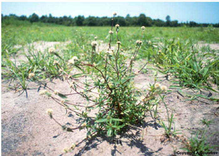
Figure 11. Spermacoce verticillata , a wildflower that provides a nectar source for adult Larra wasps.

It has been observed for many decades that adult Larra wasps visit wildflowers to obtain nectar. The number of wildflower species reported as nectar sources for Larra is short. Spermacoce verticillata is one of these plants. Botanists believe it is not native to Florida, but it is widespread in many counties in southern Florida, and it seems to provide nectar throughout the year. In northern Florida it freezes to the ground at the first winter frost, but provides nectar (with a high sucrose content) from May until then. Patches of Spermacoce verticillata , planted in northern Florida, support local populations of Larra bicolor wasps, and are used in “conservation biocontrol”. This works like “butterfly gardening” but with the intent to control pest mole crickets by supporting wasps. Buckwheat, Fagopyrum esculentum Moench, with its high fructose content, has not proved a suitable alternative and is non-native. Partridge pea, Chamaecrista fasciculata , a native plant, is a suitable alternative only in the summer, because its flowers senesce earlier in the fall; also, it has been claimed sometimes to be toxic to cattle.