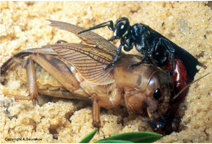
Figure 2. An adult Larra bicolor Fabricius preparing to oviposit on a mole cricket.