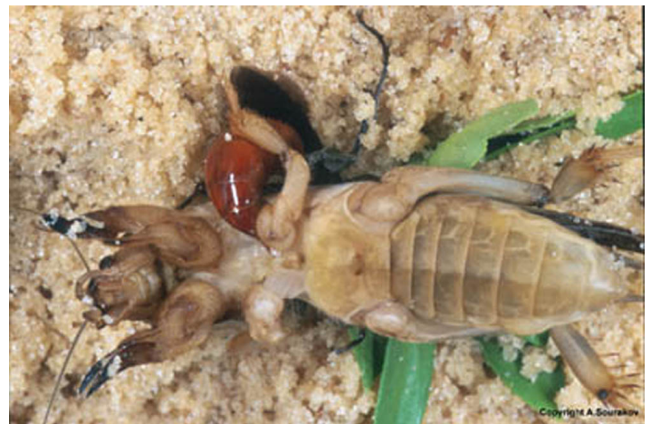
Figure 4. An adult Larra bicolor Fabricius stinging a mole cricket.