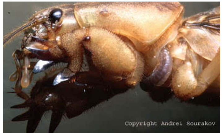
Figure 8. A developing larva of Larra bicolor Fabricius feeding on a mole cricket. The larva is a little to the right of the center of the picture.

Incubation time of the eggs is temperature-dependent and may be as rapid as four days in summer. Total development time from oviposition to pupation is also temperature-dependent, and ranges from a minimum of about 12 days to a maximum of about 30 days (Smith 1935). Wasp larvae develop as ectoparasitoids, with mandibles inserted into the host. The larvae have five instars (Cushman 1935).