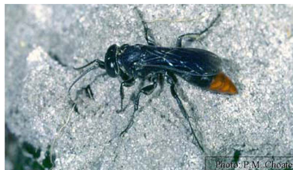
Figure 1. Adult Larra analis Fabricius, a parasitoid of the northern mole cricket, Neocurtilla hexadactyla (Perty).