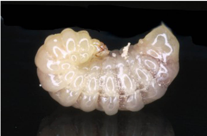
Figure 10. A fully grown larva of Larra bicolor Fabricius.