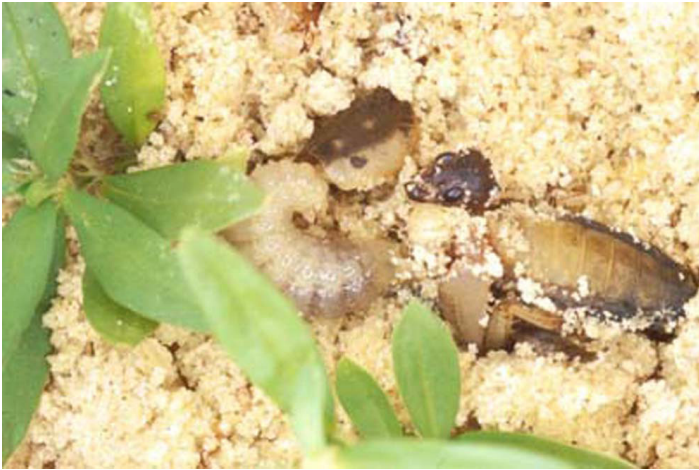
Figure 9. A fully grown larva of Larra bicolor Fabricius near pieces of the mole cricket on which it developed.

ranging from a little less than 50 days in summer to many months during the winter, in diapause. It is not yet known what initiates or ends this diapause. In the vicinity of Baton Rouge, Louisiana, Larra analis undergoes at least three generations during the summer and autumn, but winter causes above-ground activity to cease. The situation is the same with Larra bicolor in northern Florida. In effect, adult wasps are present continuously during the autumn months, and generations are not discrete. Adult wasps have been found dead on the ground after the first night of the winter that has below-freezing temperatures.