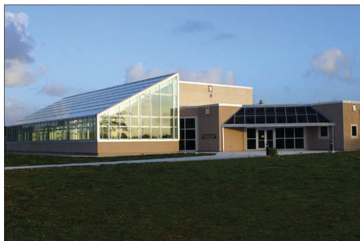
Figure 2. The USDA/ARS biological control containment laboratory in Fort Lauderdale.

Plant Research Laboratory in Fort Lauderdale constructed a 21,000 sq. ft. facility (Figure 2), and the University of Florida and DPI opened a similar 17,000 sq. ft. facility in Fort Pierce (Figure 3). Currently, scientists at the Fort Lauderdale facility are working on biological control of melaleuca, old-world climbing fern, Brazilian peppertree, Chinese tallow, , water hyacinth, and other exotic pests. The Fort Pierce faculty is addressing invasive weeds (Brazilian peppertree, air potato, water hyacinth, earleaf acacia) and insects/arthropods (Asian citrus psyllid, spherical mealybug, ghost bulimulus). These containment laboratories have greatly expanded opportunities for conducting classical biological control research and implementation in Florida and work together to provide sustainable control for some of Florida's worst invasive species.