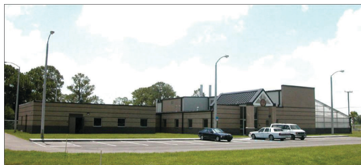
Figure 3. The UF/IFAS/DOACS-DPI biological control research and containment laboratory in Fort Pierce.