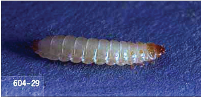
Figure 6. Larva of Carpophilus lugubris Murray, the dusky sap beetle.

equipped with hardened projections from the end of the abdomen that are species specific.