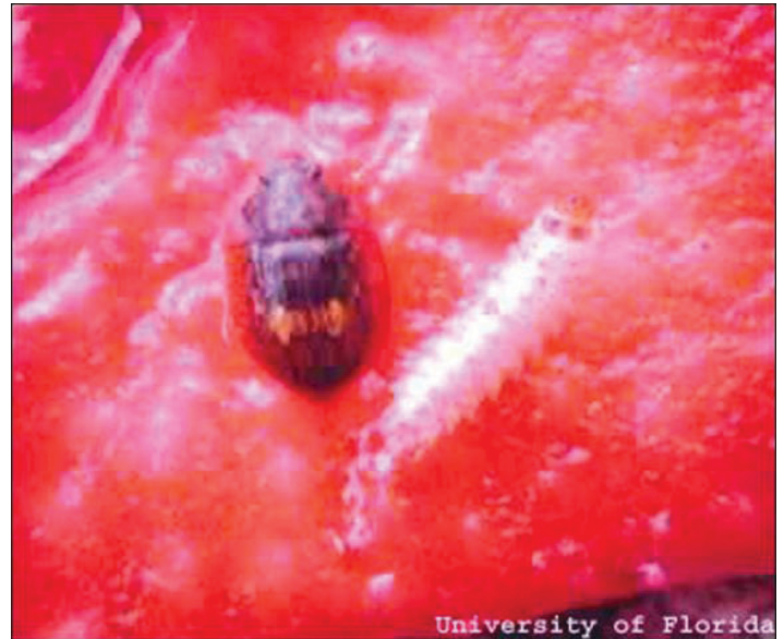
Figure 10. Adult (left) and larva (right) of the large sap beetle (picnic beetle, nitidulid) Lobiopa insularis .

Stelidota geminata , the strawberry sap beetle, migrates each spring from overwintering sites. Temperature plays a key role in regulating spring migration of Stelidota geminata (Gertz 1968, Weiss 1979). First generation beetles develop in the strawberry fields. Dowd and Nelson (1994) reported early migration peaks in both raspberry and corn at the end of the strawberry season which may indicate that these sites are utilized by the beetle for over-wintering. Stelidota geminata was not found to overwinter in strawberry plantings. However, Lobiopa insularis (Cast.) is the most frequently observed sap beetle in Florida strawberries (Price 2004), although several other smaller species inhabit the fields.