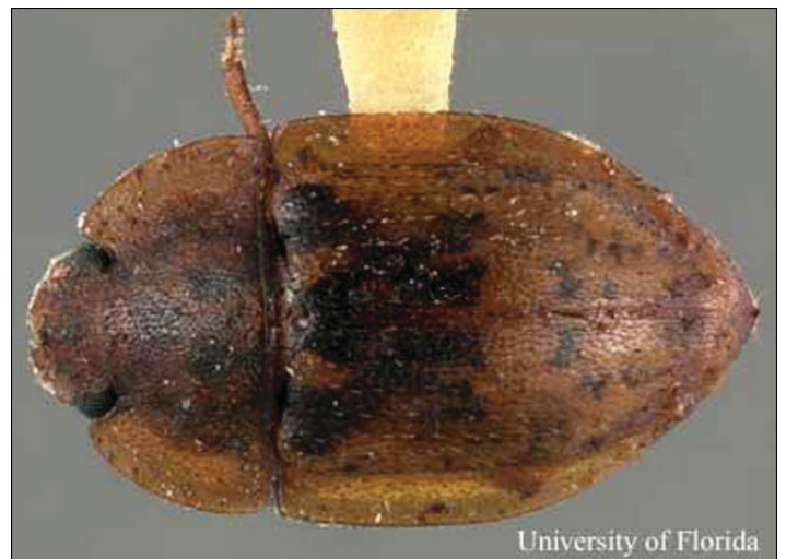
Figure 11. Pinned adult Lobiopa insularis (Cast.), collected on strawberry.