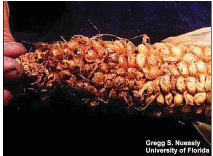
Figure 13. Sap beetle ( Carpophilus spp.) larval and adult damage to entire sweet corn ear.

varieties of corn, Bt corn and non- Bt hybrid corn. Dowd's study showed that direct damage can be induced by dusky sap beetles. In Ohio, the strawberry sap beetle attacks ripe, nearly ripe, or decaying strawberry fruit by boring into the berry and devouring a portion in the field. In the Florida study (Potter 1995) Epuraea luteolus apparently feeds on decomposing fruit material. The study however did not demonstrate the economic impact, if any, on strawberry fruit production. The presence of Epuraea luteolus on strawberry fruit may be more of an issue of contamination by beetles and possibly larvae.