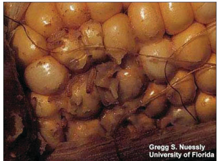
Figure 9. Sap beetle ( Carpophilus spp.) larvae feeding at base of sweet corn ear. Note legs and light brown head on larvae as opposed to the maggot shape of cornsilk fly larvae (next figure). http://entnemdept.ufl.edu/creatures/field/cornsilk_fly.htm Credits: Gregg S. Nuessly, University of Florida