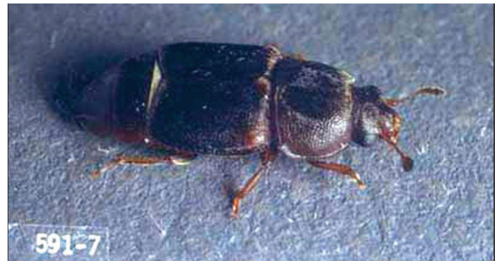
Figure 5. Adult Carpophilus lugubris Murray, the dusky sap beetle.

The dusky sap beetle adult, Carpophilus lugubris , is about 2.8 mm long with short elytra. The adult is uniform dull black in color.