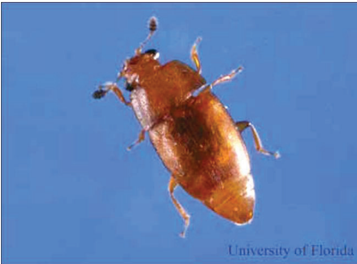
Figure 3. A yellowbrown sap beetle, Epuraea luteolus (Erichson), collected on strawberry.