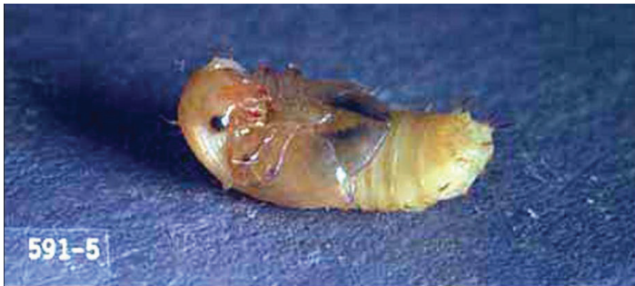
Figure 7. Pupa of Carpophilus lugubris Murray, the dusky sap beetle.

Pupae are white, turning cream colored and later tan before adult emergence. The pupa is typical exarate (furrowed) averaging 4.4 mm in length and 2.0 mm in width (Parsons 1943).