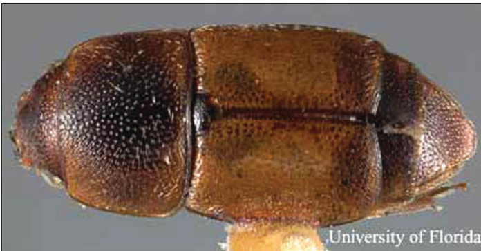
Figure 4. Adult Carpophilus fumatus Boheman, collected on strawberry.