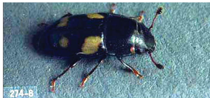
Figure 1. Adult Glischrochilus quadrisignatus (Say), a picnic beetle.

numbers of sap beetles on a host plant can prove economic in terms of crop damage caused by the feeding beetles, but impact on crop value is primarily due to the contamination of products ready for sale by adults and larvae. In addition to damage caused by feeding, sap beetles have also been recognized as vectors of fungi (Dowd 1991).