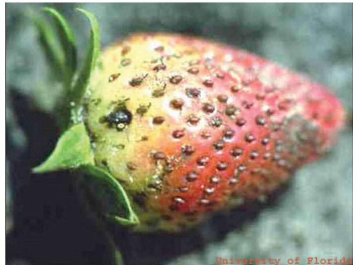
Figure 14. Sap beetle feeding on strawberry.

Sap beetles can also vector mycotoxin producing fungi to corn and strawberries (Dowd and Nelson 1994). Maize sap beetles appear to be well adapted for vectoring mycotoxigenic fungi, including species in the genera Aspergillus ,