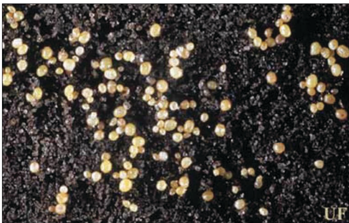
Figure 3. Various life stages of ground pearls, Margarodes spp.