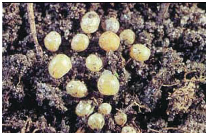
Figure 1. Immature ground pearls, Margarodes spp., in centipedegrass, Eremochloa ophiuroides .

Ground pearls, Margarodes spp., are primitive, subterranean relatives of the widely recognized above-ground armored scale insect (family Diaspididae). They are also sometimes referred to as earth pearls or pearl scale. While retaining well-developed fossorial legs with numerous setae (which scale insects do not have), ground pearls cannot secrete scales similar to their scale relatives (Beardsley and Gonzalez 1975). Instead, ground pearls excrete a waxy covering that completely surrounds their body, with the exception of their piercing-sucking mouthparts. The voided, waxy, spherical covering of the insect is the most likely structure to be encountered. The sphere is pink to yellowish-brown in color and measures from about 4.3 mm ( \sim 3/16 in) in diameter to the size of a grain of sand (Buss 2008). The exposed mouthparts are used to feed and attach to the roots of plants.