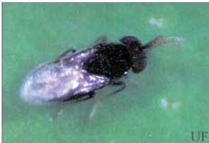
Figure 2. Adult female of Ageniaspis citricola Logvinovskaya.

Ageniaspis citricola is approximately 0.7 to 0.8 mm long. The abdomen of the female is small and triangular, and the thorax is considerably longer than the abdomen. Both males and females are black in color, with fine silvery white pubescence, and with tarsi and portions of the tibiae colored yellow. Antennae are clubbed, 7-segmented and yellowish-brown in color, with a darker scape and pedicel.