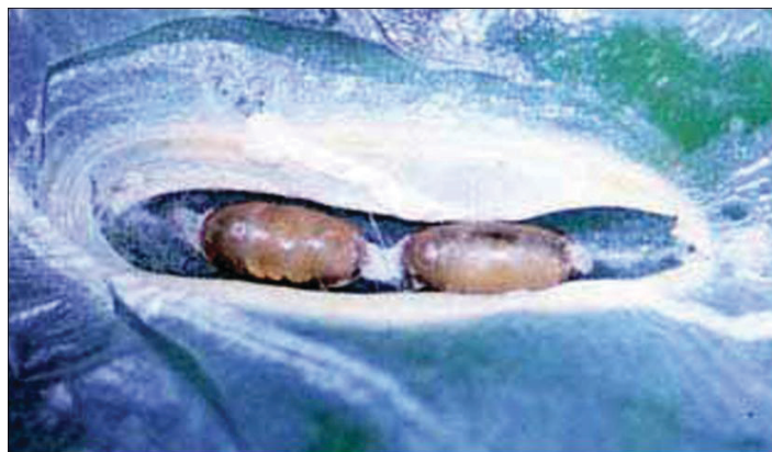
Figure 3. Pupal cell in leaf with two to four Ageniaspis citricola Logvinovskaya pupae.

Ageniaspis citricola is a host-specific, koinobiont (not especially harmful to their host until they mature), endoparasitoid of citrus leafminer eggs and early instar larvae. All stages of the parasitoid develop within the citrus leafminer host. After being parasitized, the citrus leafminer will continue to feed and develop in leaf mines, going on to form a pupal chamber at the end of the mine. At this point, Ageniaspis citricola kills its host and pupates within the exoskeleton of the citrus leafminer in the pupal chamber.