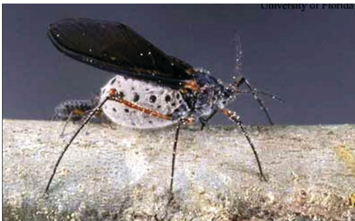
Figure 3. Winged adult giant bark aphid, Longistigma caryae (Harris).

Alate (winged) viviparous female: body 6 mm ( \sim\frac{1}{4} in) long, abdomen 3 to 5 mm ( \sim\frac{1}{8} – \frac{3}{16} in) in diameter, head to tip of folded wings 10 mm ( \sim\frac{3}{8} in); wing expanse 18 mm ( \sim\frac{3}{4} in), antennae 3 mm ( \sim\frac{1}{8} in), posterior legs 11 mm ( \frac{7}{16} in). Head and thorax bluish-black; antennae and cornicles black; dorsum of abdomen whitish with 2 rows of black spots on each side of the median line and a transverse series of small, black dots on each segment. Cornicles short and truncate. Tips of femora, tibia and tarsi black. Body, legs and antennae covered with long brown hairs. Wings dusky, especially toward base. Oviparous females do not differ in appearance from viviparous females.