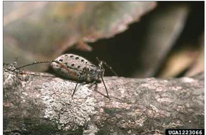
Figure 1. Nearly mature nymph of the giant bark aphid, Longistigma caryae (Harris).

Longistigma caryae has been reported from Alabama, Arkansas, Arizona, California, Connecticut, Delaware, District of Columbia, Florida, Georgia, Illinois, Indiana, Iowa, Kansas, Kentucky, Louisiana, Maryland, Massachusetts, Michigan, Minnesota, Mississippi, Missouri, Nebraska, New Jersey, New Mexico, New York, North Carolina, Ohio, Pennsylvania, South Carolina, Tennessee, Texas, Utah, Virginia, and Wisconsin.