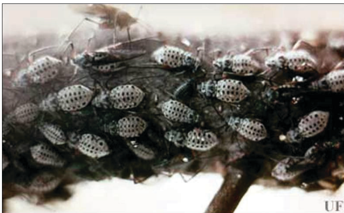
Figure 2. Colony of giant bark aphids, Longistigma caryae (Harris), with both winged and wingless females.