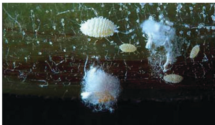
Figure 1. Adults and egg sacs of papaya mealybug, Paracoccus marginatus Williams and Granara de Willink.

The papaya mealybug, Paracoccus marginatus Williams and Granara de Willink, is a small hemipteran that attacks several genera of host plants, including economically important tropical fruits and ornamentals. The papaya mealybug was discovered in Manatee and Palm Beach counties in Florida in 1998 and subsequently spread rapidly to several other Florida counties. It potentially poses a multi-million dollar threat to numerous agricultural products in Florida, as well as other states, if not controlled. Biological control was identified as a key component in a management strategy for the papaya mealybug, and a classical biological control program was initiated as a joint effort between the US Department of Agriculture, Puerto Rico Department of Agriculture, and Ministry of Agriculture in the Dominican Republic in 1999.