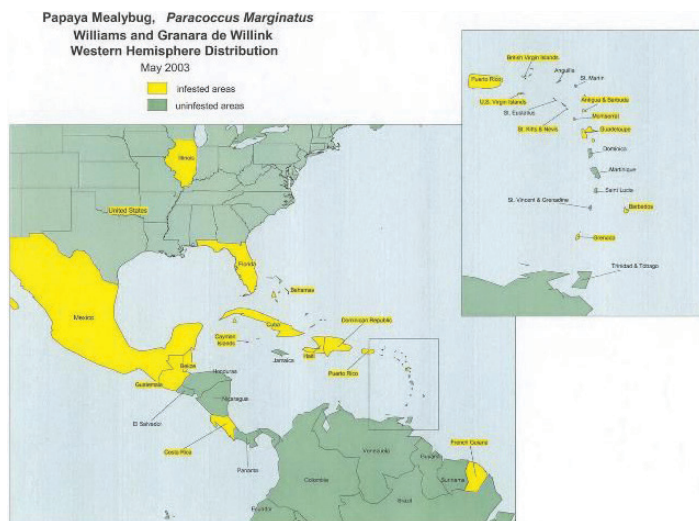
Figure 2. Distribution of the papaya mealybug, Paracoccus marginatus Williams and Granara de Willink, as of May 2003.

British Virgin Islands, Cuba, Dominican Republic, Haiti, Puerto Rico, Montserrat, Nevis, St. Kitts, and the US Virgin Islands. More recently, specimens have turned up in the Pacific regions of Guam and the Republic of Palau.