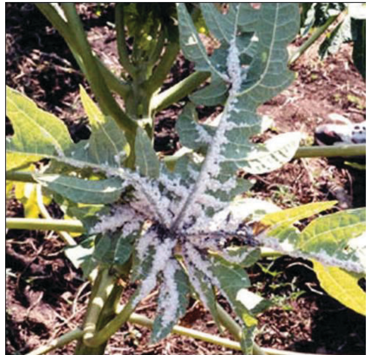
Figure 3. Papaya leaf infestation of the papaya mealybug, Paracoccus marginatus Williams and Granara de Willink.

Eggs are greenish yellow and are laid in an egg sac that is three to four times the body length and entirely covered with white wax. The ovisac is developed ventrally on the adult female.