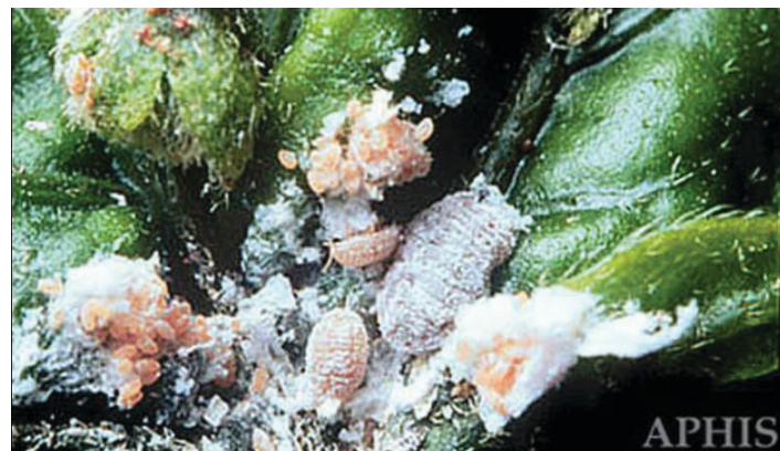
Figure 6. Various stages in the life cycle of the pink hibiscus mealybug, Maconellicoccus hirsutus (Green).

Specimens of papaya mealybug turn bluish-black when placed in alcohol, as is characteristic of other members of this genus.