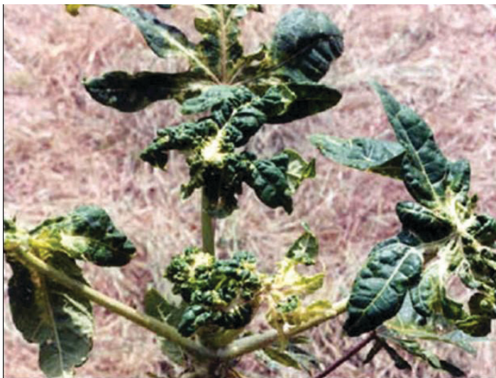
Figure 8. Papaya leaf deformation caused by the papaya mealybug, Paracoccus marginatus Williams and Granara de Willink.