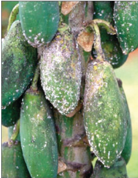
Figure 7. Papaya fruit infestation and damage caused by the papaya mealybug, Paracoccus marginatus Williams and Granara de Willink.

The papaya mealybug feeds on the sap of plants by inserting its stylets into the epidermis of the leaf, as well as into the fruit and stem. In doing so, it injects a toxic substance into the leaves. The result is chlorosis, plant stunting, leaf deformation, early leaf and fruit drop, a heavy buildup of honeydew, and death. Heavy infestations are capable of rendering fruit inedible due to the buildup of thick white wax. Papaya mealybug has only been recorded feeding on areas of the host plant that are above ground, namely the leaves and fruit.