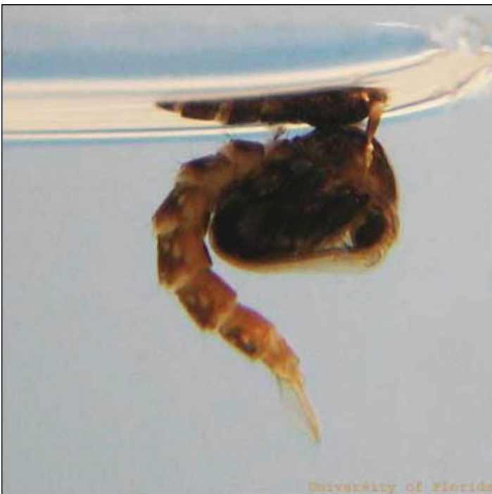
Figure 5. Pupa of the Asian tiger mosquito, Aedes albopictus (Skuse).