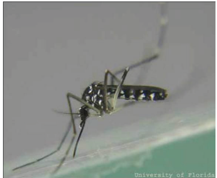
Figure 3. Adult Asian tiger mosquito, Aedes albopictus (Skuse).

For a pictorial key (that includes the larval, pupal and adult stage for many common Florida mosquitoes) to identify Ae. albopictus and other mosquitoes of Florida, see: https://fmel.ifas.ufl.edu/media/fmelifasufledu/key/pdf/atlas.pdf .