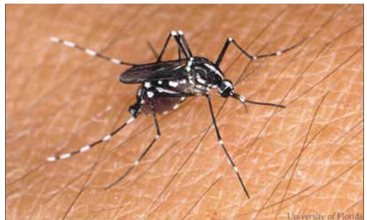
Figure 1. Adult Asian tiger mosquito, Aedes albopictus (Skuse).

encephalitis virus (Mitchell et al. 1992), and zika virus (CDC 2019). Its life cycle is closely associated with human habitat, and it breeds in containers with standing water, often tires or other containers. It is a daytime feeder and can be found in shady areas where it rests in shrubs near the ground (Koehler and Castner 1997). Aedes albopictus feeding peaks in the early morning and late afternoon; it is an opportunistic and aggressive biter with a wide host range including man, domestic and wild animals (Hawley 1988).