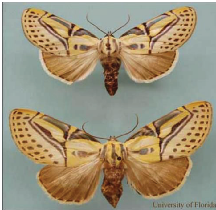
Figure 4. Adult male (top) and female of the hieroglyphic moth, Diphthera festiva (F.). Male collected from Okaloosa Co. Florida, female from Alachua Co., Florida.