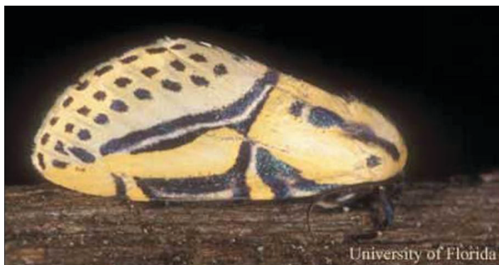
Figure 1. Adult hieroglyphic moth, Diphthera festiva (F.).

The hieroglyphic moth, Diphthera festiva (Fabricius), is distributed throughout Florida and tropical or subtropical regions of the New World. The conspicuous larvae often occur gregariously on a wide array of plant species and occasionally are considered pests of pecan, coconut palms, sweet potato and soybeans.