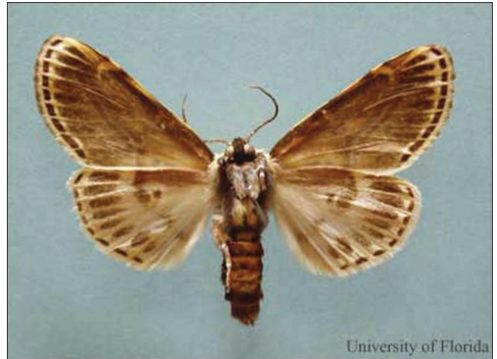
Figure 5. Underside of an adult male hieroglyphic moth, Diphthera festiva (F.), collected from Abita Springs, Louisiana.