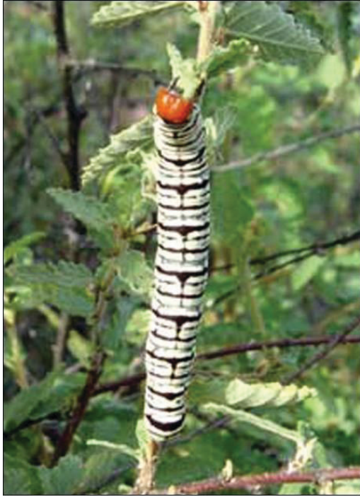
Figure 3. Larva of hieroglyphic moth, Diphthera festiva (F.) on Melochia tomentosa L., US Virgin Islands \frac{1}{2} mile N. of St. Croix, Buck Island, Buck Island Reef National Monument.

the crotches of trees. The pupa ranges in size from 1.5 to 1.7 cm (~ \frac{2}{3} in) in length. (descriptions taken from Benjamin 1922; Covell 1984; Becker & Miller 2002).