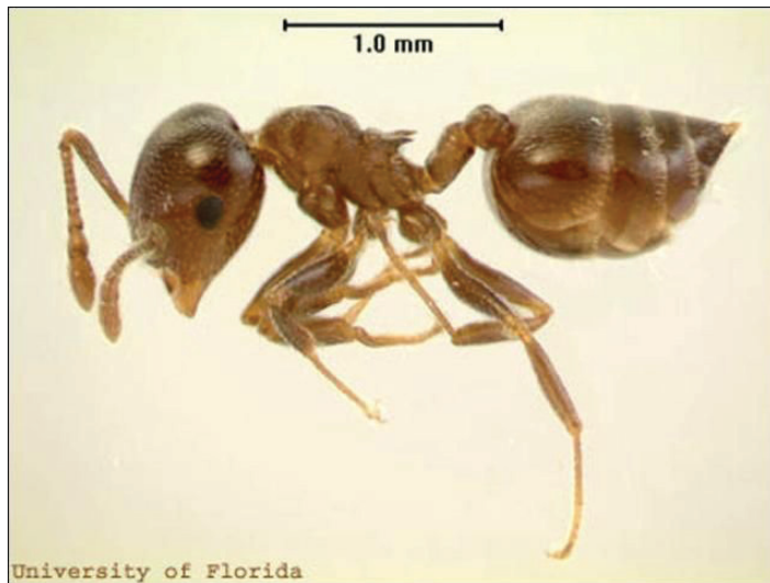
Figure 2. Worker acrobat ant, Crematogaster ashmeadi Emery.