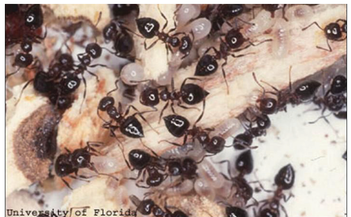
Figure 4. Workers and brood of the acrobat ant, Crematogaster ashmeadi Emery.

A colony of acrobat ants usually exists in each tree of such coastal plain pine forests, inhabiting the excavated chambers of cossid moth larvae and bark beetles. Acrobat ants are extremely territorial and only one colony exists in each tree, although a large colony may spread to up to three pine trees if trees are in close proximity to each other. Acrobat ants do not damage trees themselves, but rather move into spaces and chambers hollowed out and abandoned by other insects (Tschinkel 2002). Founding queens of Crematogaster ashmeadi search for abandoned galleries of wood boring beetles in the dead branches of longleaf pine saplings. Queens use these galleries as founding chambers to begin new colonies, and only one queen is found per nest (Hahn and Tschinkel 1997). Queens produce minim workers that rear brood and begin foraging. The queen then lays larger monomorphic workers and eventually moves, along with brood, to ex-termite galleries at or below ground level (Tschinkel 2002). Larvae are fed only with the food regurgitations from workers (Hölldobler and Wilson 1990). Colonies contain one queen, but multiple nest sites may occur. Communication and coordination of colony tasks must be highly coordinated as the colony is spread throughout the height of the pine tree, with the queen located at the very bottom of the tree (Tschinkel 2002).