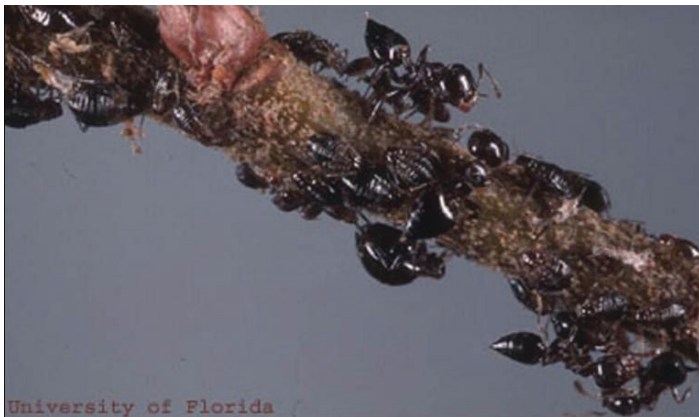
Figure 5. Workers of the acrobat ant, Crematogaster ashmeadi Emery, tending aphids.

Acrobat ants do not nest in sound wood but are found in damp or rotting wood (Swoboda and Miller 2003). The nesting capabilities of acrobat ants often depend on the activities of cavity-excavating insects such as caterpillars of the cossid moth, termites, and buprestid and cerambycid beetles (Tschinkel 2002).