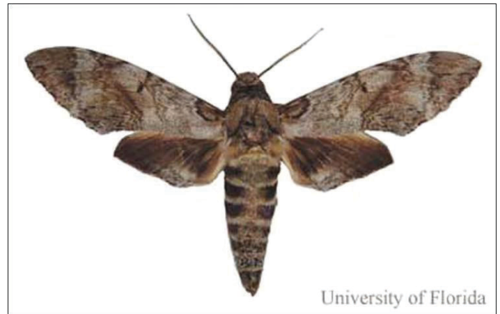
Figure 1. Pseudosphinx tetrio (Linnaeus) adult; dorsal view; wingspan 12.5 cm.

Other names in the literature synonymous with Pseudosphinx tetrio include Sphinx plumeriae (Fabricius), 1775 (Santiago-Blay 1985).