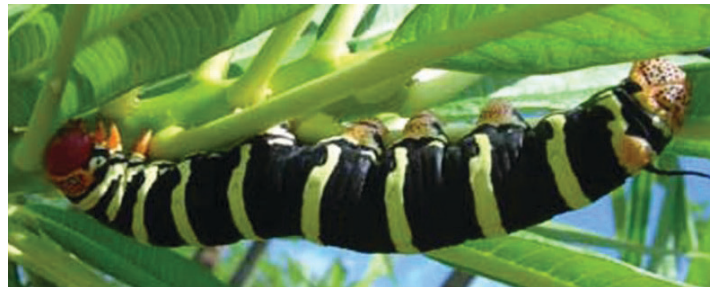
Figure 4. Pseudosphinx tetrio (Linnaeus) on Plumeria alba , Buck Island, St. Croix, U.S. Virgin Islands.