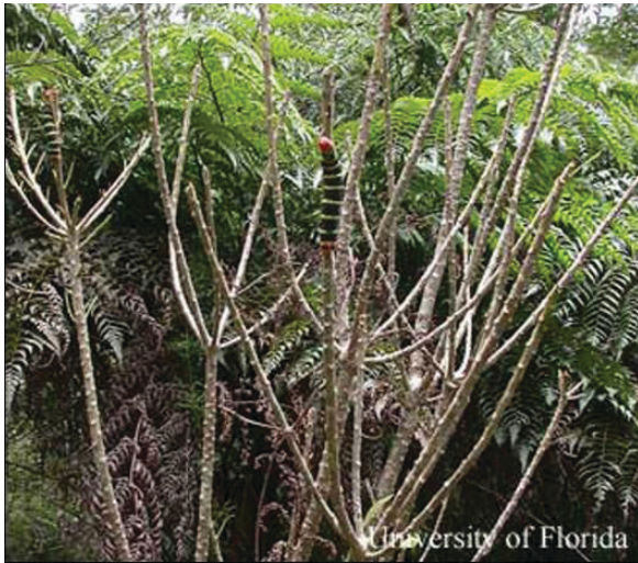
Figure 6. Pseudosphinx tetrio (Linnaeus) larvae defoliating a tree in Maricao Forest, Puerto Rico.

Use of a biorational or “soft” pesticide product with spinosad or Bacillus thuringiensis (B.t.) will also work (Gabel 2003). Their presence and feeding habits typically do not cause severe damage to hosts and trees typically survive Pseudosphinx tetrio defoliation.