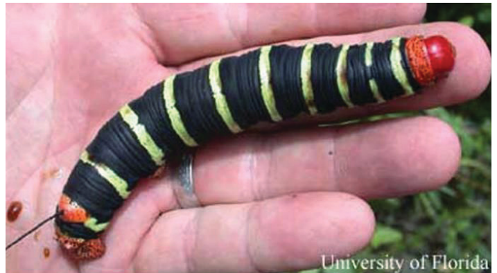
Figure 3. Pseudosphinx tetrio (Linnaeus) larva showing relative size on adult hand; Maricao Forest, Puerto Rico.

The dorsal forewing is brownish with a dark spot at the base of the costal margin and blurry gray and white markings. The dorsal hindwing is dark brown with white along the inner margin and the lower half of the outer margin. The body is striped with transverse grey-white bands and wider black ones. Average wingspan is 12.7 to 14 cm (5 to 5½ in) (females are typically larger than males and lighter in color).