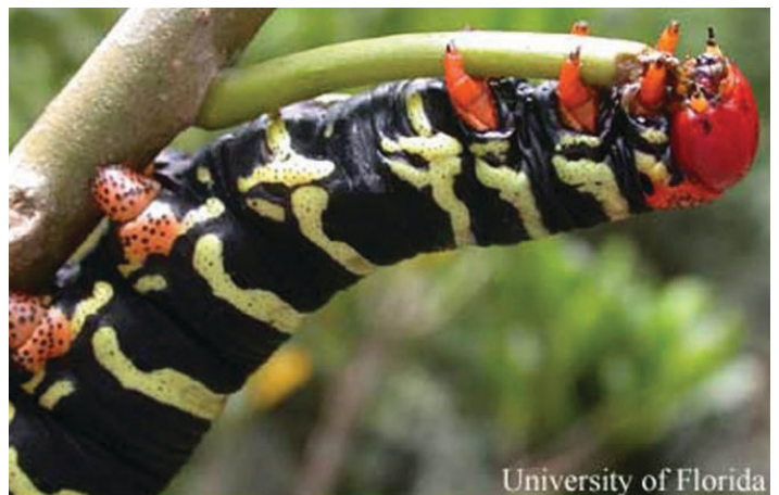
Figure 5. Close-up of Pseudosphinx tetrio (Linnaeus) larva feeding; Maricao Forest, Puerto Rico.