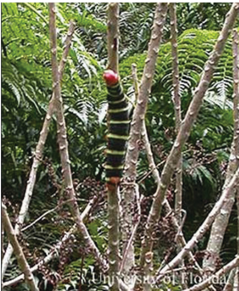
Figure 7. Closer view of Pseudosphinx tetrio (Linnaeus) larva defoliating a tree in Maricao Forest, Puerto Rico.