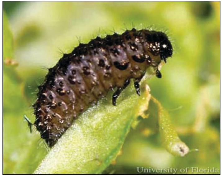
Figure 3. Yellowmargined leaf beetle, Microtheca ochroloma Stål, larva.

The larva is grayish to yellow-brown, covered with a fine layer of hairs, and has a dark, sclerotized head capsule that is brown or black. The mature larva spins a peculiar blackish network around itself prior to pupation.