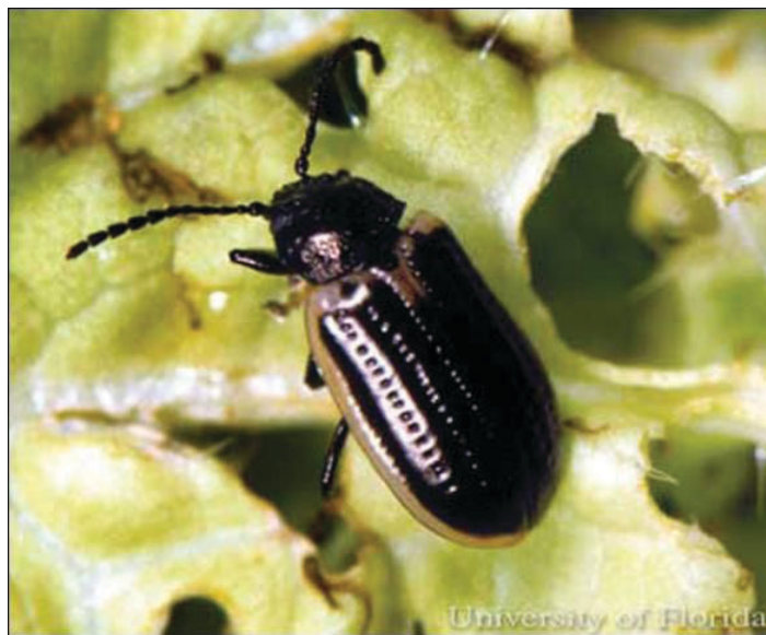
Figure 1. Adult yellowmargined leaf beetle, Microtheca ochroloma Stål.

genitalic differences. No other synonyms are listed in the literature (Woodruff 1974). Arnett (2000) lists two species of Microtheca in the United States, but only Microtheca ochroloma is of economic importance.