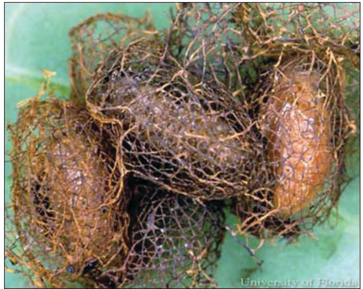
Figure 4. Yellowmargined leaf beetle, Microtheca ochroloma Stål, pupae in cocoons.

The pupal case is attached to the undersides of leaves, and their dark color stands out against the green foliage. The pupal stage lasts five to six days. New adults stay in the pupal case for about two days before emerging (Capinera 2001).