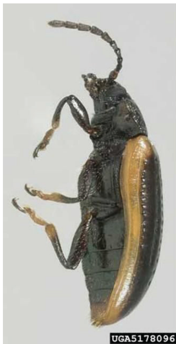
Figure 6. Lateral view of an adult yellowmargined leaf beetle, Microtheca ochroloma Stål.