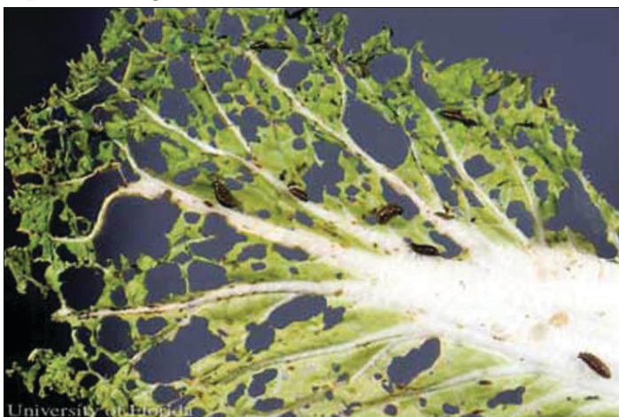
Figure 7. Yellowmargined leaf beetle, Microtheca ochroloma Stål, damage to leaf.

Bowers (2003) lists three reasons why the yellowmargined leaf beetle is such a problem to growers in Florida. The beetle's host plants thrive in the cool months from October to April, and this period comprises the growing season for organic farmers in Florida. During these months, hard frosts or freezes are rare, and the adult beetles can continue to feed and reproduce throughout the winter on an ample food supply. Finally, the yellowmargined leaf beetle is an introduced pest and has no known predators or parasites in the United States. Fortunately, this species seems to migrate at a slow rate, meaning it may not have the ability to rapidly expand its range under favorable conditions.