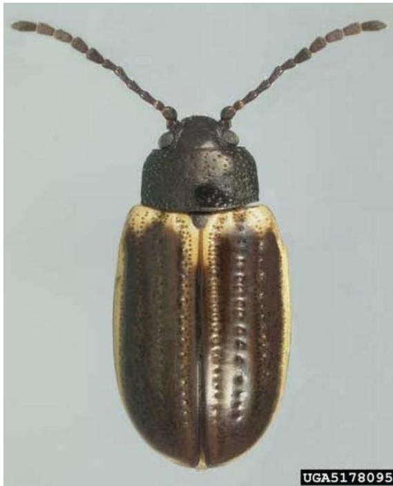
Figure 5. Dorsal view of an adult yellowmargined leaf beetle, Microtheca ochroloma Stål.