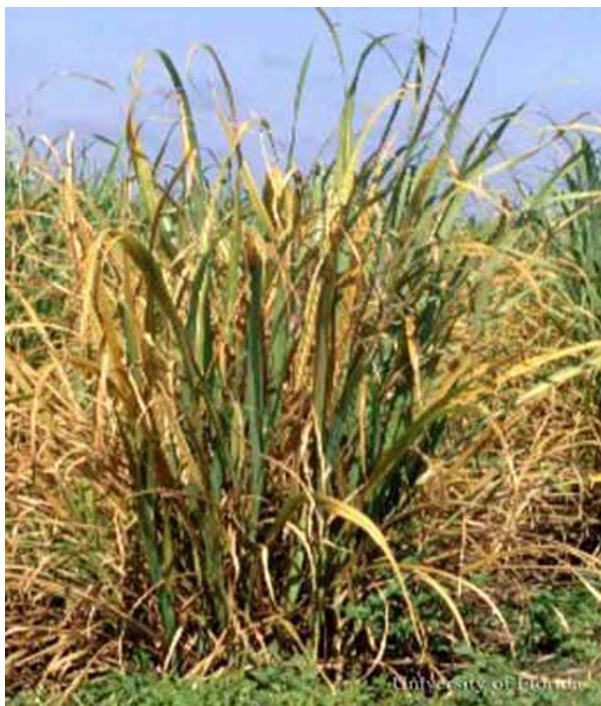
Figure 6. Damage to sugarcane plant in field, by yellow sugarcane aphids, Sipha flava (Forbes).