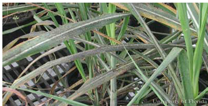
Figure 1. Sooty mold fungus growing on honeydew deposited on lower sugarcane leaves by yellow sugarcane aphids, Sipha flava (Forbes).

These aphids prefer to feed on the lower surfaces of leaves, lining up along the parallel leaf veins of their grass hosts. S. flava tolerates dense populations on the leaves and usually begin to move to other leaves only after the host leaf has become mostly yellow and begun to die. Honeydew produced by the feeding aphids collects on lower leaves and supports growth of sooty mold fungi.