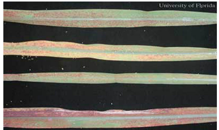
Figure 4. Sugarcane, Saccharum officinarum , varietal responses to yellow sugarcane aphid, Sipha flava (Forbes), feeding: yellowing, reddening, necrosis.

Feeding initially results in yellowing and reddening of leaves, depending on host plant and temperature. Prolonged feeding can lead to premature senescence of leaves and plant or stalk (sugarcane) death. Yield reductions usually occur due to feeding damage to early plant growth stages, including reduced tillering (Hall 2001). However, yield loss from late season feeding damage to sugarcane has also been documented (Miskimen 1970). Many sugarcane cultivars frequently have six to eight leaves below the terminal leaves. Yield can be reduced by 6% following the S. flava -induced death of as few as two of those leaves within the first three months of growth (Nuessly and Hentz 2002a). Chlorosis and death of three pairs of those leaves due to aphid feeding can result in 19% yield loss. Yellow sugarcane aphid also transmits sugarcane mosaic potyvirus (Blackman and Eastop 2000).