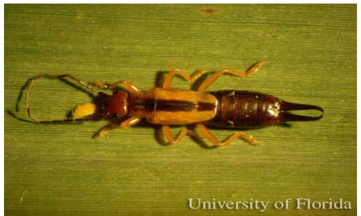
Figure 9. Male Doru terminatum earwig feeding on yellow sugarcane aphid, Sipha flava (Forbes), on sugarcane, Saccharum officinarum .