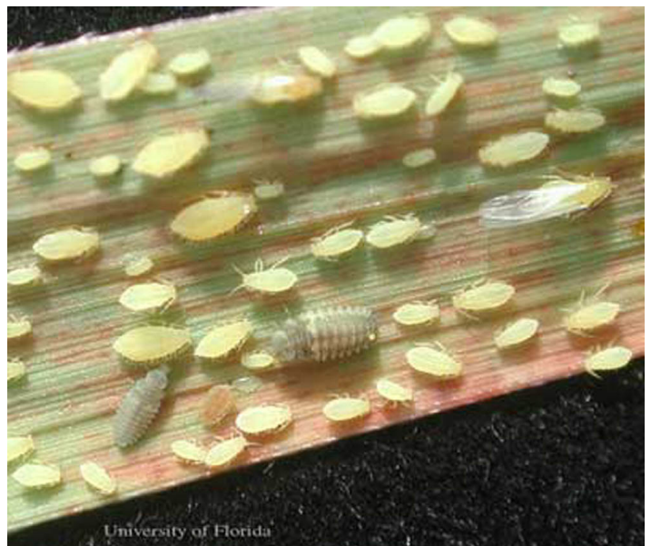
Figure 8. Diomus terminatus ladybird larvae feeding on yellow sugarcane aphids, Sipha flava (Forbes), on sugarcane, Saccharum officinarum .