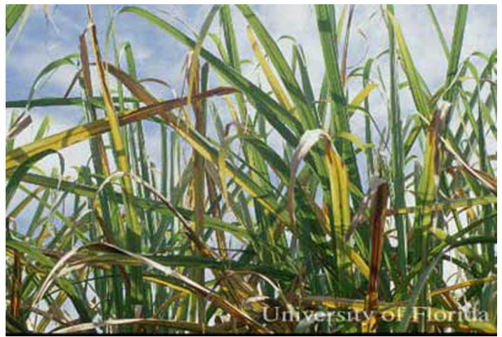
Figure 7. Yellow sugarcane aphid, Sipha flava (Forbes), damage to tops of late season sugarcane, Saccharum officinarum .