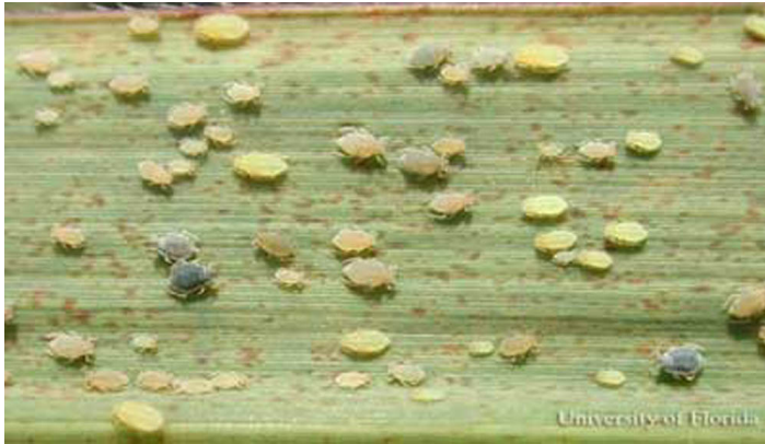
Figure 2. Mixed colony of white, Melanaphis sacchari , and yellow, Sipha flava (Forbes), sugarcane aphids on sugarcane, Saccharum officinarum .

It is not uncommon to find Melanaphis sacchari ('white sugarcane aphid') in small populations dispersed among S. flava on sugarcane leaves. Interestingly, S. flava does not produce an alarm pheromone, but it responds to the alarm pheromone of M. sacchari by quickly falling from the plant.