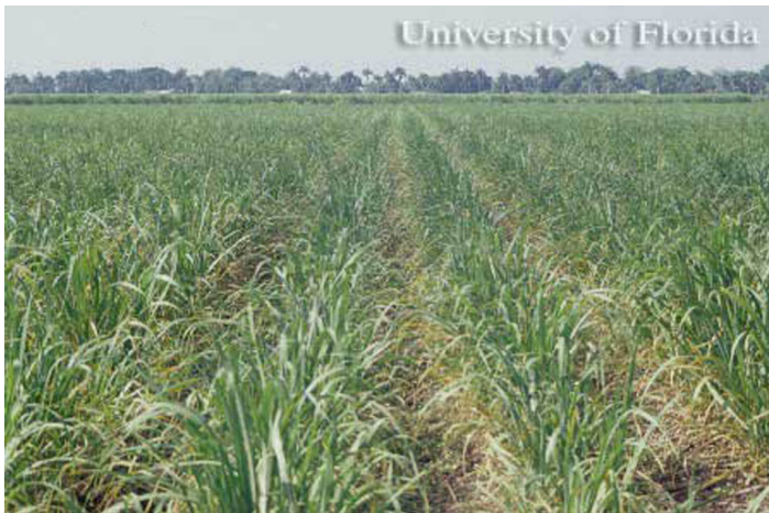
Figure 5. Yellow sugarcane aphid, Sipha flava (Forbes), damage to young sugarcane, Saccharum officinarum . Note yellow leaves displayed as stripes from field edge.

Parasitism by native parasitic wasps occurs rarely and none are known in Florida. An aphidiid parasitoid collected from France, Adialytus ambiguus (Haliday), was released and subsequently established in Hawaii in 1991 where it initially killed less than 10% of the yellow sugarcane aphids (Anon). Temperatures above 95°F and heavy rainfall from summer storms also are effective at reducing yellow sugarcane aphid populations.