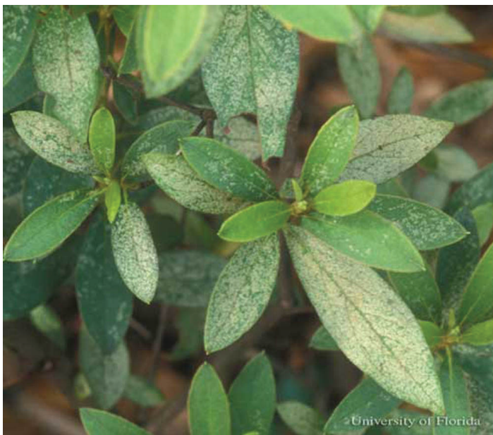
Figure 6. Damage caused by azalea lace bug, Stephanitis pyrioides (Scott), feeding.

Severely damaged leaves become heavily discolored and eventually dry or fall off. Symptoms may sometimes be confused with mite injury, but the presence of brown varnish-like excrement, frequently with cast skins attached, suggest lace bug damage (Johnson and Lyon 1991).