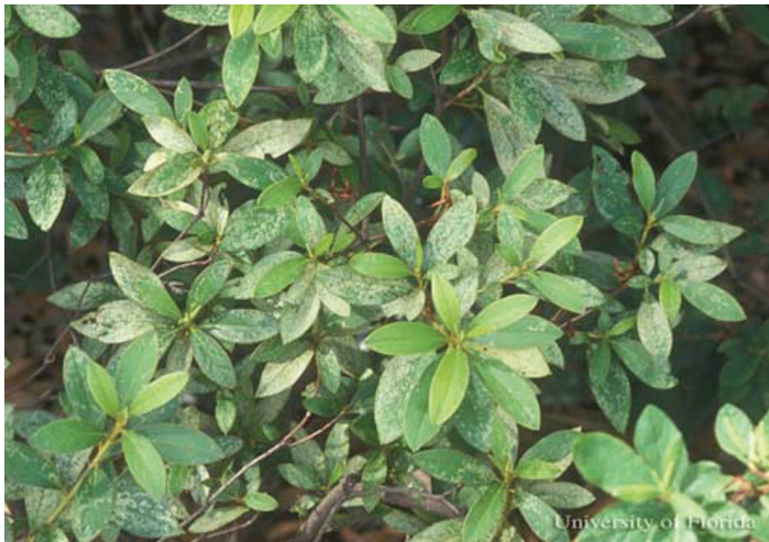
Figure 5. Damage caused by azalea lace bug, Stephanitis pyrioides (Scott), feeding.

more feeding injury than adult males and nymphs (Buntin et al. 1996). Lace bugs insert their stylet through stomata on the lower leaf surface and feed almost entirely on upper palisade parenchyma (Ishihara and Kawai 1981, Buntin et al. 1996). Because of the removal of most of the chlorophyll containing tissues located near the upper epidermis, the leaf surface become stippled, bleached, silvery or chlorotic.