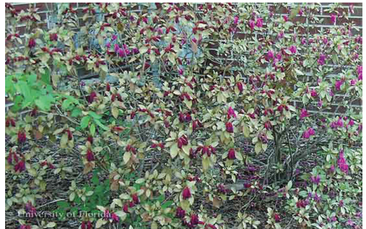
Figure 7. Severe damage caused by azalea lace bug, Stephanitis pyrioides (Scott), feeding.

Severely damaged leaves become heavily discolored and eventually dry or fall off. Symptoms may sometimes be confused with mite injury, but the presence of brown varnish-like excrement, frequently with cast skins attached, suggest lace bug damage (Johnson and Lyon 1991).