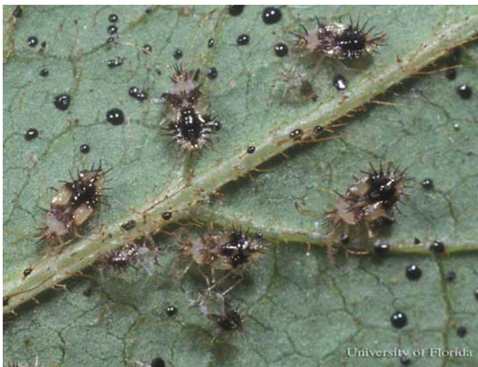
Figure 3. Nymphs of the azalea lace bug, Stephanitis pyrioides (Scott), with several cast skins and excrement.

The nymph is colorless upon hatching but soon turns black and spiny. It goes through five instars, ranging in size from 0.1 mm (0.004 inch) to 1.8 mm (0.07 inch). Wing pads can be seen after the fourth molt.