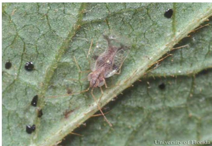
Figure 1. Adult azalea lace bug, Stephanitis pyrioides (Scott), and excrement.

Azalea lace bug, Stephanitis pyrioides (Scott), belongs to a group of insects in the family Tingidae. The insects in this family generally live and feed on the underside of leaves. They have thin lacy outgrowths on their thorax, and have delicate lace-like forewings (Drake and Ruhoff 1965). At least 17 species of lace bugs cause damage to ornamental trees and shrubs in the United States.