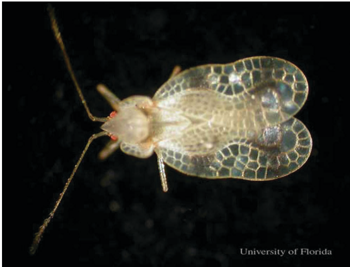
Figure 2. Adult azalea lace bug, Stephanitis pyrioides (Scott).

make it less apparent. When observed under a hand lens, a characteristic hood can be seen over the head.