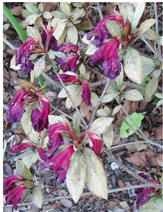
Figure 8. Severe damage caused by azalea lace bug, Stephanitis pyrioides (Scott), feeding.