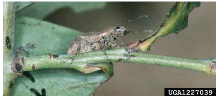
Figure 6. Leaf damage (background and upper right) by adult Fuller rose beetle, Pantomorus cervinus (Boheman). Notice the characteristic dark fecal material (lower left) adults leave on uneaten foliage.

Young larvae chew off the root hairs or rootlets, while older larvae girdle the lateral roots. Root damage results in poor and stunted growth as damaged roots cannot absorb water and nutrients efficiently. Plants with severely damaged roots may die during periods of drought or the root system may be predisposed to fungal infection ( Phytophthora spp.).