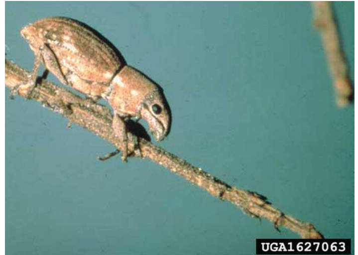
Figure 4. Lateral view of adult Fuller rose beetle, Pantomorus cervinus (Boheman).

The brownish grey (with intermixed white scales) adults are 6 to 8.5 mm long (~ 1/3 inch). Eyes are in lateral position and appear bulging; rostrum (snout) is slightly curved towards the ground. As the elytra (wing covers) are fused, the insect cannot fly.