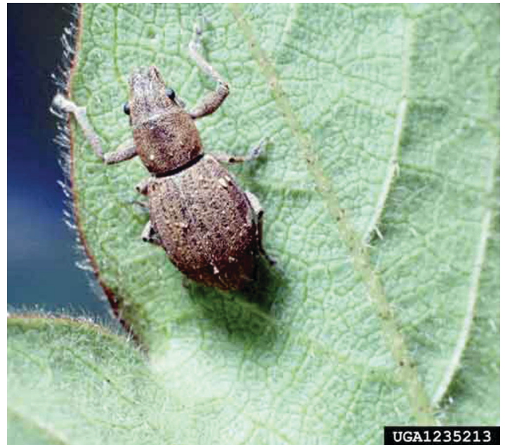
Figure 5. Dorsal view of adult Fuller rose beetle, Pantomorus cervinus (Boheman).