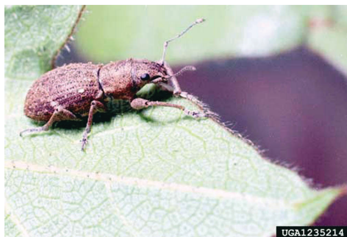
Figure 1. Adult Fuller rose beetle, Pantomorus cervinus (Boheman), on cotton leaf.

The Fuller rose beetle (FRB), Naupactus godmanni (Crotch), sometimes known as the Fuller rose weevil or Fuller's rose weevil, caused considerable damage to winter rose when it was first reported in the United States from California in 1879 (Chadwick 1965). Damage was also reported on other ornamental plants including camellias, geraniums, primroses, carnations, dracaenas, azaleas, cissus, begonias, lilies, and horticultural crops such as citrus, persimmon, apple, peach, plum, apricot, strawberry, raspberry, and blackberry (Chadwick 1965).