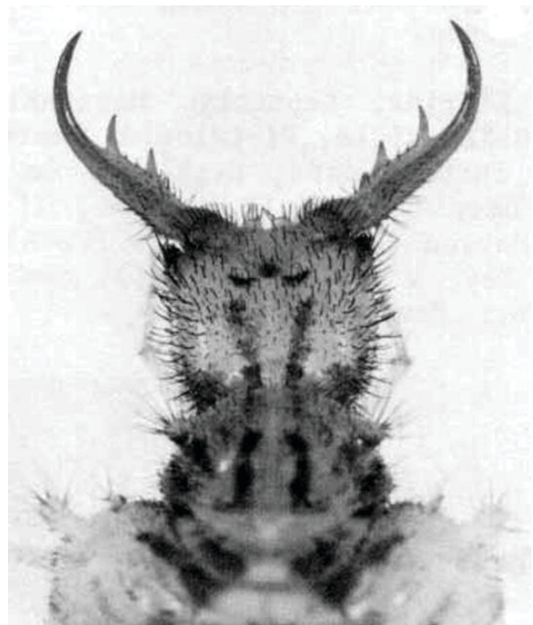
Figure 4. Dorsal view of the larval head of Glenurus gratus (Say), an antlion. Notice the two-toothed mandible, an identifying characteristic of this genus.

The authors found as many as three Glenurus larvae in one hollow, and in one instance, a larva of Dendroleon obsoletus (Say) was coinhabiting. Natural enemies and parasites are unknown. Larvae complete their life cycles in one or two years, depending on the abundance of food and the duration of warm nights during the year. Of two larvae reared by the authors, both constructed cocoons measuring