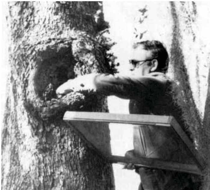
Figure 6. Typical habitat of the larvae of Glenurus gratus (Say), an antlion.