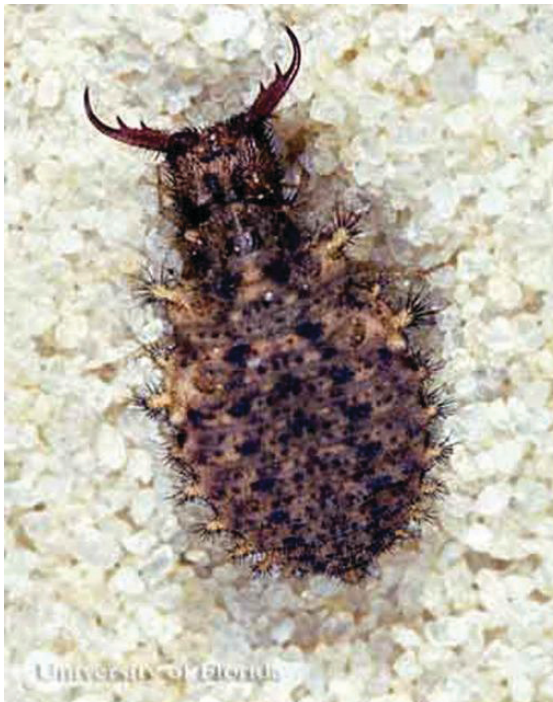
Figure 2. Larva of Glenurus sp., an antlion.

Antlion larvae share with other Planipennian Neuroptera the singular modification of the mandibles and maxillae to form a pair of sucking tubes. The curved, toothed mandibles and fusion of the hind tibia and tarsus are diagnostic in Florida except for the related family Ascalaphidae. Ascalaphid larvae are easily distinguished by the cordate posterior margin of the head. Many of the genera can be distinguished by the mandible, which can have one ( Paranthaclisis ), two ( Glenurus ), or three (rest of the genera) teeth.