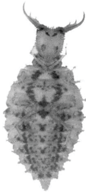
Figure 3. Ventral view of larvae of Glenurus gratus (Say), an antlion.

Oviposition and eggs are not known, but all three larval instars live in dry hollows of trees among fine wood particles, squirrel droppings, and other fecal matter and assorted debris. These hollows are large enough to allow for free movement of the larvae under the surface of the debris and are structured so that rainfall does not fully soak the contents of the hollow. The larvae may dig or run after prey, but not rapidly. At times, larvae may simply lie in wait. They feed on assorted insects found in their microhabitat such as termites, beetle larvae, and ants.