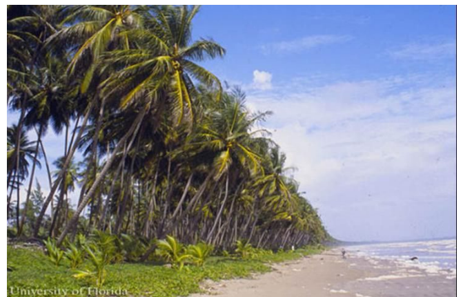
Figure 5. Coconut palms, Cocos nucifera L., on the beach at Manzanilla Bay, Trinidad.

A favorite motif in advertising tourist destinations in Florida and the Caribbean as well as other tropical locals is a view of a beach with gracefully swaying coconut palms stretching towards the sea. Additionally, coconut palms find a place in many designed landscapes of resort areas in these regions and are treasured by many homeowners. Damage by coconut mite is not highly noticeable from a distance, thus it often has no significant impact on the aesthetic appearance of palms on beaches and in many landscape situations. As a pest of ornamental plants, coconut mite is most important to homeowners or managers of areas where palms are seen up close, such as in the landscaping around hotel swimming pools.