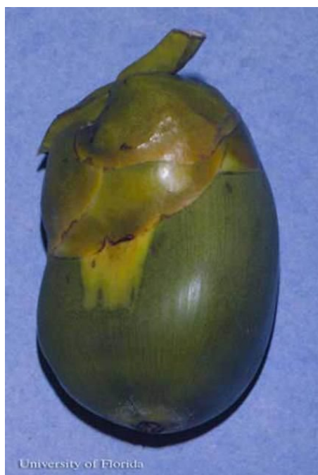
Figure 6. Early damage to a young coconut by Aceria guerreronis Keifer, a coconut mite. Note the pale triangular area.

covering a large portion of the surface. In older damage, the affected surface is suberized (cork-like), with deep longitudinal fissures that may be intersected by horizontal cracks.