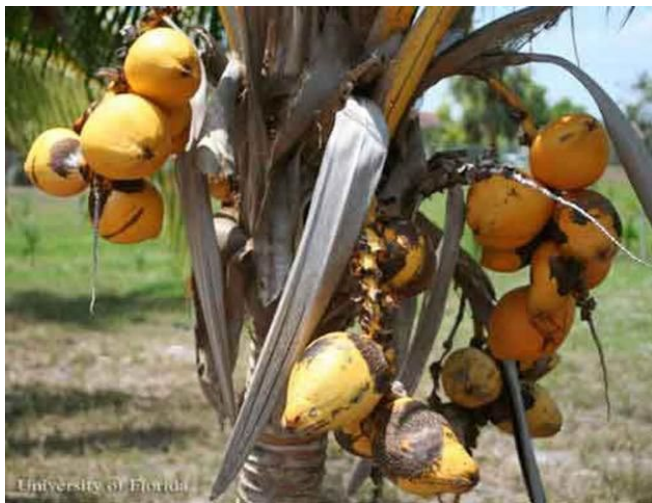
Figure 4. A Red 'Spicata Dwarf' coconut palm, Cocos nucifera L., with damage from Aceria guerreronis Keifer, a coconut mite.

Coconut palm varieties differ in their susceptibility to coconut mite. Almost all varieties probably have some level of susceptibility.