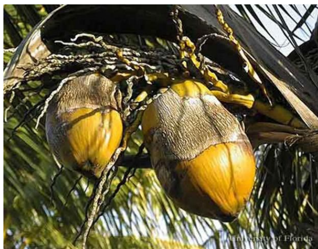
Figure 3. Coconuts with damage by coconut mite, Aceria guerreronis Keifer.

Coconut mites probably disperse from one palm to the other on air currents, or by phoresy (e.g., carried on insects or birds that visit palm flowers). Where coconut palm plantings are dense, mites possibly crawl from the foliage of one palm to that of an adjacent palm and ultimately arrive on a fruit. Their inefficient host-finding capabilities seem to be compensated for by a high reproductive rate.