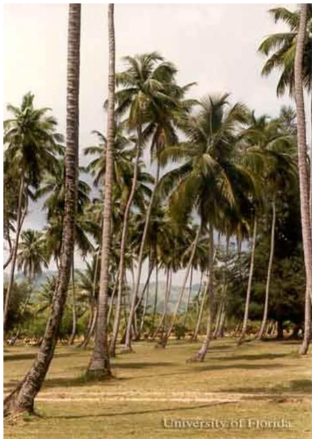
Figure 8. Coconut palms, Cocos nucifera L., of the 'Jamaica Tall' variety at Tres Hermanos Beach, near Añasco, Puerto Rico. The coconuts are periodically pruned from palms at this resort area.