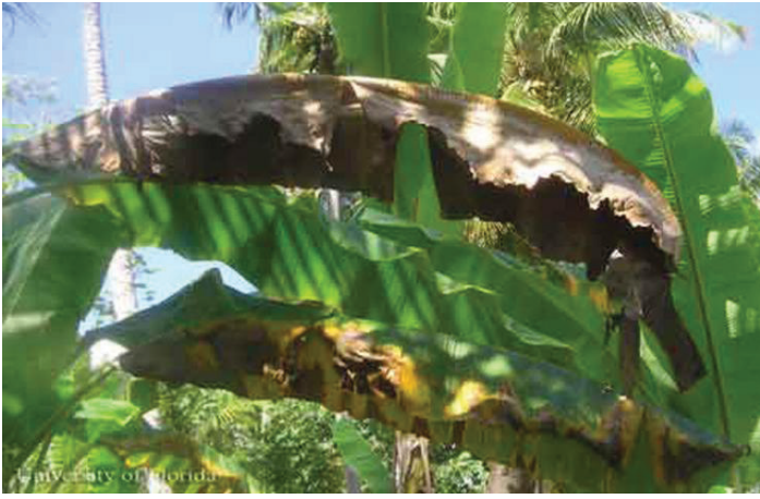
Figure 5. Damage to banana caused by the red palm mite, Raoiella indica Hirst.