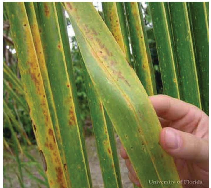
Figure 4. Close up of palm damage caused by the red palm mite, Raoiella indica Hirst.