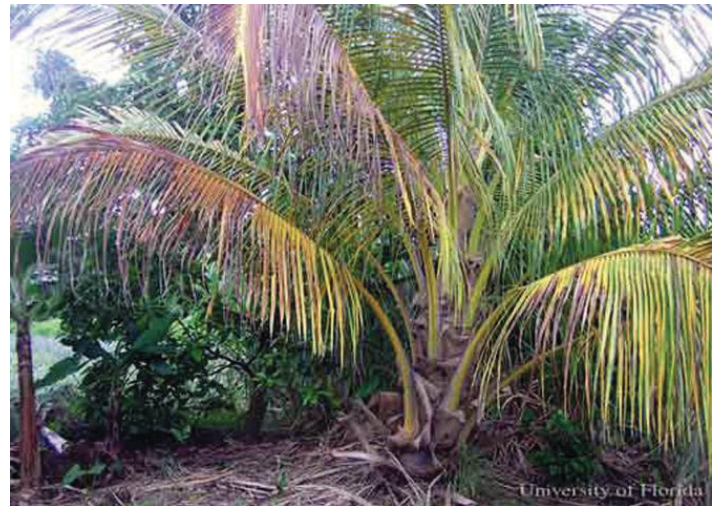
Figure 3. Severe damage to palm caused by the red palm mite, Raoiella indica Hirst.

and older coconut palms in St. Lucia strongly support the premise that the mite was primarily dispersed by wind currents. The mite is spreading to other exotic and ornamental palms. In Dominica, where coconut is grown with bananas, the mite shifted to this new host with numbers close to 200 mites/cm 2 . The lower leaves of banana and plantain turn yellow with small patchy green-yellow areas. Most of the mites are on the lower leaf of the host plant and the presence of yellow coloration on the upper surface of the leaf corresponds to the presence of a mite colony on the underside of the leaf.