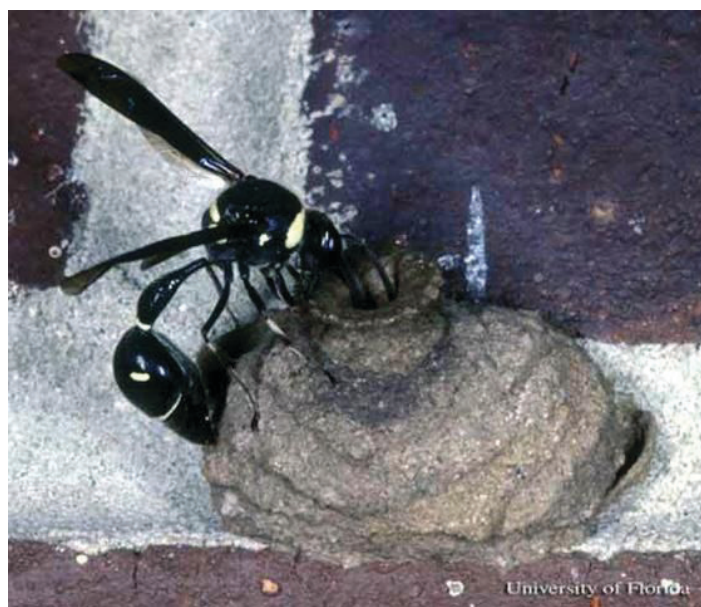
Figure 1. Adult potter wasp, Eumenes fraternus Say.

Eumenes fraternus occurs from about the 100 th meridian eastward in the United States and Canada. The nominate subspecies of Eumenes smithii is found in the southern states from Mississippi eastward and North Carolina southward. The subspecies Eumenes smithii belfragei Cresson occurs from Mexico northward through eastern Texas, Oklahoma, Kansas, and eastward to Missouri and Arkansas.