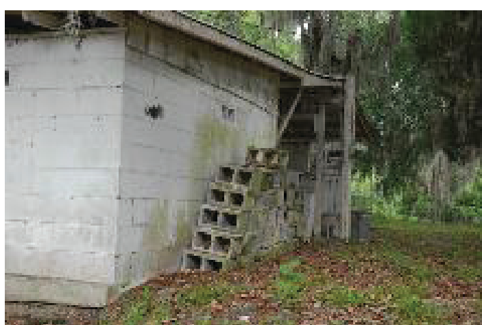
Figure 10. Cinderblocks. Credits: undefined