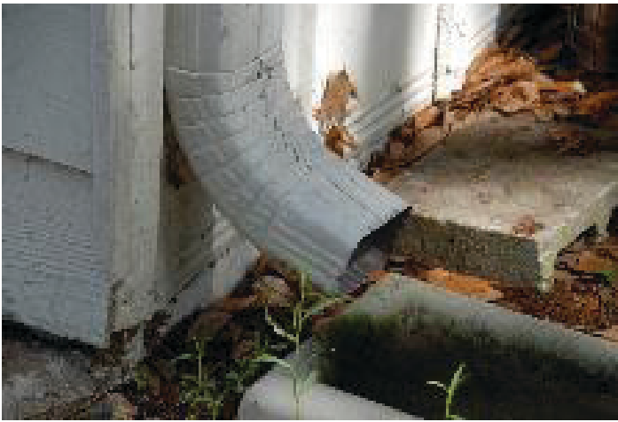
Figure 18. Gutter downspout.