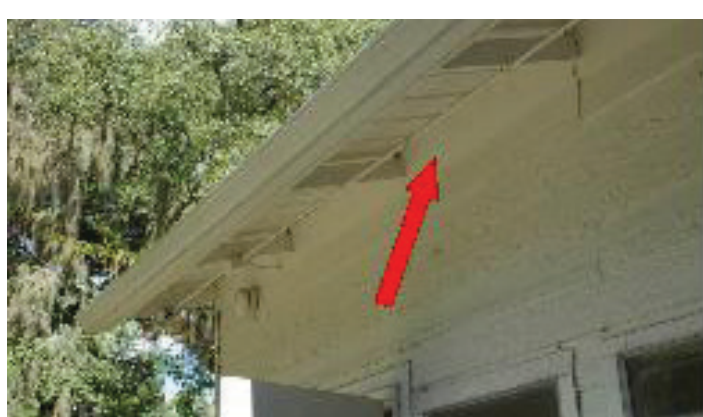
Figure 11. Under eave of house.