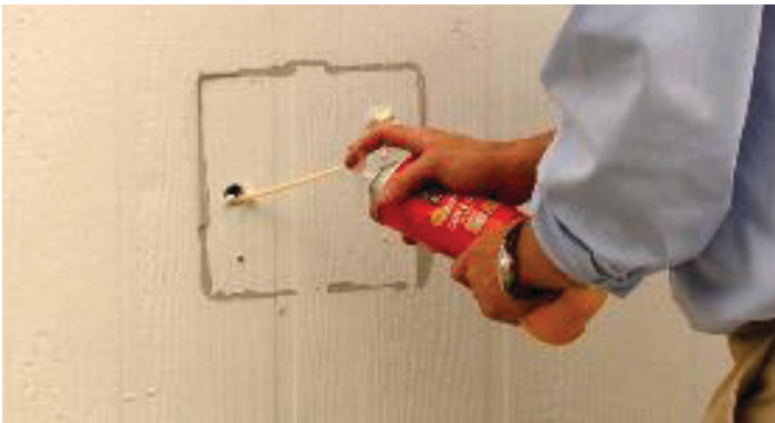
Figure 21. Foaming holes inside of a building.