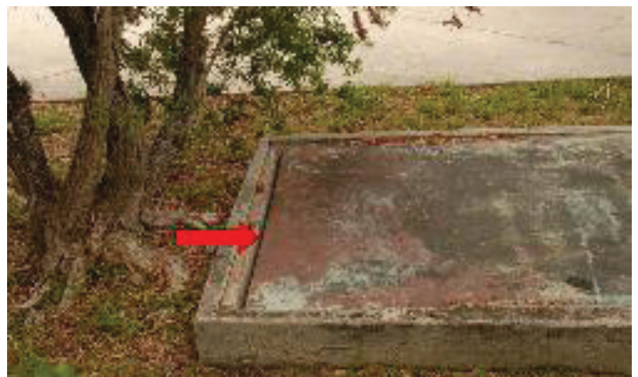
Figure 5. Open space in metal drain cover. Credits: undefined

Other sites where colonies have been found include eaves, hollow trees, abandoned vehicles, empty containers, fence posts, lumber piles, utility infrastructure, old tires, tree branches, garages, outbuildings, sheds, walls, chimneys, playground equipment, etc.