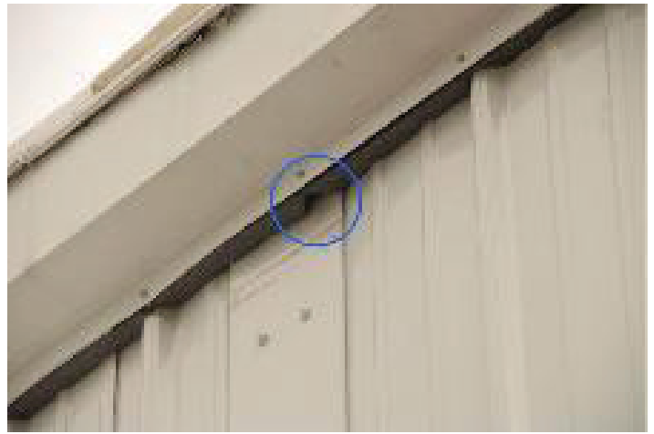
Figure 3. Small hole in siding leading to a cavity in the wall. Credits: undefined

Although this type of nesting site may be the first choice for the bees, they certainly will nest at many other locations. Some of these locations are difficult to bee-proof; therefore, it is important that regular inspections are done to monitor for any bee activity. Examine the following pictures as a reference point for your inspections. They include examples of places that are difficult to bee-proof.