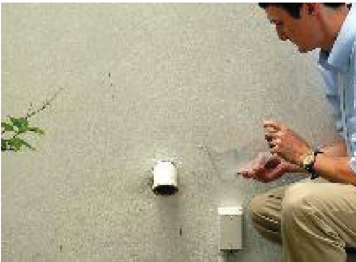
Figure 19. Placing screening over pipe.