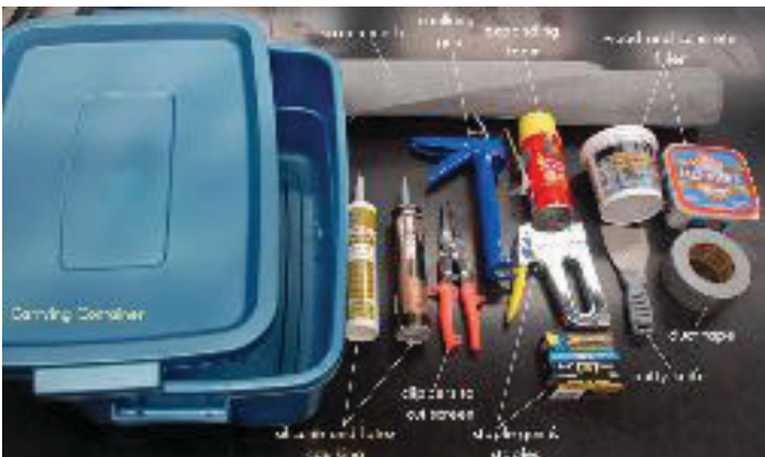
Figure 22. Bee-proofing tools.

Silicone and latex caulking, caulking gun, roll of screen mesh, clippers to cut screen, staple gun, staples, wood filler, concrete filler, putty knife, duct tape, expanding foam, and carrying container.