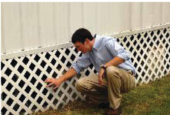
Figure 8. Inspecting under house. Credits: undefined