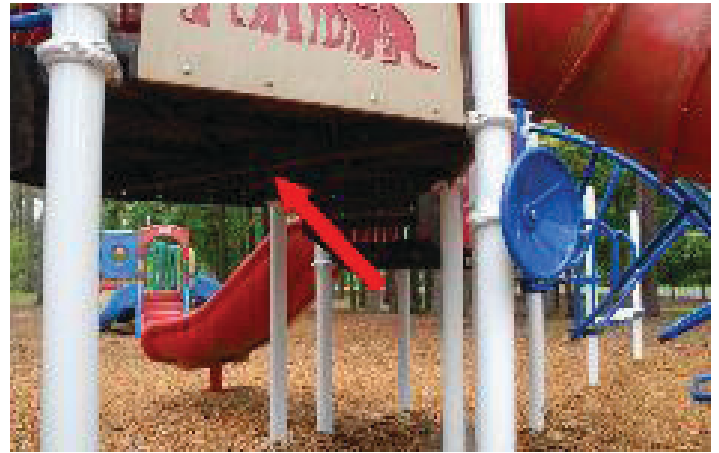
Figure 15. Under playground equipment. Credits: undefined