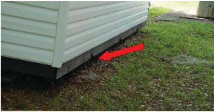
Figure 12. Opening under shed. Credits: undefined