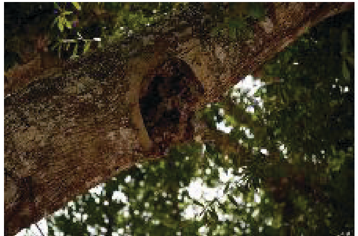
Figure 4. Cavity in a tree branch. Credits: undefined