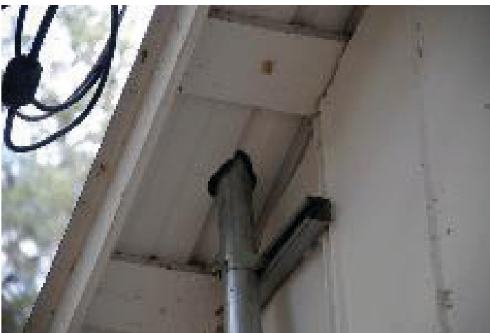
Figure 14. Opening around pipe. Credits: undefined