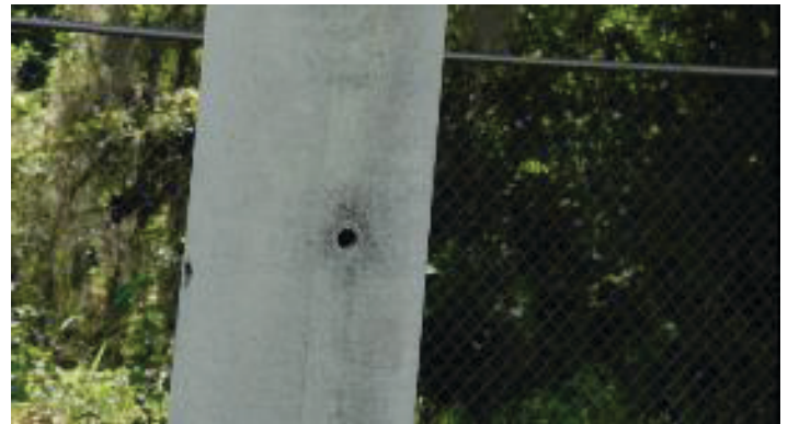
Figure 16. Small hole in power pole. Credits: undefined