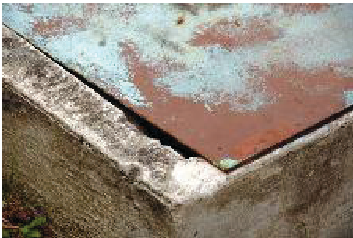
Figure 6. Crack in cement that creates opening. Credits: undefined