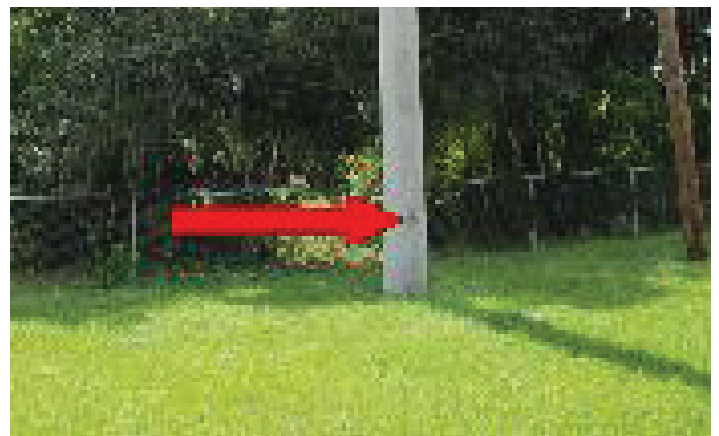
Figure 17. Small hole in power pole. Credits: undefined