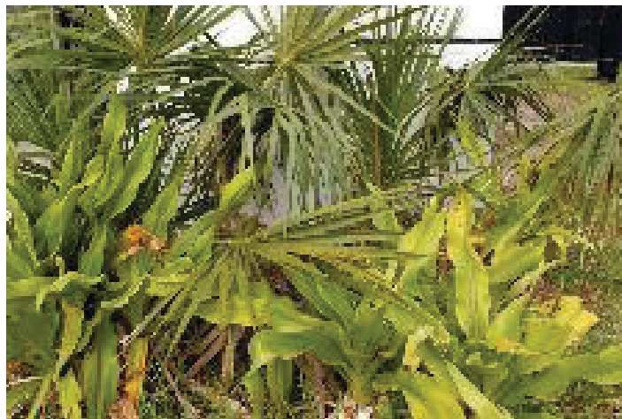
Figure 9. Dense shrubs and bushes.