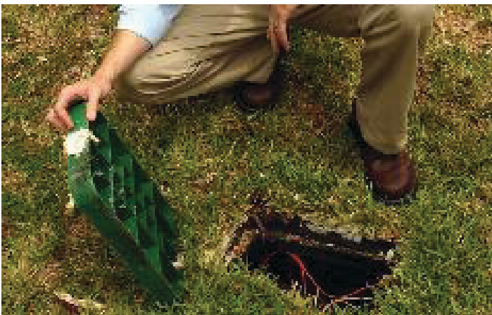
Figure 2. Open water meter. Credits: undefined

Although this type of nesting site may be the first choice for the bees, they certainly will nest at many other locations. Some of these locations are difficult to bee-proof; therefore, it is important that regular inspections are done to monitor for any bee activity. Examine the following pictures as a reference point for your inspections. They include examples of places that are difficult to bee-proof.