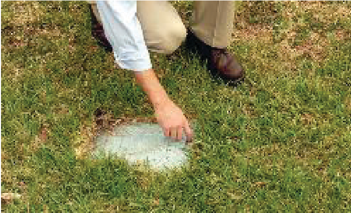
Figure 1. Closed water meter. Credits: undefined

The first step in eliminating areas that may be attractive to honey bee nests is actually these areas—think like a swarm. What areas might bees favor as a nesting site? AHBs, especially, have been known to nest almost anywhere, yet all honey bees favor certain sites over others. Sites that are potentially attractive to honey bee colonies consist of a small opening that accesses a protected cavity. Examples are water meters, manholes, holes in a structure that lead to open space inside a wall, gutter down-spouts, pipes, etc. Examine these photos as a reference.