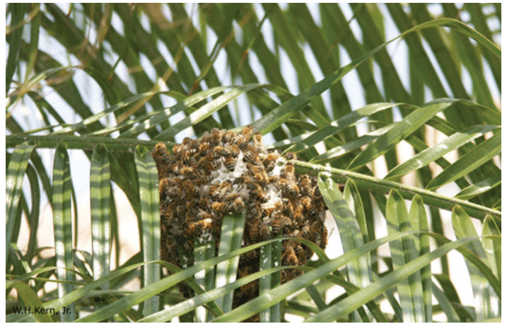
Figure 13. Newly formed colony on palm frond. Notice that the bees are beginning to construct comb.