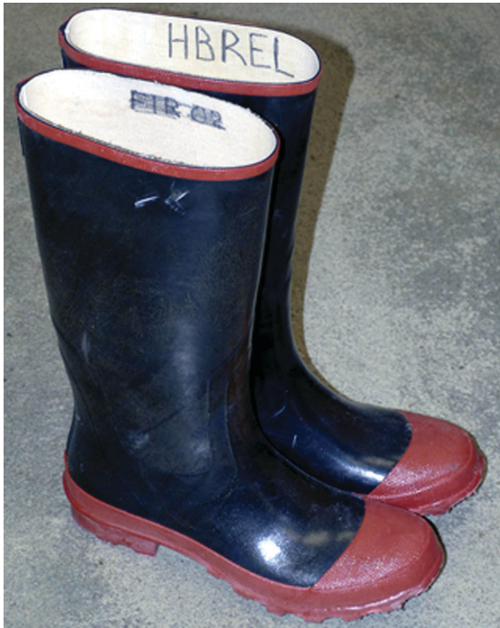
Figure 5. Rubber boots can be used for protection against pesticides.

Boots should provide foot and ankle protection for the PCO. Many PCOs use leather boots, but rubber boots may be better protection when using pesticides. Always check the pesticide label to verify for required PPE.