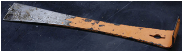
Figure 20. A hive tool can greatly assist PCOs when removing comb from a colony.

A sting suit, veil, hat, leather gloves, duct tape, and foot and ankle protection (boots) should always be used for protection from defensive colonies. A hive tool, respirator, garbage bags, broom, dustpan, vacuum, hose extension, and water are needed for clean-up and comb removal purposes. Colonies are often found within the walls of a structure, so a drywall saw, reciprocating saw, circular saw and blades, a drill with 1/16" bit, and a stethoscope are required to access such colonies. A ladder is needed to access elevated colonies while a shovel may be used for underground nests. Insect screen, caulk, wood/concrete filler, 1/8" hardware cloth, and a staple gun are used for bee-proofing an area after the colony has been removed. Wooden stakes and colored tape should be used to block off the area prior to removal.