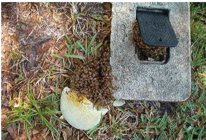
Figure 17. Colony nesting in a water meter box.

The state of Florida recommends that nuisance honey bees ( https://edis.ifas.ufl.edu/in1005 and https://edis.ifas.ufl.edu/in790 ) found nesting outside of hives managed by a beekeeper (like those nesting in tree cavities, walls, water meter boxes, etc.) be either (1) removed alive from the nest site by a registered beekeeper ( https://www.fdacs.gov/Divisions-Offices/Plant-Industry/Business-Services/Registrations-and-Certifications/Beekeeper-Registration ) or (2) eradicated by a licensed PCO. It is the responsibility of the property owner to deal with an unwanted swarm ( https://edis.ifas.ufl.edu/in970 ) or colony of honey bees. To find a registered beekeeper or PCO who offers removal or eradication services, visit: http://entnemdept.ufl.edu/honey-bee/beekeeper-resources/bee-removal/ click on "Find a Bee Removal Expert in your area". For more information on African honey bees, see https://edis.ifas.ufl.edu/topic_africanized_honey_bee .