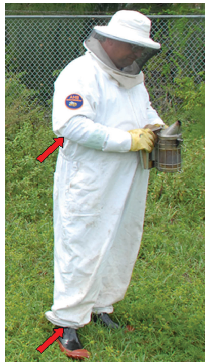
Figure 4. A full suit includes elastic around pant cuffs and sleeve cuffs. Some veils, as pictured here, are attached to the suit with a zipper. Rubber boots are a good option for full protection. Gloves' gauntlets should extend onto forearm. Arrows indicate areas where duct tape should be used to seal gloves and boots to suit.

The sting suit or bee suit should cover the full length of arms and legs as well as the complete torso. Elastic should cinch around ankles and wrists to prevent bees from entering the suit. PCOs should tape gloves and boots to the suit for additional protection. It may be helpful to order bee suits one or two sizes larger than would be usual in order to increase the distance between the skin and the bee suit; this precaution may protect a PCO from being stung through the bee suit.