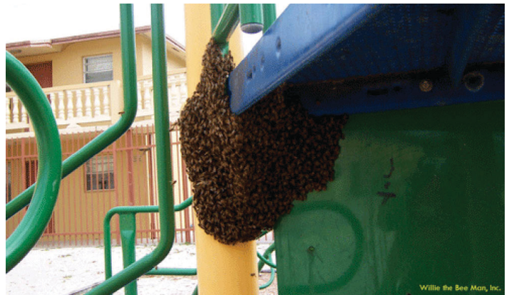
Figure 6. A swarm that settled on playground equipment.

A swarm of bees can be found almost anywhere (the side of a wall, a tree branch, a light post, etc.); swarms are usually described as a ball or clump of bees. Swarms that have settled on an object (wall, palm frond, bicycle seat, etc.) should be removed before they move to their permanent nest site, or before they start building comb and exhibiting defensive behavior. They are easiest to remove during the swarm stage. In most cases, swarming bees are remarkably docile because they have no nest to protect.