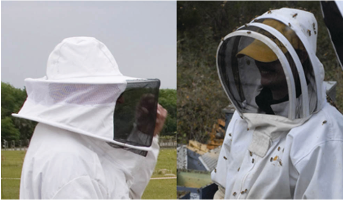
Figure 1. Two types of veils that zip to the sting suit; these types of veils provide the best protection because they do not allow any bees to enter if zipped properly.

attach with a zipper to the sting suit are the recommended type because they prohibit bee entry. Detachable veils may be helpful if head protection (hard hat, pith helmet, etc.) needs to be interchanged.