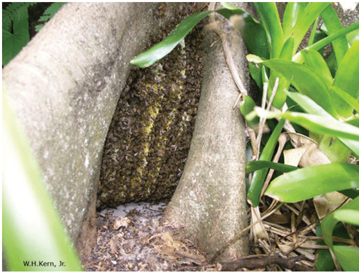
Figure 11. Colony established between exposed buttress trunk.

Colony nest location can vary depending upon many variables (type of honey bee, other available nesting sites, etc.). AHBs, especially, have been known to nest almost anywhere; yet all honey bees favor certain sites over others. Sites that are potentially attractive to honey bee colonies consist of a small opening that accesses a shaded, enclosed area. However, African honey bees often nest in open, exposed areas. Examples include eaves under roofs, water meters, manholes, electrical boxes, holes in a structure that lead to a void inside a wall, gutter down-spouts, etc. Examine these photos as references.