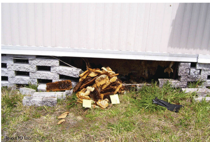
Figure 18. Colony removed from the underside of building.