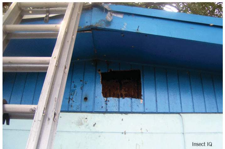
Figure 15. Colony removed from inside a wall under the eave of building.