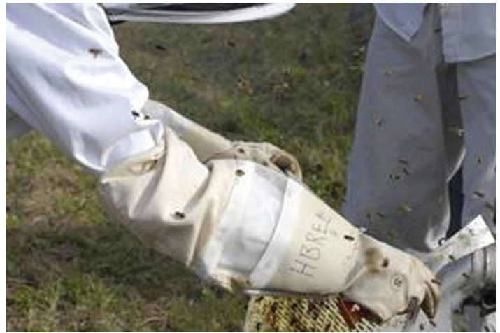
Figure 3. Leather gloves with an extended gauntlet; rubber gloves may also be appropriate for use with pesticides.

Gloves provide complete hand protection for the PCO. They should have a gauntlet that extends onto the forearm and cinches there with elastic over the sting suit. Gloves should also be taped to the jacket/suit using duct tape to prevent bees from entering. Usually leather gloves with an extended gauntlet are used to enhance protection; gauntlet-extended rubber gloves may also be appropriate for use with pesticides. Always check the pesticide label to verify.