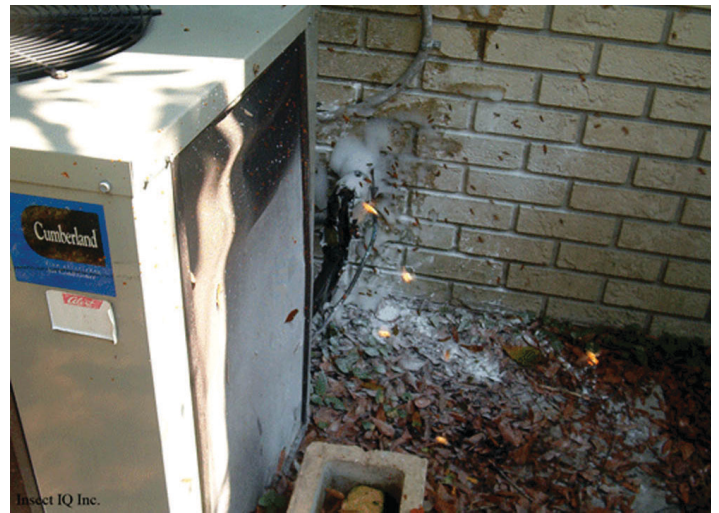
Figure 22. Colony eradicated from wall behind AC unit. Foam was used to block the entrance.

Aerosols can be directed into nest openings and used for a fast knockdown kill, yet they do not provide residual protection.