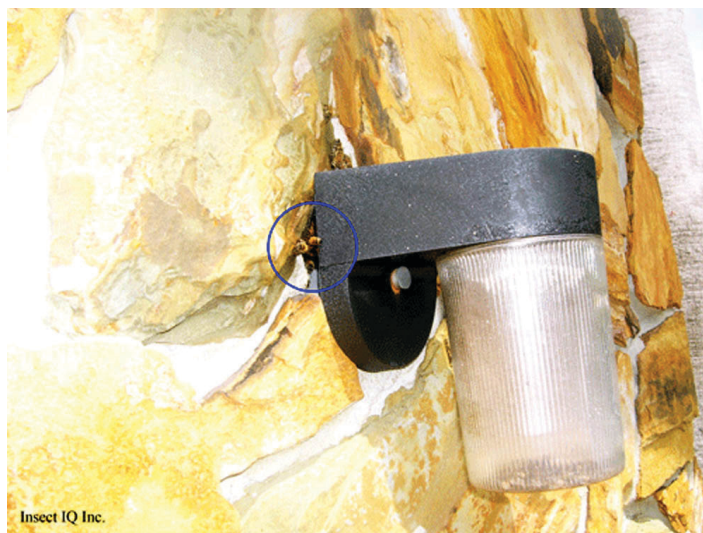
Figure 19. Colony nesting within a wall using a hole behind a light fixture as its opening.