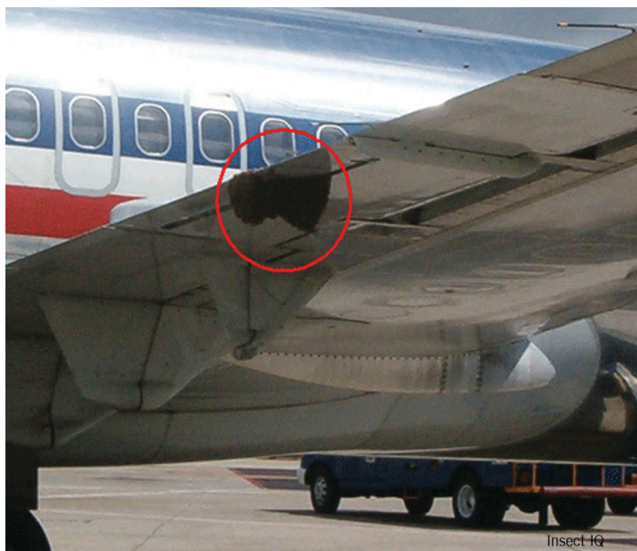
Figure 8. A swarm (circled) that settled on underside of an aircraft wing.