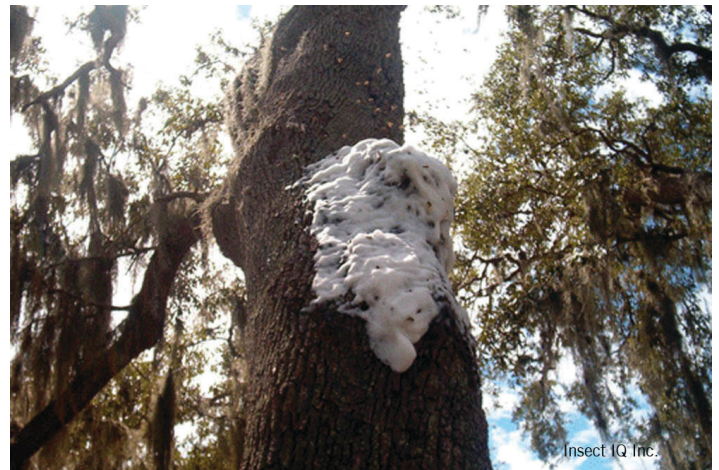
Figure 23. Foam used to subdue colony established in tree.