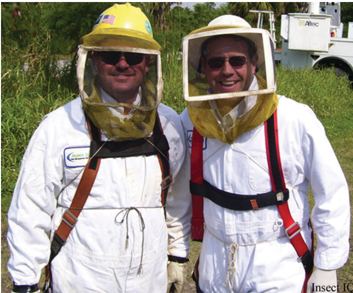
Figure 2. PCOs wearing full PPE. These veils are detachable and do not provide the same level of protection that veils which zip to the sting suit do; however, detachable veils are beneficial if a PCO needs to wear a hard hat or interchange head protection.