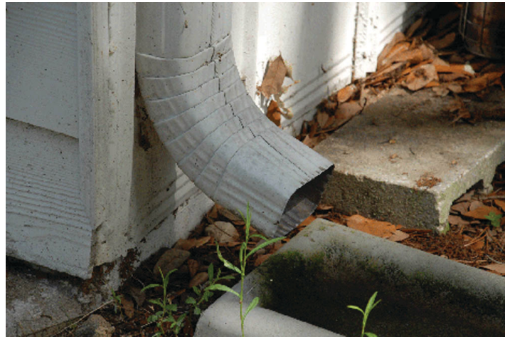
Figure 14. Gutter downspout—a possible colony nest site.