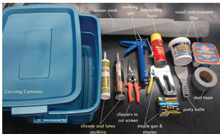
Figure 21. Equipment needed for bee-proofing.