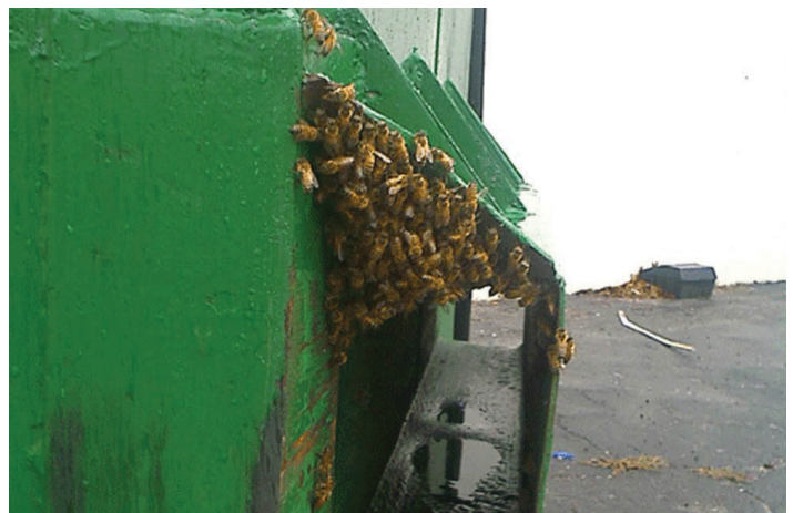
Figure 7. A swarm that settled on refuse dumpster.