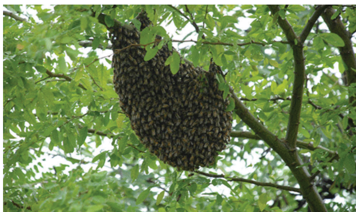
Figure 9. A swarm that settled on a tree branch.