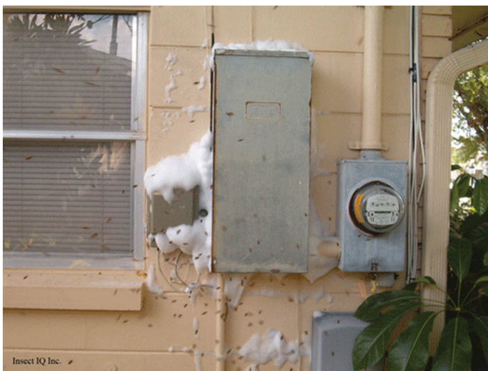
Figure 16. Colony nesting in wall around electrical box. The white foam is insecticidal foam.