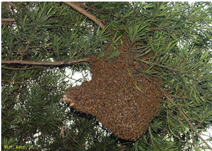
Figure 12. Newly formed colony on palm frond. Notice that the bees are beginning to construct comb.