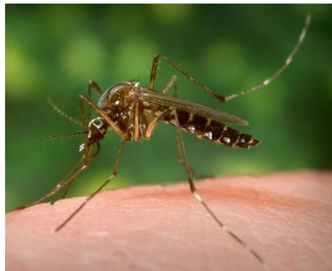
Figure 1. Adult female yellow fever mosquito, Aedes aegypti (Linnaeus), in the process of seeking out a penetrable site on the skin surface of its host.

The yellow fever mosquito, Aedes aegypti (Linnaeus), has been a nuisance species in the United States for centuries. Originating in Africa, it was most likely brought to the new world on ships used for European exploration and colonization (Nelson 1986). As the common name suggests, Aedes aegypti is the primary vector of yellow fever, a disease that is prevalent in tropical South America and Africa and often emerges in temperate regions during summer months. During the Spanish-American War, U.S. troops suffered more casualties from yellow fever transmitted by Aedes aegypti than from enemy fire (Tabachnick 1991).