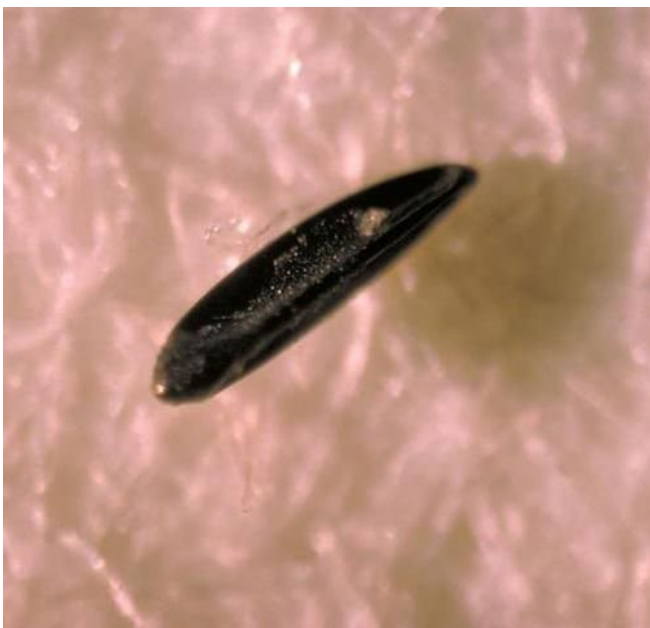
Figure 8. Egg of the yellow fever mosquito, Aedes aegypti (Linnaeus).

Eggs of Aedes aegypti are long, smooth, ovoid shaped, and approximately 1 mm (1/32 in) long. When first laid, eggs appear white but within minutes turn a shiny black. In warm climates, such as the tropics, eggs may develop in as little as two days, whereas in cooler temperate climates, development can take up to a week (Foster and Walker 2002). Aedes aegypti eggs can survive desiccation for months and hatch once submerged in water, making the control of Aedes aegypti difficult (Nelson 1984).