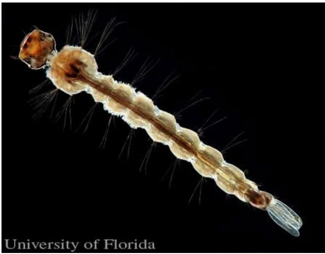
Figure 11. Fourth instar larva of the yellow fever mosquito, Aedes aegypti (Linnaeus).