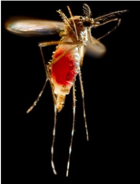
Figure 7. An adult female yellow fever mosquito, Aedes aegypti (Linnaeus), with a newly obtained fiery red blood meal visible through her now transparent abdomen. The now heavy female mosquito takes flight as she leaves her host's skin surface. After having filled with blood, the abdomen became distended, stretching the exterior exoskeletal surface, causing it to become transparent, and allowed the collecting blood to become visible as an enlarging intra-abdominal red mass. Note also the clearly defined head, mouth parts, and legs.

Females are larger than males and can be distinguished by small palps tipped with silver or white scales. Males have plumose antennae, whereas females have sparse short hairs. When viewed under a microscope, male mouthparts are modified for nectar feeding, and female mouthparts are modified for blood feeding. The proboscis of both sexes is dark, and the clypeus (segment above the proboscis) has two clusters of white scales. The tip of the abdomen comes to a point, which is characteristic of all Aedes species (Cutwa-Francis and O'Meara 2007).