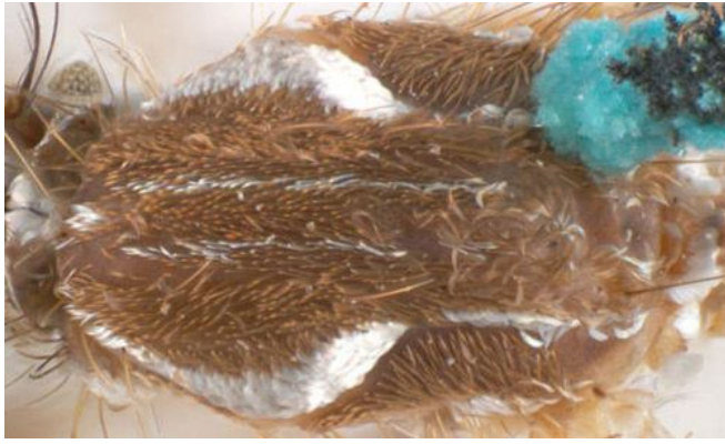
Figure 5. Close-up of the "lyre" on an adult yellow fever mosquito, Aedes aegypti (Linnaeus).