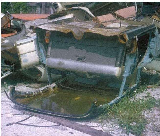
Figure 16. Domestic mosquitoes can breed in junk yards, open dumps, or anywhere stationary water collects.