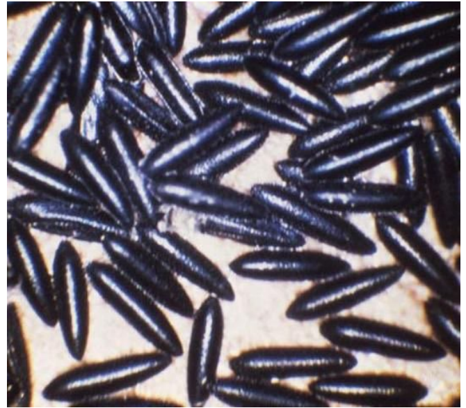
Figure 9. Eggs of the yellow fever mosquito, Aedes aegypti (Linnaeus).