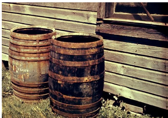
Figure 13. Rain barrels around the home are prime breeding locations for the yellow fever mosquito, Aedes aegypti (Linnaeus).

Aedes aegypti control first began in the early 1900s, when officials in South America began treating water tanks with insecticide in order to reduce the number of adult mosquitoes. After initial success, efforts were decreased on the assumption that the populations of yellow fever mosquitoes would not return. However, within a decade, Aedes aegypti populations returned to levels seen before the water treatments had occurred and urban yellow fever was again rampant (Severo 1959).