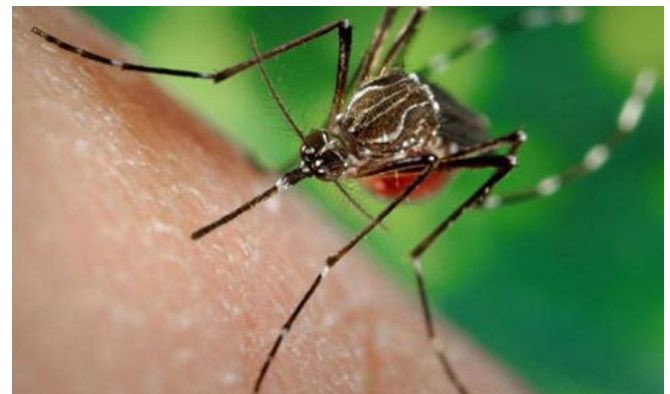
Figure 4. Adult yellow fever mosquito, Aedes aegypti (Linnaeus), showing the white "lyre" shape on the dorsal side of the thorax.

The adult yellow fever mosquito is a small to medium-sized mosquito, approximately 4 to 7 mm (~1/4 in). To the unaided eye, adult yellow fever mosquitoes resemble the Asian tiger mosquito with a slight difference in size and thorax patterns. Aedes aegypti adults have white scales on the dorsal (top) surface of the thorax that form the shape of a violin or lyre, while adult Aedes albopictus have a white stripe down the middle of the top of the thorax. Each tarsal segment of the hind legs possesses white basal bands, forming what appear to be stripes. The abdomen is generally dark brown to black but also may possess white scales (Carpenter and LaCasse 1955).