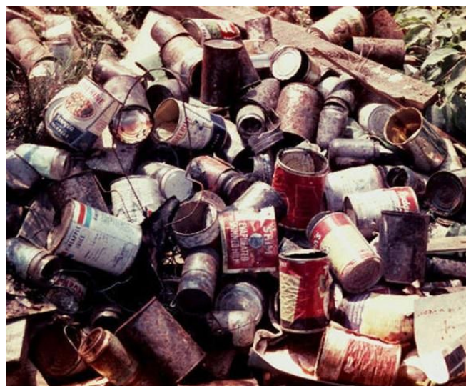
Figure 15. Mosquitoes can breed in tin cans in open dumps or around the yard.