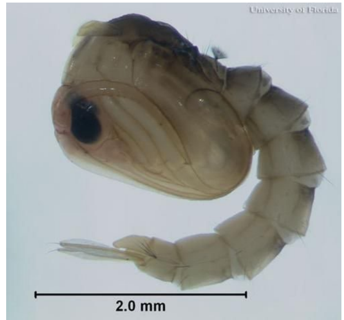
Figure 12. Pupa of the yellow fever mosquito, Aedes aegypti (Linnaeus).

After the fourth instar, Aedes aegypti enter the pupal stage. Mosquito pupae are different from many other holometabolous insects in that the pupae are mobile and respond to stimuli. Pupae, also called "tumblers," do not feed and take approximately two days to develop. Adults emerge by ingesting air to expand the abdomen thus splitting open the pupal case and emerge head first.