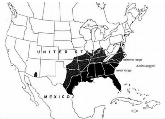
Figure 3. Distribution of the yellow fever mosquito, Aedes aegypti (Linnaeus), in the United States as of 2005. Credit: Darsie RF, Ward RA

In the United States, Aedes aegypti is found in 23 states, including the southeastern U.S., up the east coast to New York, and west to Indiana and Kentucky (Darsie and Ward 2005) although in some areas Aedes aegypti populations are decreasing due to competition with Aedes albopictus . Aedes aegypti is still a common mosquito in urban areas of southern Florida, and in cities along the Gulf coast of Texas and Louisiana.