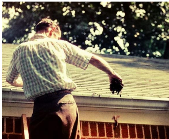
Figure 14. Organic matter left in gutters allows water to collect and mosquitoes to breed. Keep gutters clean so water can flow out.

By turning over empty flowerpots, properly maintaining swimming pools, and removing unused tires, you can greatly reduce the number of places mosquitoes have to lay eggs. Aerate birdbaths and make sure gutters are free of blockages. Clean pet bowls every day and always empty overflow dishes for potted plants.