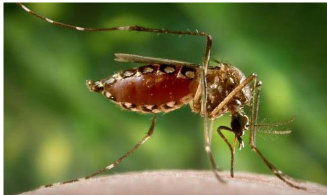
Figure 6. An adult female yellow fever mosquito, Aedes aegypti (Linnaeus), in the process of acquiring a blood meal from its human host, after having penetrated the skin surface with the sharply pointed "fascicle." Note that her abdomen has become distended as her stomach is filling with her blood meal, and how the proboscis' labial sheath is in its retracted, pulled back configuration, exposing the inserted, sharp fascicle, which has turned red, as the blood is passing up the straw-like apparatus

For a pictorial key of Florida mosquitoes, including Aedes aegypti , see the Florida Medical Entomology Laboratory's Identification Guide to Common Mosquitoes of Florida website at: http://fmel.ifas.ufl.edu/Key/index.htm .