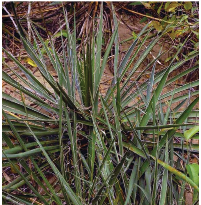
Figure 5. Adam's needle, Yucca filamentosa L.(Agavaceae), a host plant of the yucca giant-skipper, Megathymus yuccae (Boisduval & Leconte).

Females lay the large amber-brown eggs singly on leaves of Adam's needle, Yucca filamentosa L. (Agavaceae), and moundlily yucca, Yucca gloriosa L. Other yucca species may also be utilized.