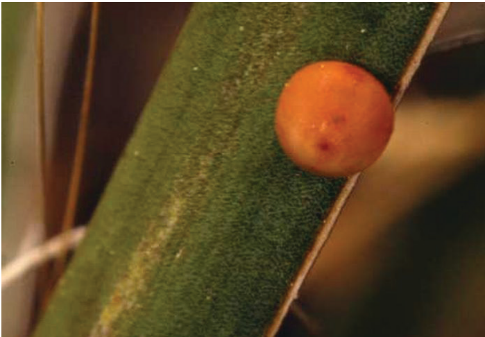
Figure 3. Egg of the yucca giant-skipper, Megathymus yuccae (Boisduval & Leconte), on Adam's needle, Yucca filamentosa L.(Agavaceae).