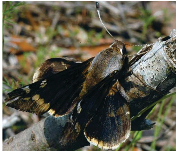
Figure 1. Dorsal view of an adult yucca giant-skipper, Megathymus yuccae (Boisduval & Leconte).

have an additional yellow spot band across the outer portion of each hindwing. The hindwings below are dark blackish-brown with violet-white frosting and a prominent triangular white spot along the leading margin.