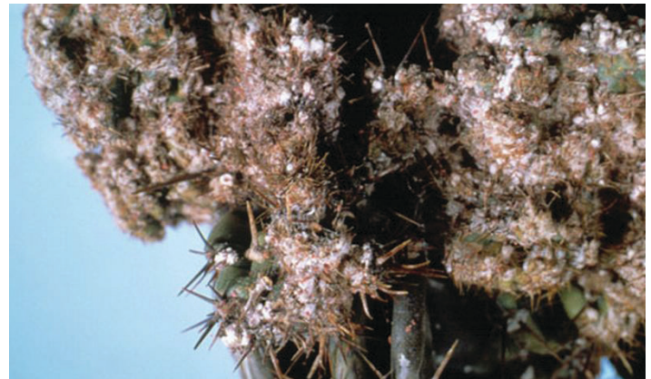
Figure 8. Infestation of the mealybug, Hypogeococcus pungens Granara de Willink.

Cactaceae hosts, particularly those that reproduce primarily by seeds instead of budding.