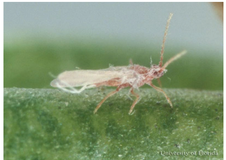
Figure 5. Lateral view of an adult male of the mealybug Hypogeococcus pungens Granara de Willink.