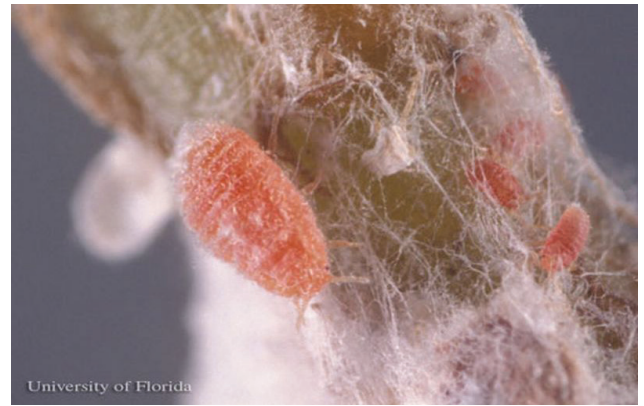
Figure 3. Late and early instar nymphs of the mealybug Hypogeococcus pungens Granara de Willink.

More detailed taxonomic diagnosis information is available via the Scale Insects: Identification tools, images, and diagnostic information for species of quarantine significance provided by the USDA-ARS Systematic Entomology Laboratory.