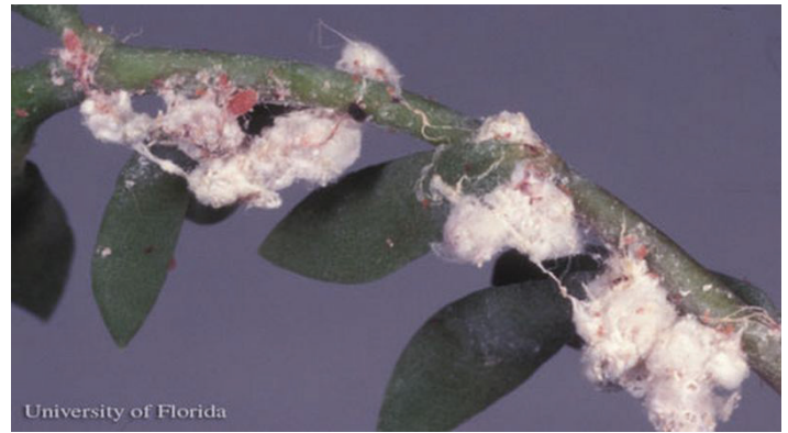
Figure 7. Infestation of the mealybug, Hypogeococcus pungens Granara de Willink.

Hypogeococcus pungens has a very limited host range and appears to be of little economic significance as a pest. Significant pest populations of Hypogeococcus pungens rarely occur in Florida. Although Hypogeococcus pungens was reported occurring on Cactaceae in Italy, subsequent surveys have reported reduced populations (Longo 2009). Exceptions to the general non-pest status of Hypogeococcus pungens could occur in areas with rare or endemic