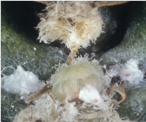
Figure 2. Shown infesting cacti is Hypogeococcus spinosus Ferris, which is not established in Florida. This species is related to Hypogeococcus pungens Granara de Willink.

In Florida, heavy infestations of pink-colored mealybugs on Portulaca and Alternanthera species are frequently identified as Hypogeococcus pungens . This species is rarely found on cacti in Florida.