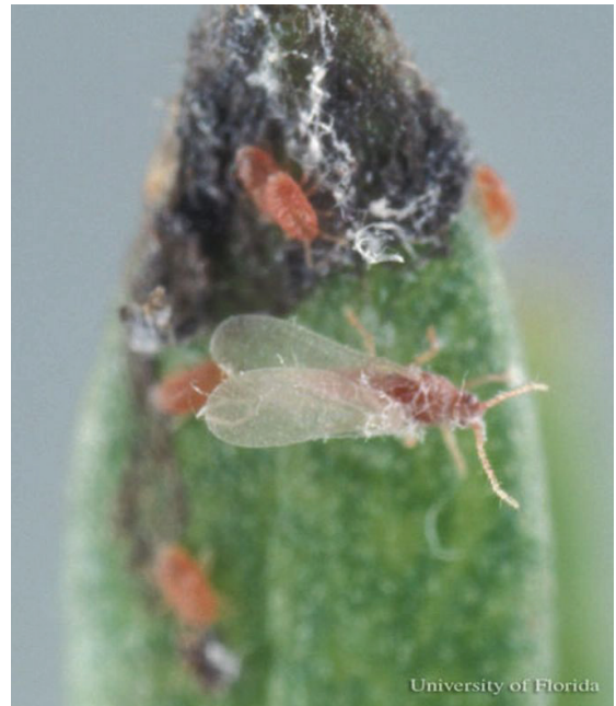
Figure 4. Adult male (dorsal view) and nymphs of the mealybug Hypogeococcus pungens Granara de Willink.