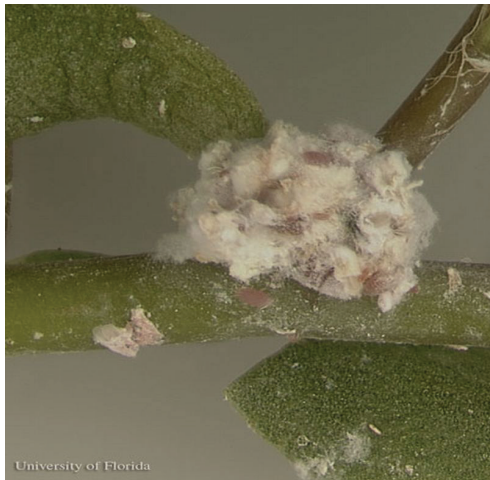
Figure 1. Infestation of the mealybug, Hypogeococcus pungens Granara de Willink.

Hypogeococcus pungens is native to South America and was described by Granara de Willink (1981). A previous description by Williams (1973) classified Hypogeococcus pungens incorrectly as Hypogeococcus festerianus (Lizer y Trelles), and this confusion resulted in numerous publications listing Hypogeococcus pungens as Hypogeococcus festerianus . Little biological information is available for either species, but much of the available literature for Hypogeococcus festerianus actually is Hypogeococcus pungens information.