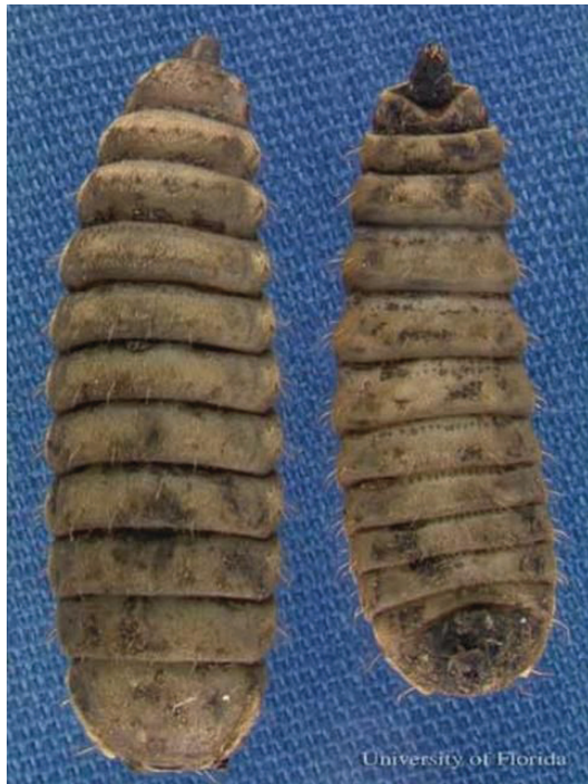
Figure 3. Dorsal (left) and ventral (right) views of sixth instar larvae of the black soldier fly, Hermetia illucens (Linnaeus).