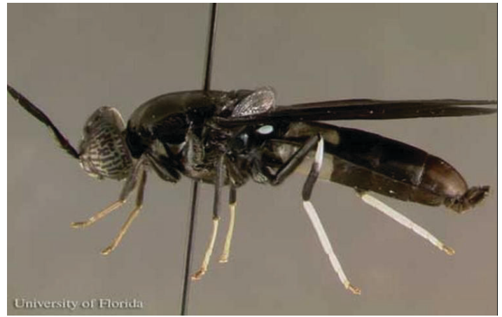
Figure 2. Lateral view of an adult black soldier fly, Hermetia illucens (Linnaeus). Notice the two translucent “windows” located on the first abdominal segment, partially obscured in this image by the rear leg.

Two days after adult emergence from the pupal case, mating can occur. A male black soldier fly intercepts a passing female in mid-air and they descend in copula (Tomberlin and Sheppard 2001). Male soldier flies utilize lekking sites, where they await female soldier flies. These sites are defended against other male soldier flies. When a male intrudes upon the territory of a resting male, the resting male seizes the intruder. After a brief descent, the invading male will retreat.