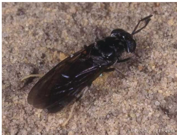
Figure 1. Adult black soldier fly, Hermetia illucens (Linnaeus).