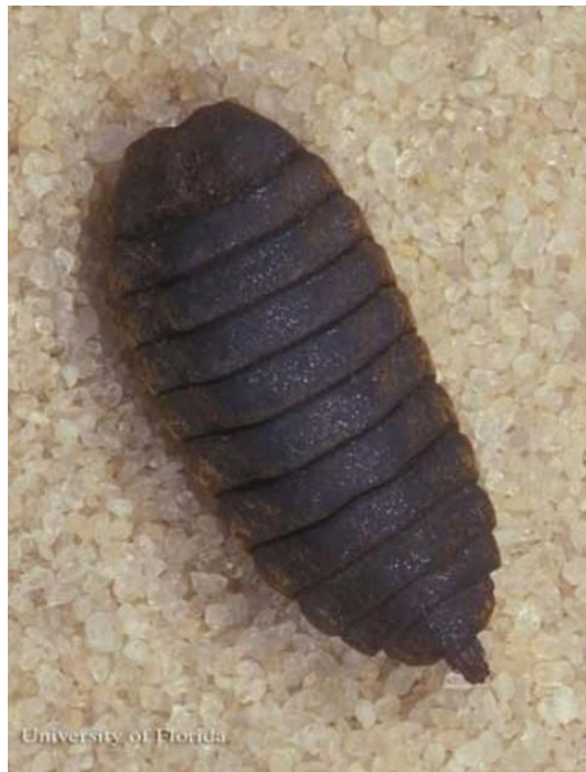
Figure 4. Pupa of the black soldier fly, Hermetia illucens (Linnaeus).