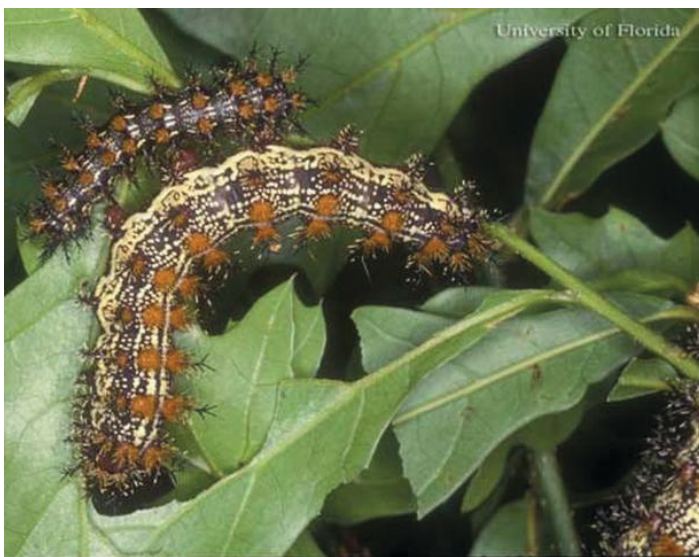
Figure 11. Larvae of the buck moth, Hemileuca maia (Drury), feeding gregariously.

Like other members of their subfamily, buck moth larvae are gregarious (group together) for their first three larval instars (Wagner 2005). After the third instar, the larvae separate from each other and wander onto other plants where they feed until ready to pupate. The caterpillars pupate in debris that is either near to or on the ground, and if they spin a cocoon, it is not very large (Ferguson 1971). Buck moths may not emerge from their pupae for up to two years. Because the adults have no functional mouthparts they do not feed. Their main purpose is to mate and lay eggs.