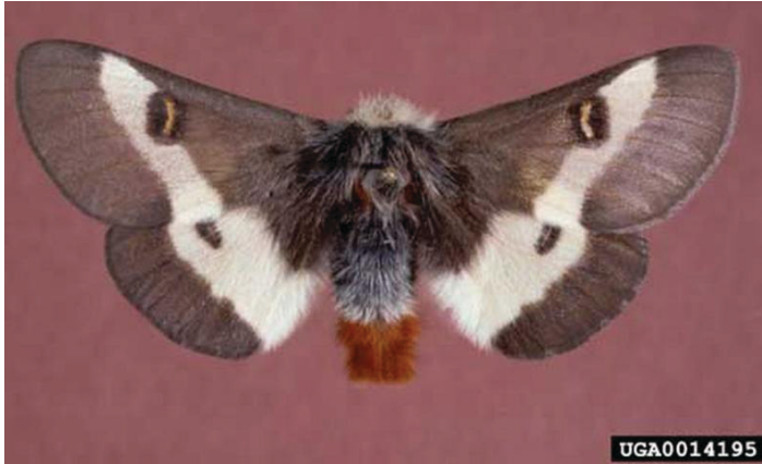
Figure 7. Adult male buck moth, Hemileuca maia (Drury).

body. A reniform spot is a type of spot that occurs on the outer part of the forewings of moths (Covell 1984). The hindwings of the buck moth have a black edged discal spot that occurs within the white band. All three segments of the female's body (head, thorax, and abdomen) are black. The body of the male is also black except for the tip of the abdomen, which is red. Also, the females generally have larger bodies and wingspans than the males.