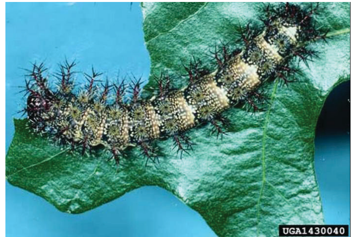
Figure 9. The light form of the buck moth larva, Hemileuca maia (Drury). This larva is almost fully-grown.