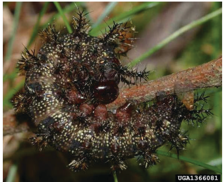
Figure 8. The dark form of the buck moth larva, Hemileuca maia (Drury).

Buck moth caterpillars that have a light background color can be confused with both the Nevada buck moth, Hemileuca nevadensis Stretch, and the New England buck moth, Hemileuca lucina Henry Edwards. The larvae of these three species can best be distinguished based on the preferred host plants (Wagner 2005). The caterpillars of the Nevada buck moth feed principally on willow, while those of the New England buck moth feed on meadowsweet, Spiraea spp. In addition, the spines of the buck moth are longer than those of the other two species (Ferguson 2005).