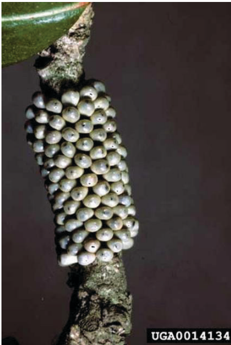
Figure 10. The eggs of the buck moth, Hemileuca maia (Drury), are laid in a ring around a twig of the host plant.

Like other members of their subfamily, buck moth larvae are gregarious (group together) for their first three larval instars (Wagner 2005). After the third instar, the larvae separate from each other and wander onto other plants where they feed until ready to pupate. The caterpillars pupate in debris that is either near to or on the ground, and if they spin a cocoon, it is not very large (Ferguson 1971). Buck moths may not emerge from their pupae for up to two years. Because the adults have no functional mouthparts they do not feed. Their main purpose is to mate and lay eggs.