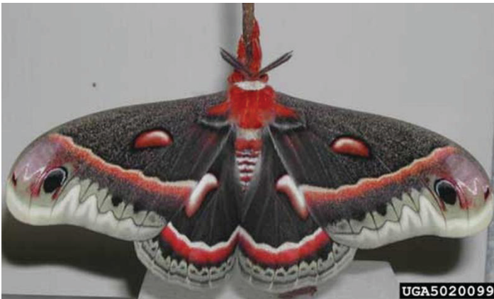
Figure 4. Adult cecropia moth, Hyalophora cecropia (Linnaeus).