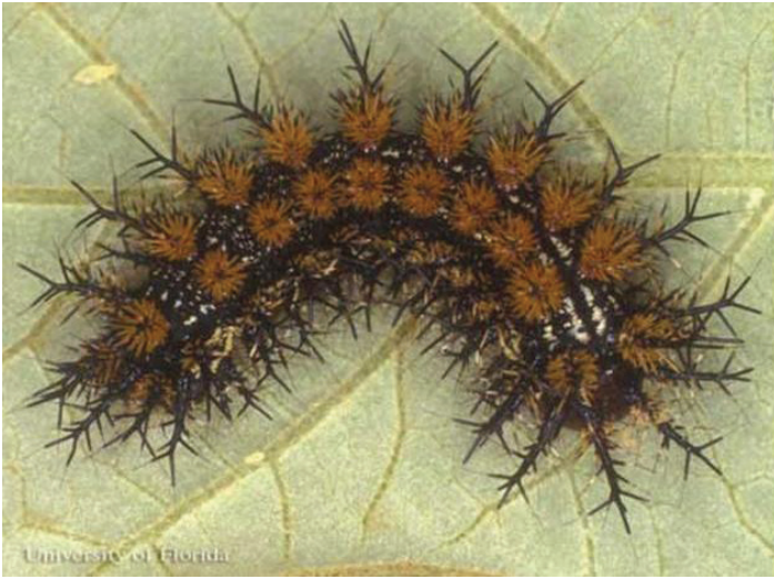
Figure 14. Close up, dorsal view of the stinging spines of a buck moth, Hemileuca maia (Drury), larva.

Lonomia ) (Carrijo-Carvalho and Chudzinski-Tavassi 2007). Death from contact with Lonomia caterpillars often results from multiple venom exposures due to their gregarious feeding behaviour (Diaz 2005). The caterpillar of the io moth , which occurs in Florida, also defends itself with urticating spines.