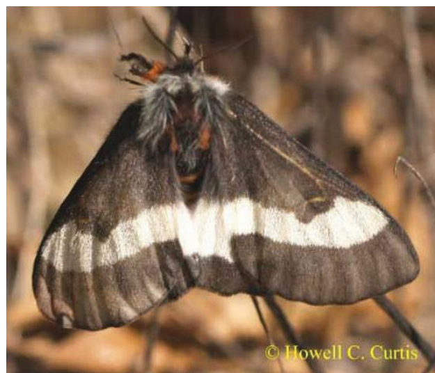
Figure 1. Adult buck moth, Hemileuca maia (Drury).

includes southern Mexico, Central and South America, and the West Indies (Scoble 1995). Caterpillars in this subfamily have numerous multi-branched spines on their bodies, which are used defensively, delivering a sting when touched (Wagner 2005). The range caterpillar, Hemileuca olivae Cockerell, occurs in Mexico and in parts of the U.S. states of Colorado, Kansas, New Mexico, Oklahoma and Texas. This caterpillar is found on grasses and can be problematic for livestock in infested pastures (Opler et al. 2009b). The adult females of a Neotropical genus, Hylesia , also possess urticating (stinging) hairs on their abdomen. These hairs are used both as defense for the adult and to defend their eggs (Scoble 1995). The larvae of this genus possess stinging spines as well.