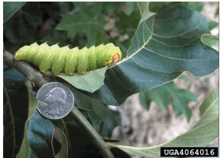
Figure 5. A caterpillar of the polyphemus moth, Antheraea polyphemus (Cramer), showing how large giant silkworm caterpillars can become.