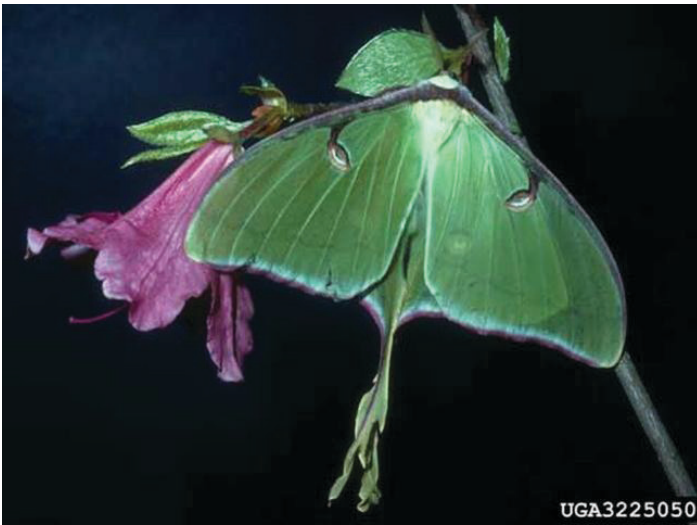
Figure 2. Adult luna moth, Actias luna (Linnaeus).