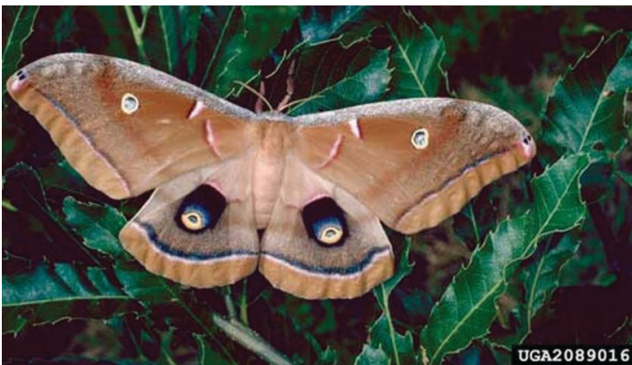
Figure 3. Adult polyphemus moth, Antheraea polyphemus (Cramer).