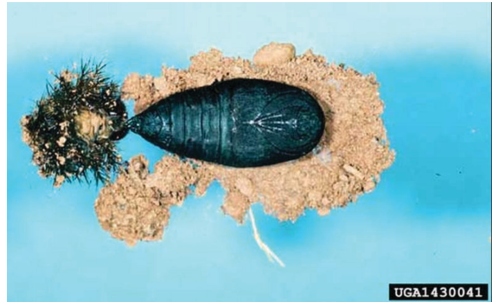
Figure 12. The shed, final instar skin (left) of the buck moth, Hemileuca maia (Drury), with the pupae (right).