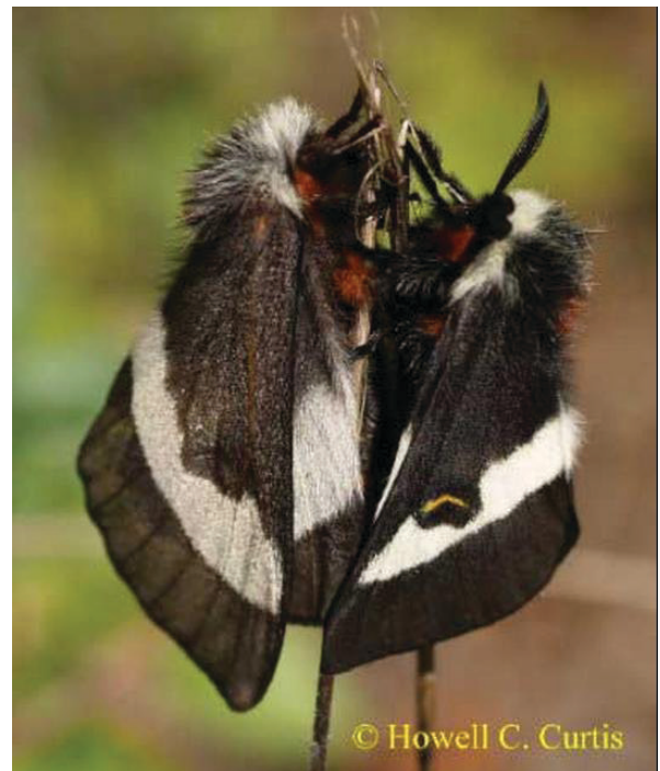
Figure 13. Adult buck moths, Hemileuca maia (Drury), mating.