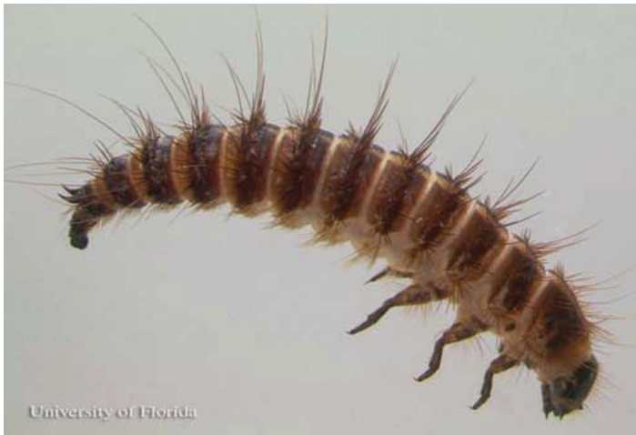
Figure 2. Larva of the hide beetle, Dermestes maculatus DeGeer.

The bodies of the larvae are covered in rows of hairs of different lengths, called setae. The underside of the abdomen is typically yellowish-brown while the dorsal surface is typically dark brown, usually with a central yellow line. Two long horn-like protrusions are located on the upper surface of the last segment, partially hidden by surrounding hairs (Haines and Rees 1989). The protrusions, called urogomphi, curve upward and away from the tip of the abdomen. This distinguishes the larvae from larvae of D. lardarius , which has the urogomphi curving downward toward the tip of the abdomen (Hedges and Lacey 1996).