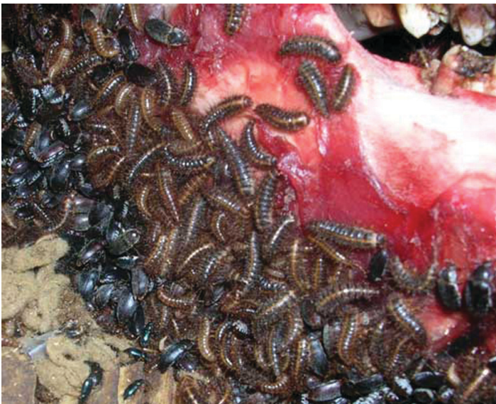
Figure 5. Larvae and adults of the hide beetle, Dermestes maculatus DeGeer, consume flesh and hide on an animal skull.

Once adults, the beetles can disperse to other food sources by flying (Haines and Rees 1989). Adult beetles typically live between four to six months.