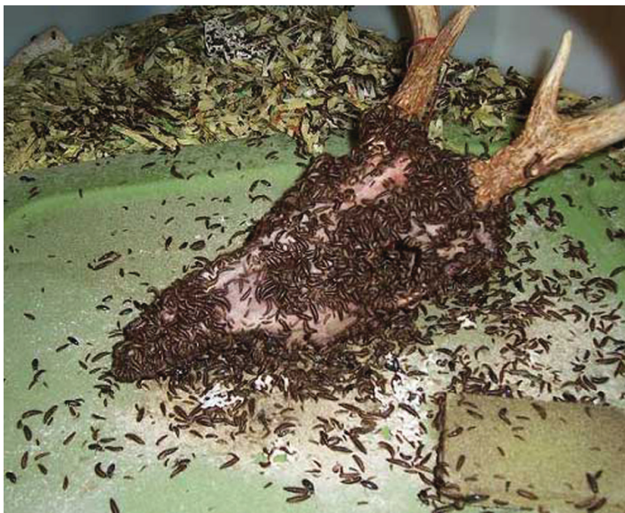
Figure 6. Larvae of the hide beetle, Dermestes maculatus DeGeer, cleaning the skull of a white tailed deer.

Today, D. maculatus is a minor pest of the silk industry, though in the past it has been a major problem. In 1987 in India, a 20% loss was recorded in silk production due to the beetle. The primary cause of loss was due to the feeding of D. maculatus larvae boring into the cocoons to eat the silkworm pupae, and thus the cocoons could not be used for reeling. In 1931 in Italy, the beetle was reported to be a vector for pebrine disease, a disease that previously caused the closure of the silkworm industry in many countries (Veer et al. 1996). Other commodities that D. maculatus can damage include stored animal products such as dried fish, cheese, hide, fur, bacon, and dog treats. The larvae can cause considerable damage to timber, cork, plaster, linen, and cotton when they bore into these materials to pupate (Veer et al. 1996). This structural damage is also a problem in poultry industry, particularly in cage-layered facilities, in addition to the adults feeding off broken eggs and small animal carcasses (Cloud and Collison 1986). Bone cleaning by D. maculatus is used by taxidermists to clean skulls or by museums to clean bone specimens (Mairs et al. 2004).