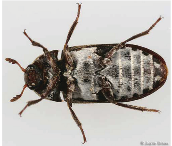
Figure 3. Ventral view of an adult hide beetle, Dermestes maculatus DeGeer.

Frass, or feces, from D. maculatus appear dark brown, fibrous, and resemble horse hair. Evidence of frass can indicate the past presence of beetles (Schroeder et al. 2002).