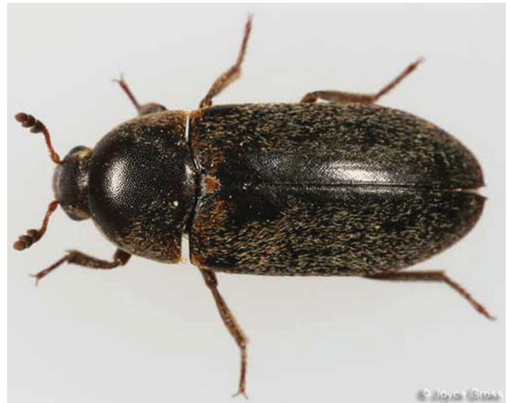
Figure 1. Dorsal view of an adult hide beetle, Dermestes maculatus DeGeer.