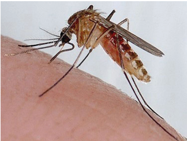
Figure 2. Adult female southern house mosquito, Culex quinquefasciatus Say, feeding.

Adult Cx. quinquefasciatus vary from 3.96 to 4.25 mm in length (Lima et al. 2003). The mosquito is brown with the proboscis, thorax, wings, and tarsi darker than the rest of the body. The head is light brown with the lightest portion in the center. The antennae and the proboscis are about the same length, but in some cases the antennae are slightly shorter than the proboscis. The flagellum has thirteen segments that have few to no scales (Sirivanakarn et al. 1987). The scales of the thorax are narrow and curved. The abdomen has pale, narrow, rounded bands on the basal side of each tergite. The bands barely touch the basolateral spots taking on a half-moon shape (Darsie and Ward 2005).