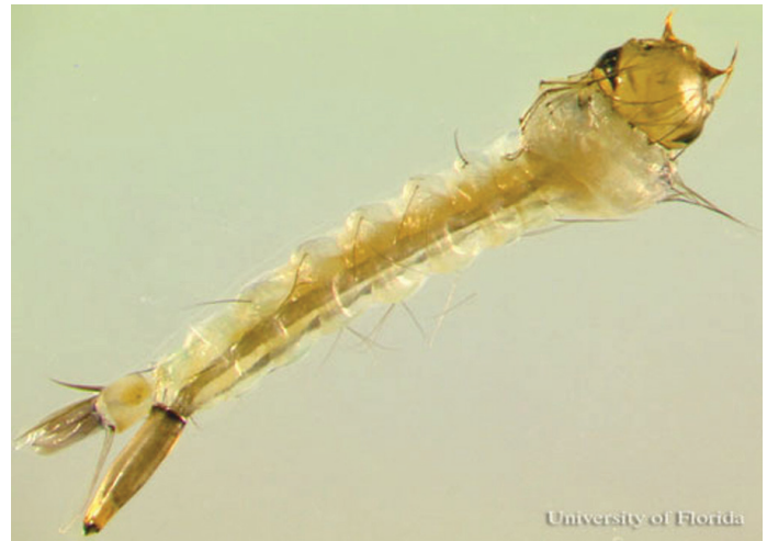
Figure 4. Larva of the southern house mosquito, Culex quinquefasciatus Say. Head in upper right.

The larval head is short and stout, becoming darker toward the base. The mouth brushes have long yellow filaments that are used for filtering organic materials. The abdomen consists of eight segments, the siphon, and the saddle. Each segment has a unique setae pattern (Sirivanakarn and White 1978). The siphon is on the dorsal side of the abdomen, and in Cx. quinquefasciatus the siphon is four times longer than it is wide with multiple setae tufts (Darsie and Morris 2000). The saddle is barrel shaped and located on the ventral side of the abdomen with four long anal papillae protruding from the posterior end (Sirivanakarn and White 1978).