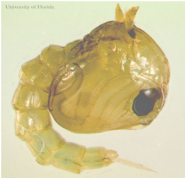
Figure 5. Pupa of the southern house mosquito, Culex quinquefasciatus Say.