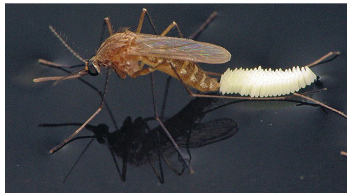
Figure 6. Female southern house mosquito, Culex quinquefasciatus Say, ovipositing an egg raft.

Outside the United States, Cx. quinquefasciatus is responsible for transmitting the filarial nematode, Wuchereria bancrofti (Tropical Africa and Southeast Asia), and Rift Valley fever virus (RVF) (Africa) (Foster and Walker 2002). Wuchereria bancrofti is a filarial nematode that can cause lymphatic filariasis. Currently, worldwide there are approximately 120 million cases of lymphatic filariasis (WHO 2000). The mosquito picks up the microfilaria from an infected vertebrate. The nematode develops inside the mosquito and is passed on to another vertebrate (Foster and Walker 2002). RVF has been responsible for major epidemics in Africa and Asia. The World Health Organization monitors outbreaks of RVF. Between 2000 and 2010, there were outbreaks in Kenya, Madagascar, Saudi Arabia, Somalia, Sudan, Tanzania, and Yemen (World Health Organization 2012).