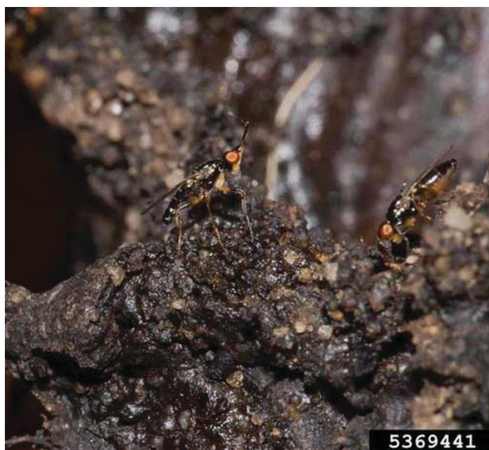
Figure 1. Adult cheese skippers, Piophilidae Linnaeus.

Intentional introduction of P. casei larvae into pecorino cheese produces the famous, but illegally-produced, Italian cheese known as “casu marzu,” a delicacy desired for the famous pungent taste left behind when the larvae digest and ferment the cheese (Overstreet 2003). The goo-like paste as well as the living maggots are eaten.