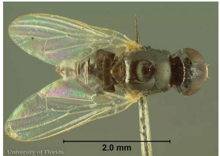
Figure 2. Dorsal view of adult cheese skipper, Piophila casei Linnaeus.

Cheese skipper adults are usually about half the size of a common house fly. Males are 4.4–4.5 mm from the tip of the head to the tip of the wings, whereas females are slightly larger, usually measuring 5.0–5.2 mm. The dominant color of both males and females is a metallic black-bronze (Triplehorn and Johnson 2005). The palps and proboscis are usually covered with bristles, and the antennae are short. The compound eyes found on both sexes are usually bare and red in color. The thorax has distinct rows of setae, and long setae are also found on the sides of the insect. The legs are covered with short spines and often have both yellow and brown colorations. The wings are iridescent and nearly overlap when resting. Halteres, rudimentary second wings, are typically a pale yellow color (Mote 1914). Adults live for three to seven days (Smith and Whitman 2000).