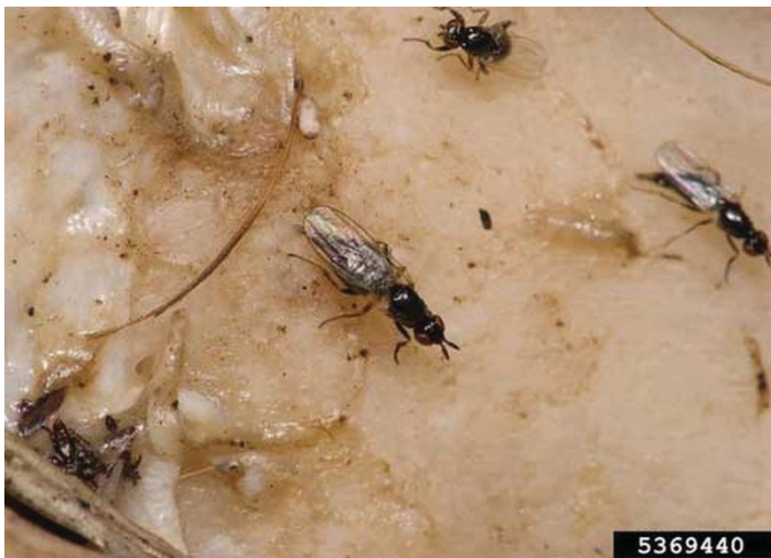
Figure 7. Adult cheese skippers, Piophilidae casei Linnaeus, on cheese.