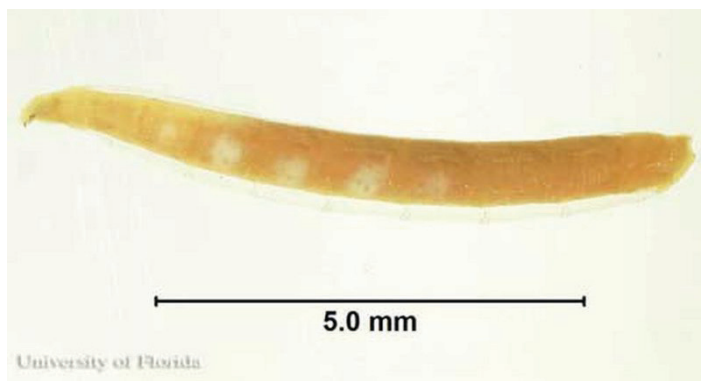
Figure 5. Larva of the cheese skipper, Piophilidae Linnaeus.

The larvae of the cheese skipper are active as soon as they hatch from the egg and appear fairly cylindrical and white, except for sclerotized black mouthparts. Oftentimes, the larvae can leap 4 to 5 inches through the air by using their mouth hooks as grapples and then flexing/jerking themselves forward, earning the flies the name “cheese skippers.” Larvae tend to avoid light and congregate near each other on fairly lean portions of meat (Smith and Whitman 2000). The three larval instars typically last 14 days total and are found on substrates ranging from meats (bacon, ham, beef) to cheeses, fatty foods and decaying bodies. Full-grown larvae are 13-segmented, typically 9–10 mm long and approximately 1 mm wide, and appear white or yellowish-white to the unaided eye (Mote 1914). Larvae are fairly resistant to changes in heat and cold (Smith and Whitman 2000).