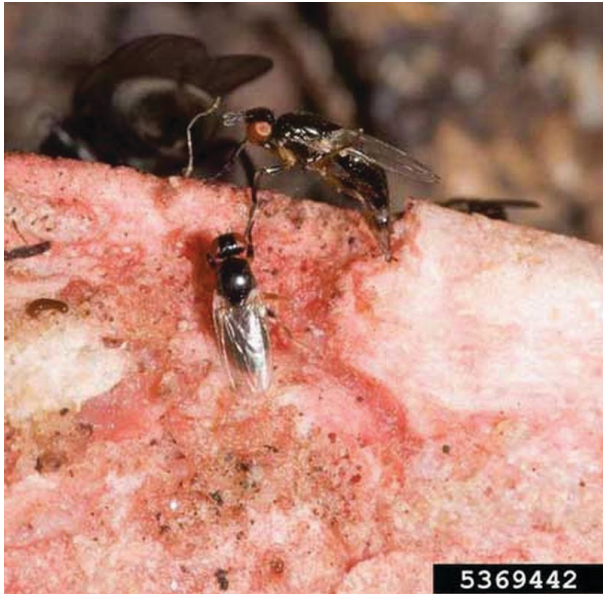
Figure 6. Adult cheese skippers, Piophilidae casei Linnaeus, on meat.

is considered a delicacy in Italian areas ranging from Piedmont and Bergamo to Sardinia (Overstreet 2003).