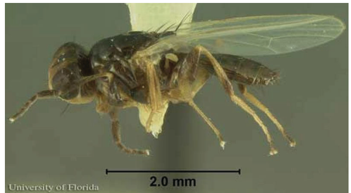
Figure 3. Lateral view of adult cheese skipper, Piophila casei Linnaeus. Credits: Caitlin Lewis, University of Florida