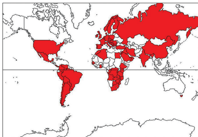
Figure 2. The worldwide distribution (red colored areas) of the bee louse, Braula coeca Nitzsch.

Braula has an extensive global distribution, being documented in Africa, Asia, Europe, Australia (Tasmania), North America, and South America (Smith and Carron 1985). The species probably was brought into the United States on imported honey bee queens, although the exact year is unknown (Philips 1925).