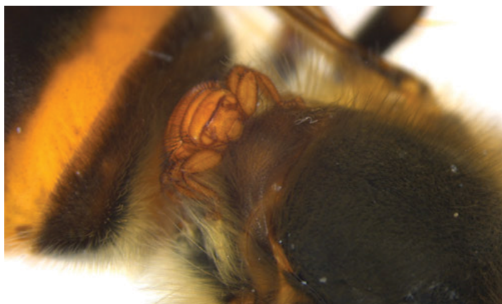
Figure 1. An adult Braula coeca on the dorsal aspect of a worker honey bee, Apis mellifera Linnaeus, thorax.