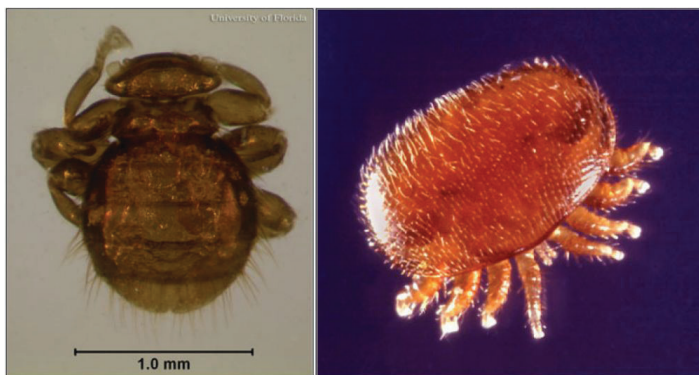
Figure 3. Dorsal views of an adult bee louse, Braula coeca Nitzsch, (left); and an adult varroa mite, Varroa destructor Anderson and Trueman, (right). Varroa mites are more oval in shape, and have eight legs as compared to the bee louse, which has six legs.

Adult Braula are <1.5 mm long and covered in spine-like hairs. They do not have the wings or halteres possessed by most flies. Braula are reddish-brown in color and regularly are misdiagnosed as varroa mites, Varroa destructor Anderson and Trueman, due to their similar appearance. One notable difference useful as a field diagnosis to distinguish between varroa mites (mites) and Braula (insects) is that Braula have six legs while adult varroa mites have eight legs. Further, the adult Braula has a rounded appearance while varroa mites are more compressed and oval. Despite these differences, both are very small and difficult to distinguish with the unaided eye.