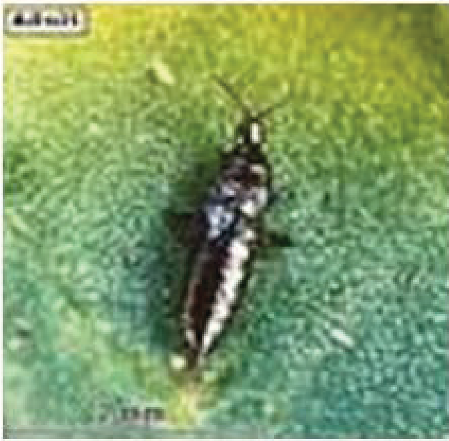
Figure 1. A short-winged (brachypterous) adult alligatorweed thrips, Amynothrips andersoni O'Neill.