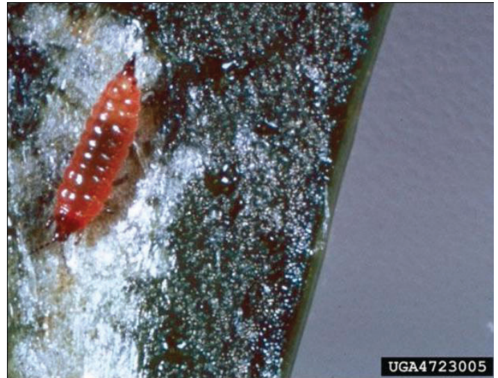
Figure 3. Second instar (deep red in color with black legs) of the alligatorweed thrips, Amynothrips andersoni O'Neill.

As with other species of thrips in the family Phlaeothripidae, development of the alligatorweed thrips progresses through three pupal instars: a propupa, followed by pupal instars 1 and 2 (Center et al. 2002; Buckingham 2004).