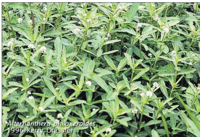
Figure 4. Dense stand of alligatorweed, Alternanthera philoxeroides (Mart.) Griseb.