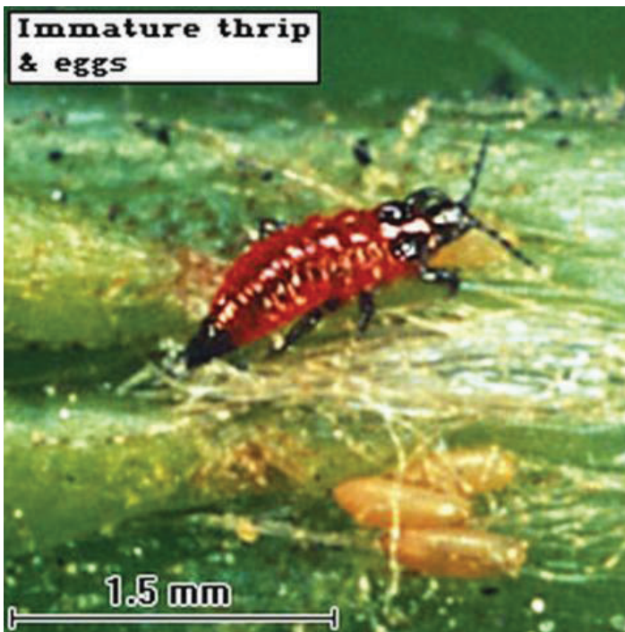
Figure 2. Second instar (deep red in color with black legs) and yellowish eggs (foreground) of the alligatorweed thrips, Amynothrips andersoni O'Neill.