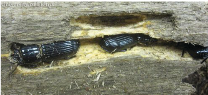
Figure 11. Deeply carved wood tunnels of the horned passalus, Odontotaenius disjunctus Illiger. (University of Florida educational specimens).

Using its large mandibles, the horned passalus cuts into fallen logs and creates galleries where it lives and breeds.