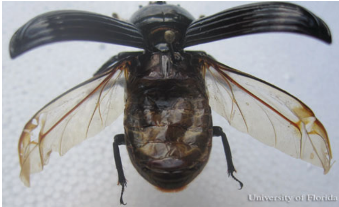
Figure 14. Elytra raised, exposing the dorsal thorax and abdomen of a pinned and dried horned passalus, Odontotaenius disjunctus Illiger.

larval auditory signals are equivocal in volume to the adult signal.