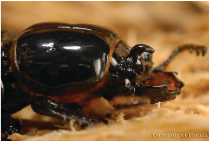
Figure 6. Close up of the head and curved horn of the horned passalus, Odontotaenius disjunctus Illiger. Also notice the fringes of golden hairs and the mites just behind the head.