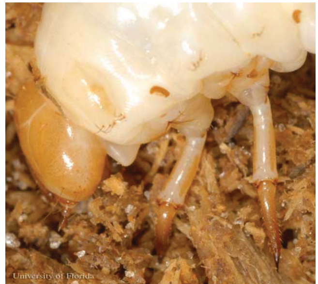
Figure 9. Larva of the horned passalus, Odontotaenius disjunctus Illiger, with close up of legs.