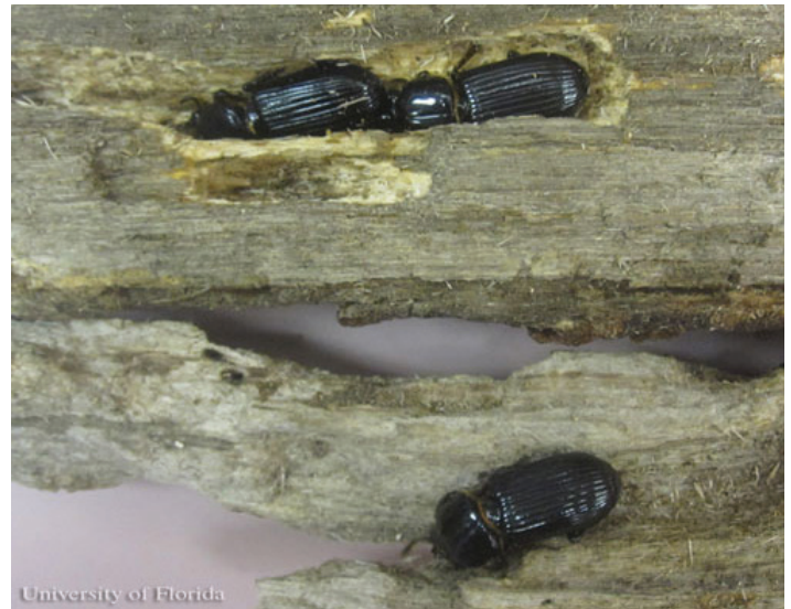
Figure 12. Aggregation of the horned passalus, Odontotaenius disjunctus Illiger, in the same wood pieces. (University of Florida educational specimens).

Parents of new egg clutches will create a subsocial relationship where adults of both sexes tend the larva throughout the gallery complex in cooperative care of brood (Schuster and Schuster 1985). If the wood remains undisturbed, more than one generation will cohabitate the same log and young adults will also participate in sibling and new brood care. Adults are territorial and protect their galleries from intruders, but both adults and larvae will cannibalize injured immatures (King and Fashing 2007). Mites can commonly be found on the exoskeleton of the horned passalus. These mites are diverse, but not harmful to humans or the beetle.