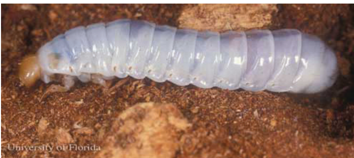
Figure 7. Larva of the horned passalus, Odontotaenius disjunctus Illiger, posed to see body shape.

The larvae are large, white grubs that have up to three instars. Larvae are found in the same galleries as the adults. To obtain nutrients, the larvae feed on predigested wood from the adults.