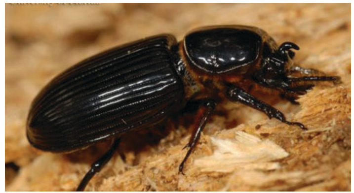
Figure 1. Lateral view of a horned passalus, Odontotaenius disjunctus Illiger. The shiny black color was responsible for another commonly used name: patent leather beetle.

previously are believed not to have migrated or been introduced from Central America (Schuster 1983).