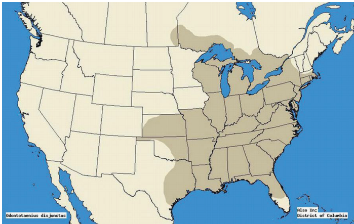
Figure 2. United States' distribution of the horned passalus, Odontotaenius disjunctus Illiger.

The horned passalus occurs in a wide range from mid-Florida to Massachusetts, Southern Texas to Minnesota, and Nebraska (Schuster 1983). More recent sources indicate further expansion from eastern Texas, throughout the eastern United States, and from southern Manitoba through the Canadian deciduous forests, and southern Ontario (Arnett et al. 2002).