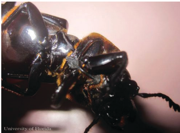
Figure 3. Golden hair fringes on a horned passalus, Odontotaenius disjunctus Illiger.

Horned passalus adults are relatively large, dark glossy black beetles, with adult size typically ranging from 30–40 mm (1.2 inch–1.6 inch). Golden hairs can be seen lining the middle pair of legs, pronotum, and antennae. These hairs are detectable by the naked eye.