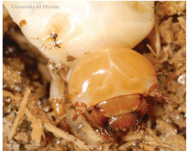
Figure 8. Larva of the horned passalus, Odontotaenius disjunctus Illiger, with close up of head capsule.

Grubs appear to only have two pairs of legs, but a third pair is present and reduced. Only the first two pairs are used for locomotion. As is typical for beetles within the superfamily Scarabaeoidea, grubs retain a characteristic C-shaped posture when not active. The larvae have no active defenses except for well proportioned mandibles, and auditory signals similar to those used by adult beetles.