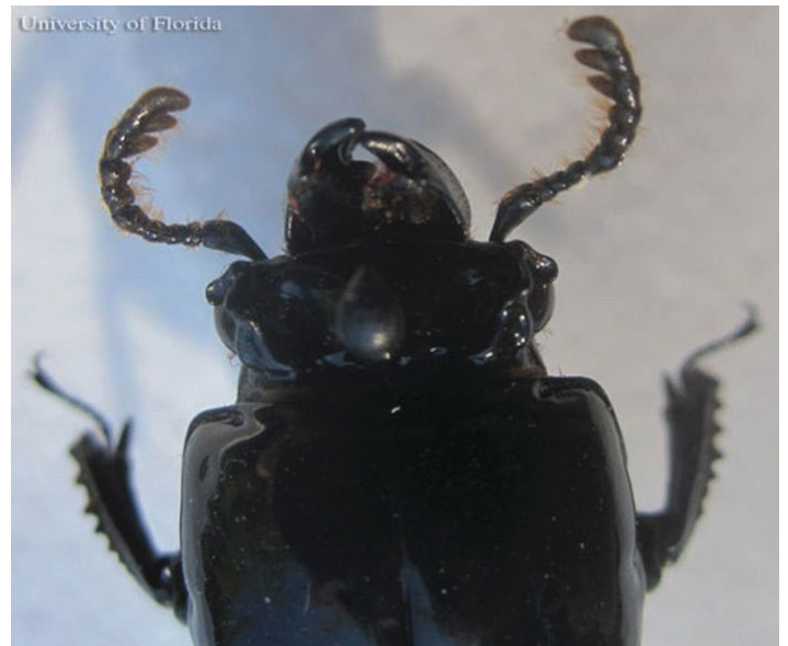
Figure 5. Close up of lamellate antennae, a characteristic of the horned passalus, Odontotaenius disjunctus Illiger.

Antennae have 10 segments, with the distal three segments forming a lamellate club. This is an easily identifiable characteristic of the family.