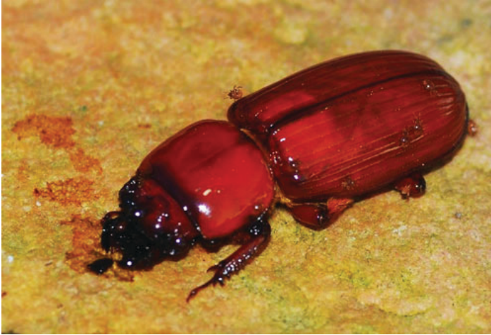
Figure 13. Freshly emerged teneral adult horned passalus, Odontotaenius disjunctus Illiger, already inhabited by mites (crawling on elytra).

point the insect is considered a mature adult (Schuster and Schuster 1985).