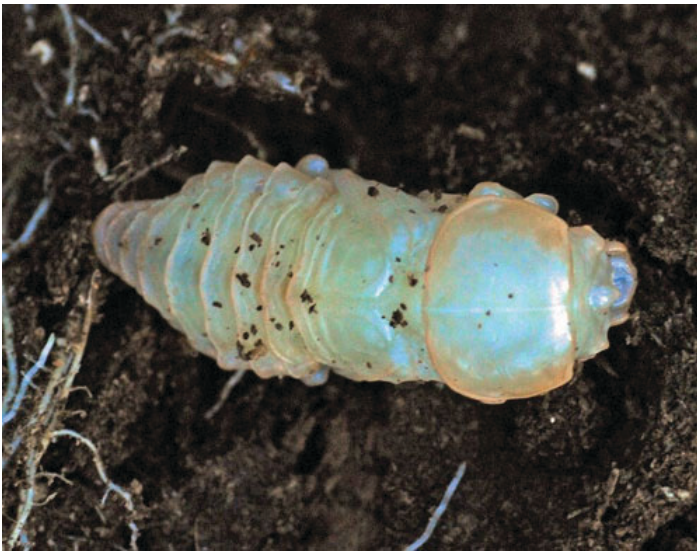
Figure 10. Pupa of the horned passalus, Odontotaenius disjunctus Illiger.