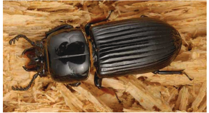
Figure 4. Dorsal view of an adult horned passalus, Odontotaenius disjunctus Illiger.

The elytra, or hardened outer forewing, are characterized by deep grooves. The horned passalus also has a groove down the midline of the pronotum.