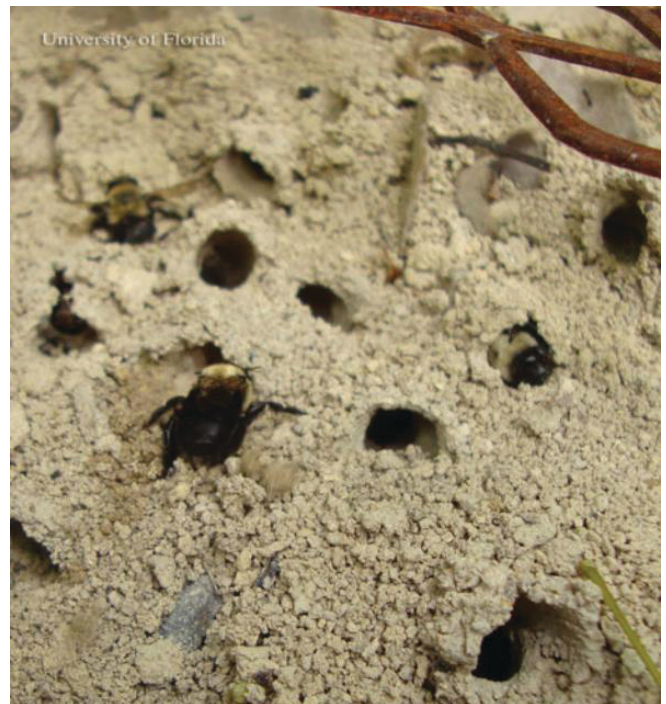
Figure 1. Nesting area of the miner bee, Anthophora abrupta Say, with at least three females visible.

on a variety of flowers. Anthophora abrupta are not timid around humans, so the interested observer can watch as the turrets multiply and the adult bees stock their burrows with pollen and nectar.