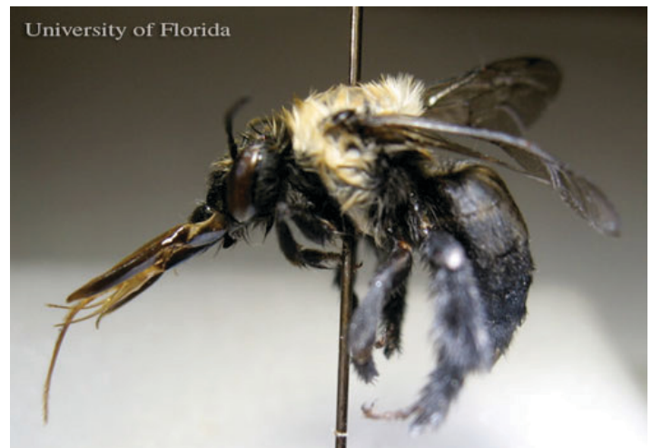
Figure 4. Adult female Anthophora abrupta Say, a miner bee.