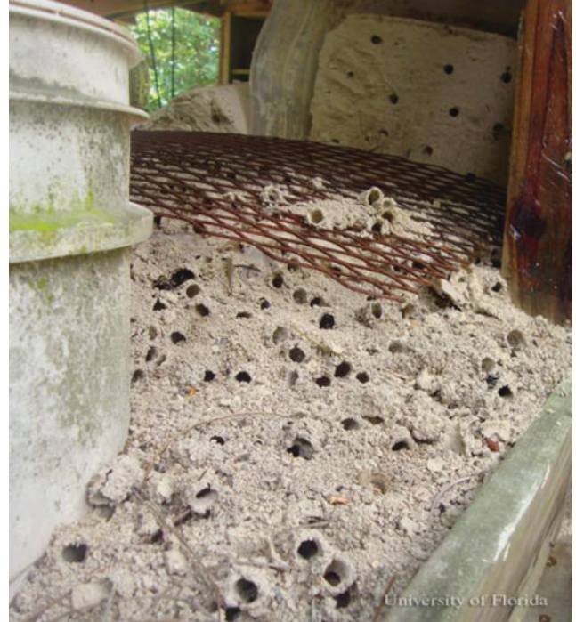
Figure 5. Nesting area of the miner bee, Anthophora abrupta Say.

Each chimney-like turret represents a single nest. The nests are often found on cliff banks or clay adobe walls. The adult females collect water to soften the hard packed clay. Anthophora abrupta nests are often found on clay banks at the edge of creeks and rivers. In a few cases, Anthophora abrupta nests have been found under an overhang, such as a bridge or tree.