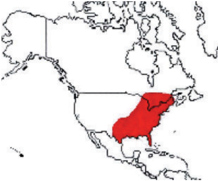
Figure 2. The range of Anthophora abrupta .

Anthophora abrupta range from Texas to the east coast of the United States and from Florida into Canada. Florida records of Anthophora abrupta have been uncommon since the 1980s. In 2010, a population was found nesting in colloidal clay in an open air shed in Gainesville, Florida, providing specimens for the photos included in this document.