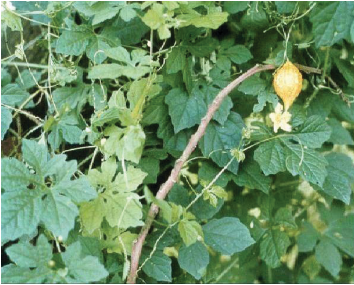
Figure 1. Balsam apple ( Momordica spp.). Credits: Brent Sellers (Hall et al. 2009a), UF/IFAS

black nightshade (Figure 5), hairy indigo (Figure 6), and citron (Figure 7). The American black nightshade is common in Florida (MacRae 2010), and it is possible that some of the references to “nightshade” in Table 1 or to “black nightshade” may actually refer to this plant. Recognition of these common virus host plants is important because they may be reservoirs for viruses, allowing them to survive during the off-season when the main vegetable crops are not grown.