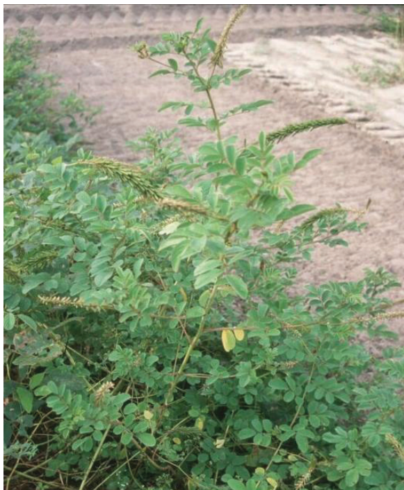
Figure 6. Hairy indigo ( Indigofera hirsuta ).