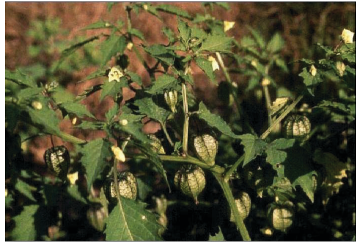
Figure 3. Cutleaf groundcherry ( Physalis angulata ). Credits: Brent Sellers (Hall et al. 2009b), UF/IFAS