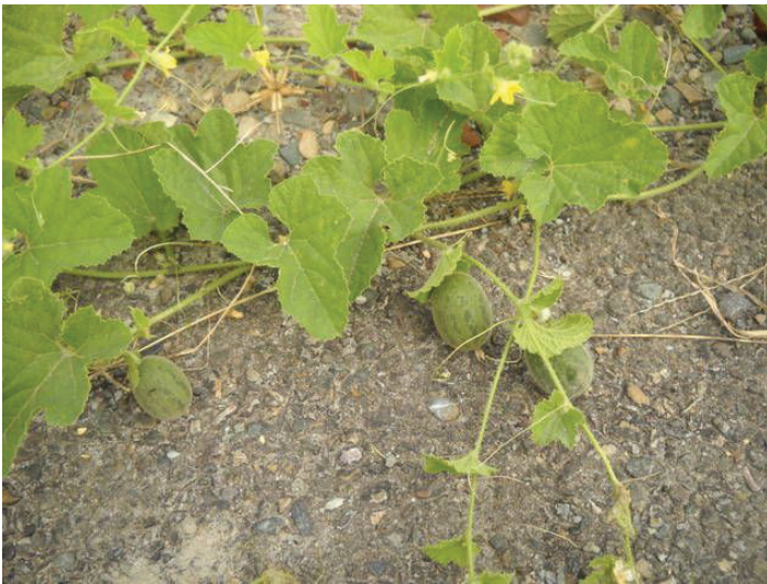
Figure 2. Creeping cucumber ( Melothria pendula ).