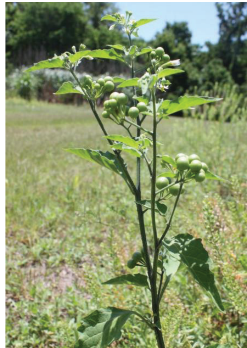
Figure 5. American black nightshade ( Solanum americanum ).