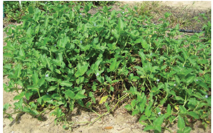
Figure 4. Dayflower ( Commelina spp.).