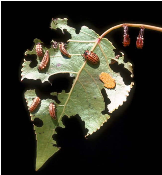
Figure 10. Life cycle of the cottonwood leaf beetle, Chrysomela scripta Fabricius.

Cottonwood leaf beetles overwinter as adults. They have been reported to emerge from under the bark of trees, leaf litter and forest debris. Adult beetles can often be easily collected in large numbers under or close to cottonwood or willow.