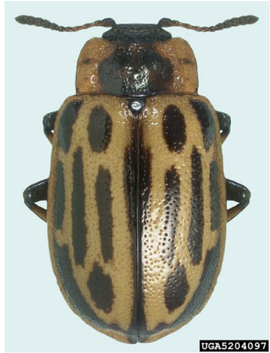
Figure 3. Adult cottonwood leaf beetle, Chrysomela scripta Fabricius, dorsal view.

The adult beetles are 6 mm (1/4 inch) long with a black head and thorax and clavate antenna. They also possess yellow or reddish margins on the thorax. However, the orange patterns vary among the adults. The elytra are yellowish with broken black stripes. In most cases, the male is considerably smaller than the female.