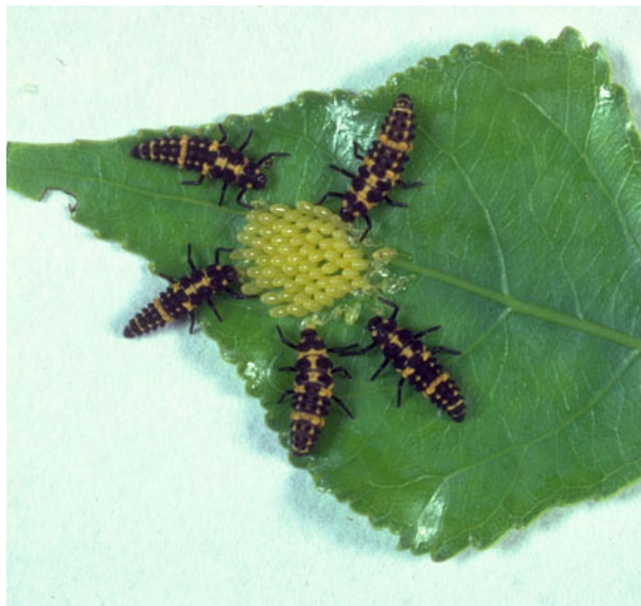
Figure 16. Larvae of the convergent lady beetle, Hippodamia convergens Guérin-Ménéville, feeding on eggs of the cottonwood leaf beetle, Chrysomela scripta Fabricius.