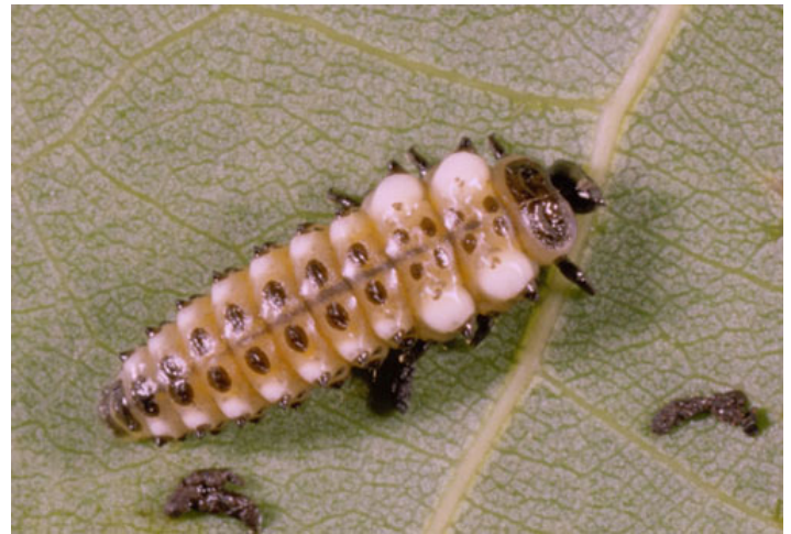
Figure 11. Larva of the cottonwood leaf beetle, Chrysomela scripta Fabricius, with scent droplets.

Early stage larvae are not readily susceptible to predation due to their repellent defenses (Krischiks 2007). The larvae emit a pungent odor from the scent glands when disturbed. Interestingly, the scent droplet is reabsorbed by the larvae after danger has passed. Mature larvae also possess this same defensive ability.