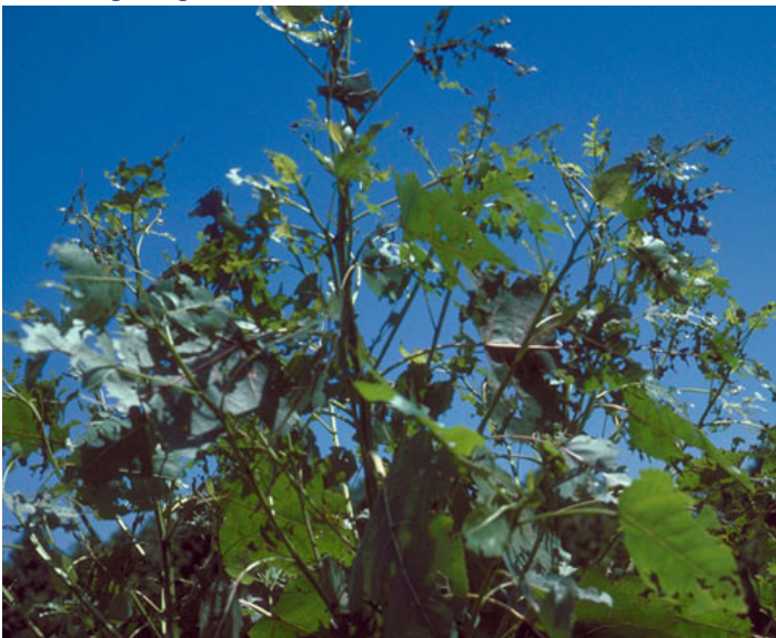
Figure 13. Defoliation caused by the cottonwood leaf beetle, Chrysomela scripta Fabricius.