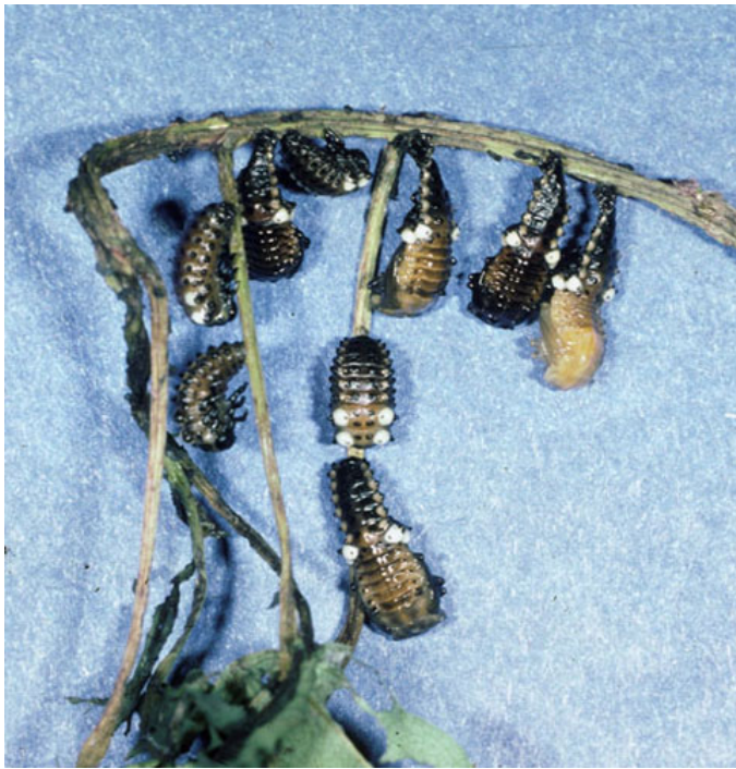
Figure 9. Pupae of the cottonwood leaf beetle, Chrysomela scripta Fabricius, on branch.