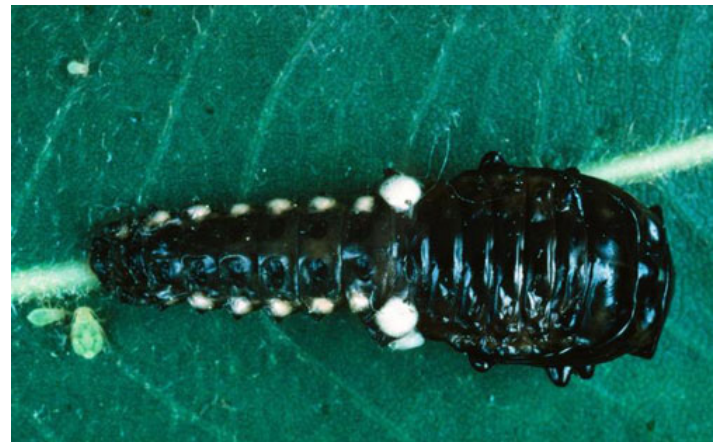
Figure 8. Pupa of the cottonwood leaf beetle, Chrysomela scripta Fabricius, on leaf.

The pupae resemble the larvae, being black in color. Pupae are found on branches and leaves.