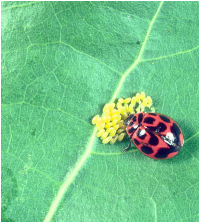
Figure 15. The v-marked lady beetle, Neoharmonia venusta (Melsheimer), feeding on eggs of the cottonwood leaf beetle, Chrysomela scripta Fabricius.