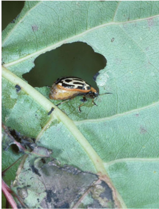
Figure 2. Adult cottonwood leaf beetle, Chrysomela scripta Fabricius, feeding on foliage.