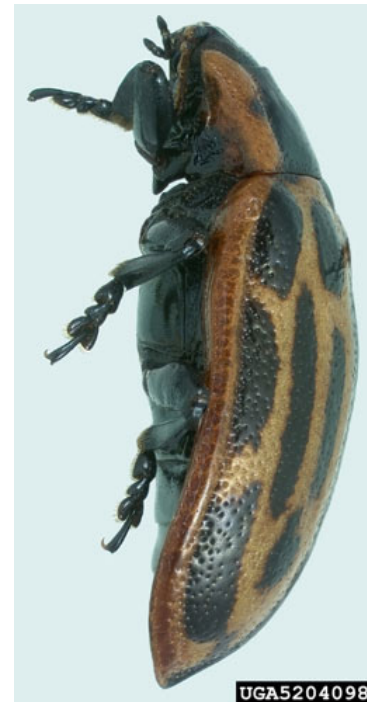
Figure 4. Adult cottonwood leaf beetle, Chrysomela scripta Fabricius, lateral view.