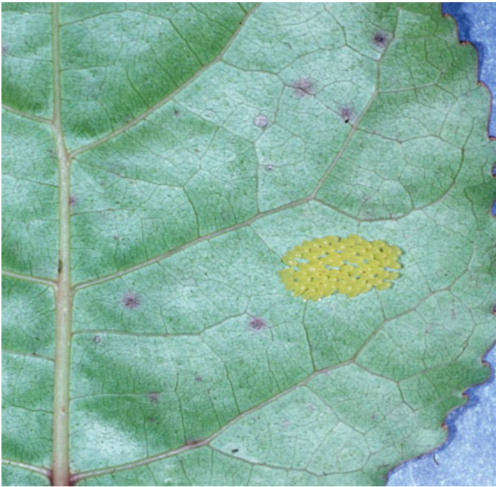
Figure 5. Eggs of the cottonwood leaf beetle, Chrysomela scripta Fabricius, on leaf.