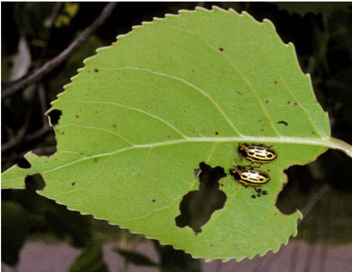
Figure 12. Initial feeding damage from the cottonwood leaf beetle, Chrysomela scripta Fabricius.

Also, in other hosts, especially cottonwoods, cottonwood leaf beetles cause severe damage within the first three years of growth. Defoliation can decrease diameter and height of the trees and increases lateral branching and terminal forking (Smith and Ward 1998).