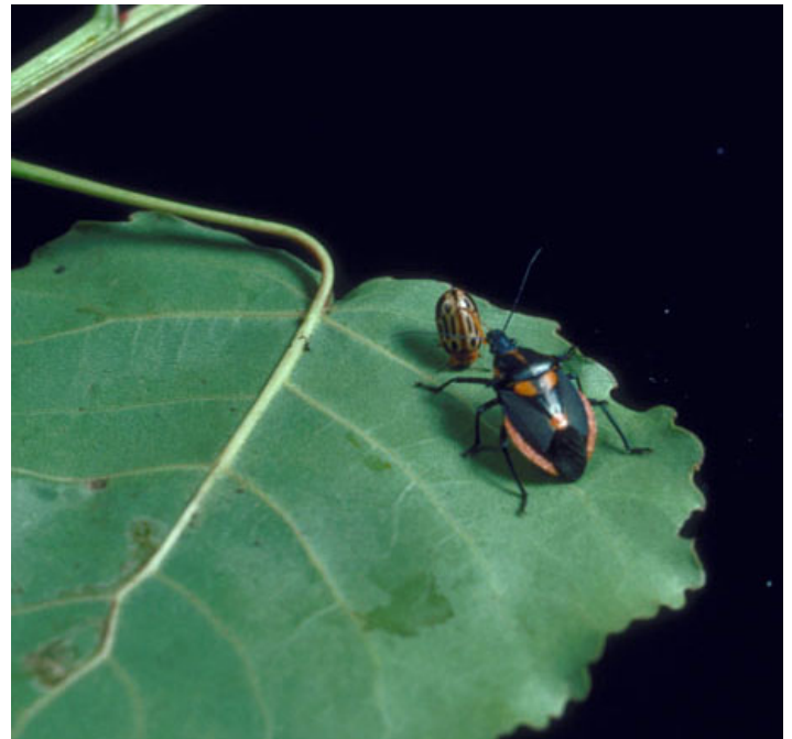
Figure 14. The anchor stink bug, Stiretus anchorago (Fabricius), a predator of adult cottonwood leaf beetles, Chrysomela scripta Fabricius, as seen here

There have been reports of natural enemies that attack cottonwood leaf beetle. These include the stink bug, Stiretus anchorago ; the convergent lady beetle, Hippodamia convergens ; v-marked lady beetle, Neoharmonia venusta ; as well as ants, spiders and parasitic wasps. The convergent lady beetle feeds on the eggs while stink bugs attack the adult beetles. The microbial insecticide Bacillus thuringiensis strains “San Diego” and “tenebrionis” have been used as a preventative and curative method to control cottonwood leaf beetle adults.