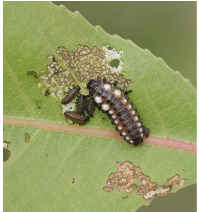
Figure 7. Size differences of young and mature larvae of the cottonwood leaf beetle, Chrysomela scripta Fabricius.

The young larvae are black in color, but will eventually become light to dark brown with noticeable white scent glands as spots along their body. In many instances, young larvae begin their feeding gregariously on the underside of the foliage. Older larvae feed singularly and usually consume the entire leaf, except for the thicker veins. However, they vary in color, often are gray, and may grow to 12 mm in length (Smith and Ward 1998).