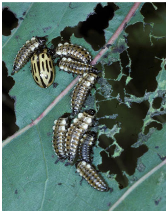
Figure 1. Adult (upper left) and various larval instars of the cottonwood leaf beetle, Chrysomela scripta Fabricius, feeding on foliage.

Cottonwood, Populus deltoides , is its primary host. As soon as spring leaf growth occurs, the cottonwood leaf beetle moves from under the bark, litter, or forest debris to the host trees to feed on the leaves and twigs. The beetle feeds most often on immature buds. Leaf beetles can complete their entire holometabolous life cycle on cottonwood if food is available (Smith and Ward 1998).