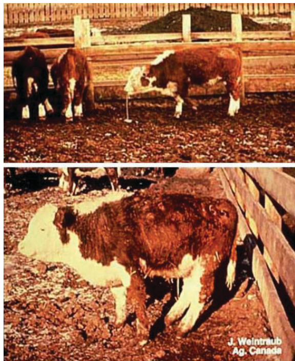
Figure 9. Treatment reactions. Vomiting due to common cattle grub larvae in the esophagus (top), and hindquarter paralysis due to northern cattle grub in the spinal cord (below).

cattle grub body fluids than young animals and calves and, therefore, they have increased risk of anaphylactic shock. Take special care when treating older animals and be particularly careful with pregnant animals: spontaneous abortions because of reactions to ruptured cattle grubs have been reported.