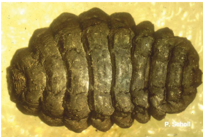
Figure 5. Mature third instar cattle grub.