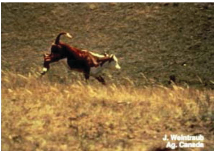
Figure 6. Cattle gadding in response to the presence of warble flies.

Cattle grub infestations cause damage both directly and indirectly, due to both the adult warble flies and the immature cattle grubs. The adult flies, particularly of the northern cattle grub, cause panic when they are flying near cattle. Cattle that are being bothered by warble flies will show unusual behavior such as gadding or running across the pastures (Figure 6). The reduced time spent feeding and the exertion from these attempts results in decreased weight gain. In first-year heifers, cattle grub avoidance appears to result in breeding and, subsequently, calving asynchrony. Breeding asynchrony may occur because of increased effort being spent avoiding flies, resulting in the time that the heifers breed being spread out over the season. Consequently, calves are born over an extended period (asynchronously), which results in increased costs to the farmer. Indirect damage may result as well if panicked cattle fall or run into fences or other objects. In pregnant animals, gadding may cause spontaneous abortions.