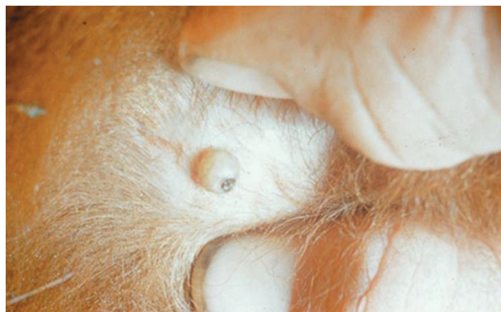
Figure 8. Mechanical removal of cattle grub.

abscesses, or anaphylactic reactions in previously exposed animals.