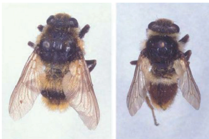
Figure 2. Warble flies, adult northern cattle grub on the left and common cattle grub on the right.

or resting. The fly lands close by and then walks onto the animal, raising little alarm. Once on the animal, the fly will lay between five and 15 eggs on a single hair and around 500 eggs on one animal (Figure 4).