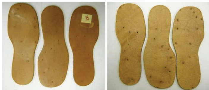
Figure 7. Example of cattle grub damage to hide.

Cattle grubs also can affect other animals, most commonly humans and horses, as accidental hosts. In humans the maggots cause a condition called cutaneous larval migrans, in which after the maggots penetrate the skin they wander, causing visible red tracks that are very itchy. Human infestation with the northern cattle grub, in particular, may cause adverse side effects if the maggots penetrate deeper. In horses the maggots migrate through to the animal's back where they cause abscesses, which prevents them from being mounted for riding due to the discomfort caused by the tissue damage.