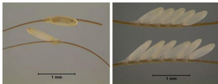
Figure 4. Warble fly eggs. Northern cattle grub eggs laid singly on the left and common cattle grub eggs laid in clusters on the right.

pastures, kicking in a vain attempt to deter the flies. In both species the eggs are a narrowed oval shape, about 1 mm long, and smooth with a dull yellow color.