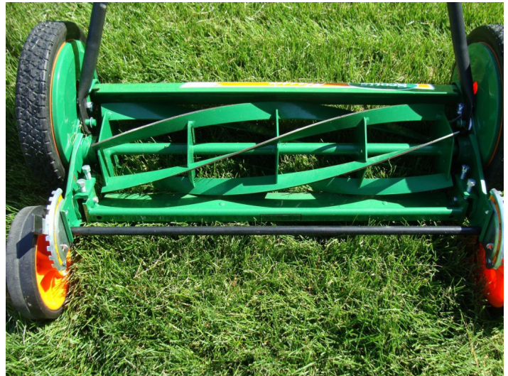
Figure 7. Reel mower.

Reel mowers use a scissors-like action to cut the leaf blades and are used on grasses that require a low height of cut. They are suited for use on high maintenance, fine-bladed grasses such as those found on golf courses and athletic fields. Commercial models are much more complex to maintain than a rotary mower. It is possible to find reel push mowers with no engine for use on home lawns that have fine bladed grasses.