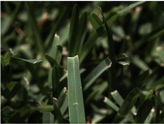
Figure 8. Ragged turf appearances.