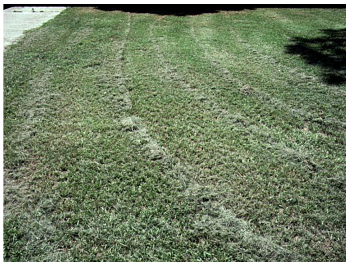
Figure 4. Excess clippings.

On most lawns, grass clippings should be left on the ground to help recycle nutrients and organic matter to the soil and to reduce yard waste in landfills. If the lawn is mowed frequently enough, clippings cause few problems. Clippings are readily decomposed by microbes in the soil and provide organic matter and nutrients back into the soil. Clippings do not contribute to thatch under most conditions. Problems may also arise when turf is mowed infrequently and excess clippings result in clumping (Figure 4).