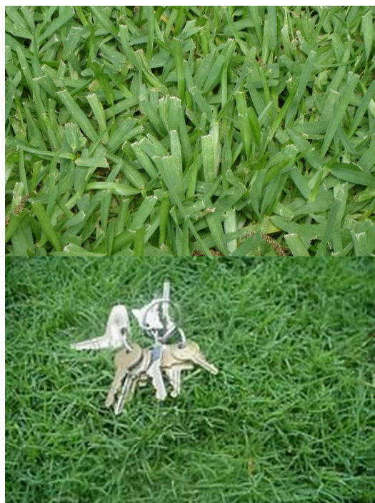
Figure 1. St. Augustinegrass (on the top) has coarse leaf blades and requires a higher height of cut. Bermudagrass (on the bottom) has much finer leaf blades and can be mowed at much lower heights. Credits: L. Trenholm

such as insects, disease, drought, and sunscald. Mowing also influences rooting depth, with development of a deeper root system in response to higher mowing heights. Advantages of the deeper root system are greater tolerances to drought, insects, disease, nematodes, temperature stress, poor soil conditions, nutrient deficiencies, and traffic.