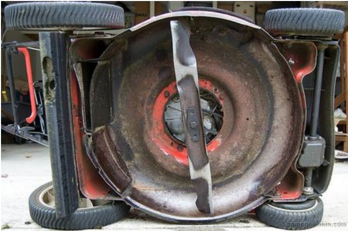
Figure 5. Rotary mower.

rear-clipping discharge models are also available. Points to consider when purchasing a mower are lawn size, turfgrass species, and level of lawn maintenance. Rotary mowers are best suited for most lawngrass species and are easy to maintain and operate. A gasoline or electric engine is used to turn the horizontally-mounted mower blade. The grass blade is cut on impact with the mower blade. Most rotary mowers cannot mow lower than 1 inch and are best used for mowing heights above 2 inches. The blade needs to be sharpened and balanced regularly for the best possible cut.