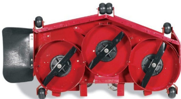
Figure 6. Mulching mower.

Mulching mowers are modifications of rotary mowers (Figure 6). These are designed to cut leaf blades into very small pieces that decompose more quickly than leaf blades cut by conventional mowers, providing nutrition and organic matter to the soil environment. The mower blades are designed to create a mild vacuum under the mower deck until the leaf blades are cut into small pieces. Mulching mowers do not have the traditional discharge chute like most rotary mowers.