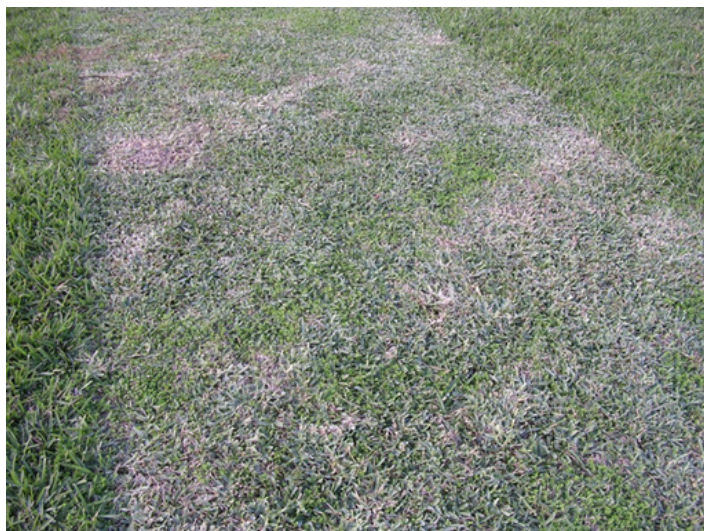
Figure 2. A lawn showing scalping damage.

Repeated mowing below the recommended heights for each species is a primary cause of turf injury and should be avoided.