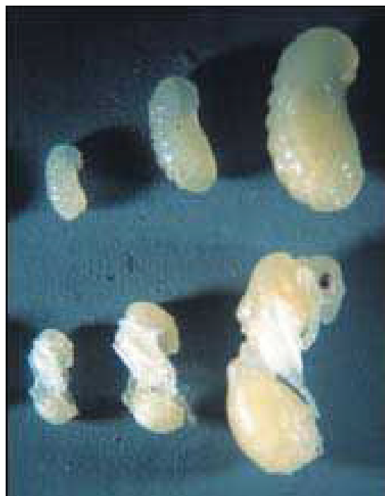
Figure 16. Larval (top) and pupal (bottom) stages of imported fire ant.

Properly identifying ant species is the first step in determining the need and approach for control (see Identifying Fire Ants ). Accurate identification can be especially important in the southwestern states where native fire ant species are common and red imported fire ants are rare. Although native fire ants are common urban pests, if they are controlled unnecessarily, especially in very dry climates, imported fire ants are more likely to invade these areas.