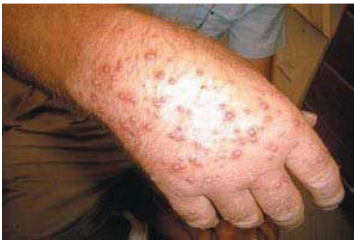
Figure 19. Pustules formed from fire ants stings on adult hand.

If the only symptoms are pain and the development of pustules, stings can be treated with over-the-counter products that relieve insect bites and stings (see Fire Ant Stings for more information). If a sting leads to severe chest pain, nausea, sweating, difficulty breathing, serious swelling or slurred speech, the person should be taken to an emergency medical facility immediately. Some allergic people may lapse into a coma from just one sting. Compared to deaths from bee and wasp stings, relatively few deaths from fire ant stings have been documented. People sensitive to fire ant stings should seek the advice of an allergist. Once a person has discovered that he/she is allergic to the fire ant venom, extra care must be taken to avoid stings. Often individuals allergic to the venom will carry epinephrin (“Epi pens”) or undergo treatment in an attempt to desensitize their reaction to the venom.