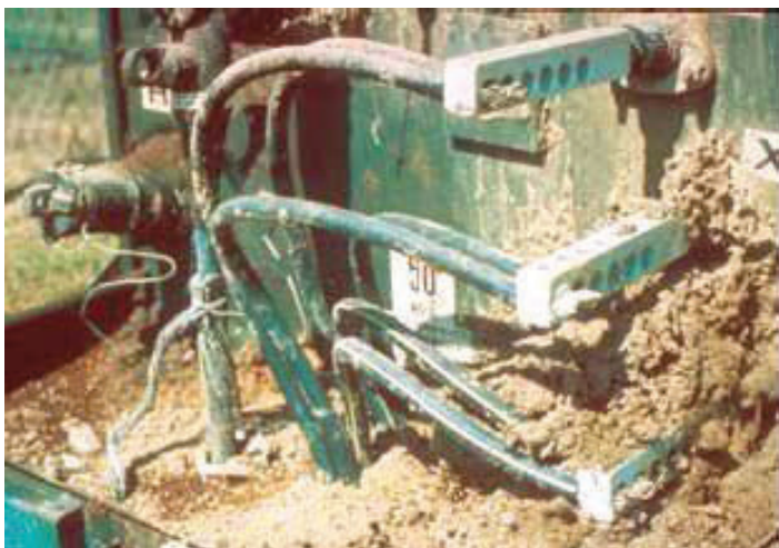
Figure 5. Fire ant mounds in electric utility housing.