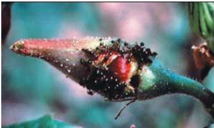
Figure 6. Fire ants feeding on okra bud.

Ants occasionally feed on vegetable plants in home gardens. They tunnel into potatoes underground and feed on okra buds and developing pods. The worst damage usually occurs during hot, dry weather. Ants may be a nuisance to gardeners during weeding and harvesting. Ants prey on some garden pests such as caterpillars, but protect or “tend” others, such as aphids, by keeping their natural enemies away.