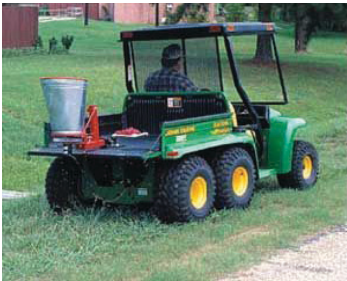
Figure 11. Man applying fire ant treatment with spreader attached to the back of a Gator utility vehicle.