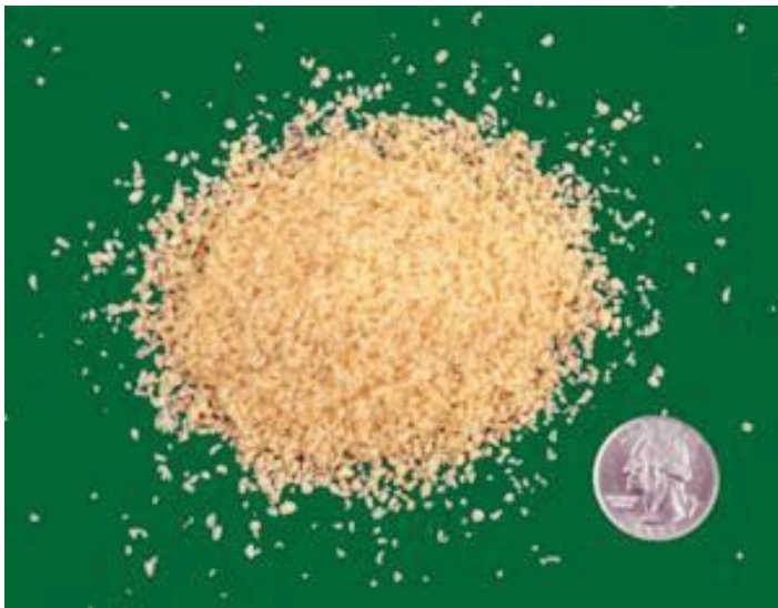
Figure 12. Pile of fire ant bait compared to size of quarter.

ingredients. These active ingredients are sold under various trade names. Carefully follow directions on the product label to understand the proper method of application, what protective clothing must be worn, re-entry intervals to observe, and proper watering practices before and after treatment.