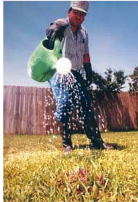
Figure 13. Individual fire ant mound treatment using chemical drench.

although those containing pyrethrins and d-limonene are effective almost immediately.