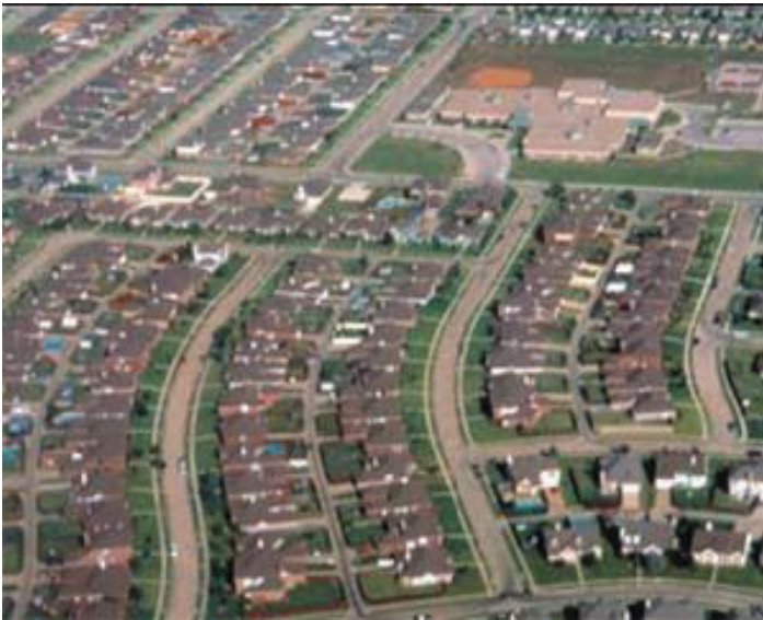
Figure 9. Typical urban neighborhood.

In Texas, four homeowner associations in San Antonio (Jade Oaks and Countryside) and Austin (Mt. Bonnell and Apache Oaks) conducted pilot projects from 1998 through 1999 and had participation rates of 89 to 98 percent. Fire ants were treated periodically by volunteers or professionals. Populations of imported fire ants were reduced by an average of 91 percent, while the numbers of native and competitor ants increased from an average of 6.3 to an average of 9.5 species.