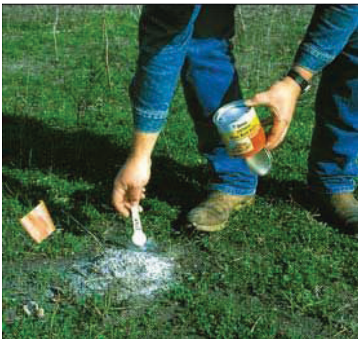
Figure 4. Individual fire ant mound treatment.

Treat undesirable fire ant mounds using an individual mound treatment (see the section on Individual Mound Treatments with Contact Insecticides under Fire Ant Treatment Methods). Products are applied as dusts, dry granules, granules drenched with water after application, liquid drenches, or baits. Non-chemical treatment methods such as drenching mounds with very hot water also may be used. Mound treatments may need to be repeated to eliminate the colony if queen ants are not all killed with the initial treatment. When treating an ant mound with a liquid product or watering a product into a mound, begin on the outside of the mound and circle into the center of the mound. Application of faster-acting granular ant bait formulations are made around the mound as directed.