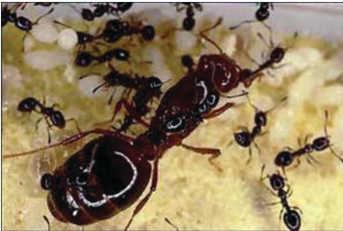
Figure 10. Little black ants attacking fire ant queen.

Currently, the best biological control method for fire ants is to preserve other ant species that compete with them for food and nesting sites, attack small fire ant colonies, or kill newly mated queen ants. In some areas outbreaks of other exotic ant species, such as Argentine ants and tawny crazy ants, have displaced imported fire ants. Even imported fire ants from single-queen or polygyne colonies will prey upon newly mated fire ant queens and eliminate small, neighboring colonies. Ants, in general, are considered beneficial insects because they prey upon many other arthropods and collectively till more earth than earthworms, thereby reducing soil compaction. Ways to preserve native ants include preserving their habitat and using insecticides judiciously.