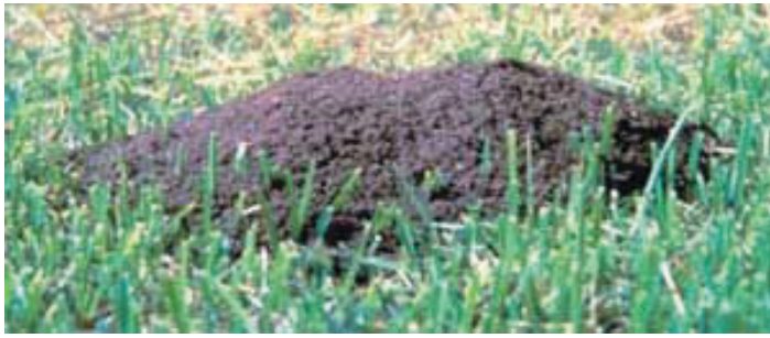
Figure 18. A typical fire ant mound.

are carried by the wind. Shipments of nursery stock or soil from an infested area may relocate entire colonies.