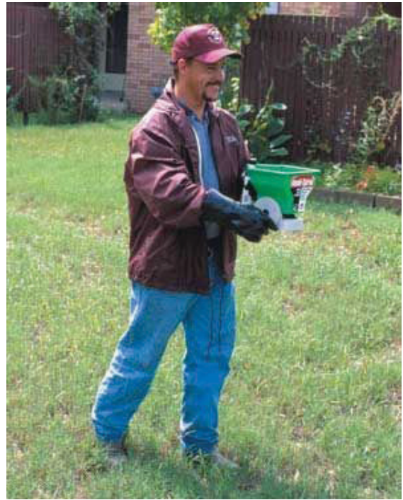
Figure 15. Man applying fire ant broadcast bait treatment to lawn using hand-held spreader.

Several products said to be “organic” (of natural origin) are currently marketed for fire ant control. These products may or may not be registered as pesticides by the EPA and the appropriate state regulatory agency. In 1996 the EPA established that certain ingredients that pose minimum risk to users no longer require EPA approval to be marketed as insecticides. These products are called “25 b” products, referring to that clause in FIFRA, the Federal Insecticide, Fungicide and Rodenticide Act). Some of the “organic” products fall into the minimal risk category. Therefore, not every product sold for fire ant control is supported by research-based evidence that it is effective against fire ants.