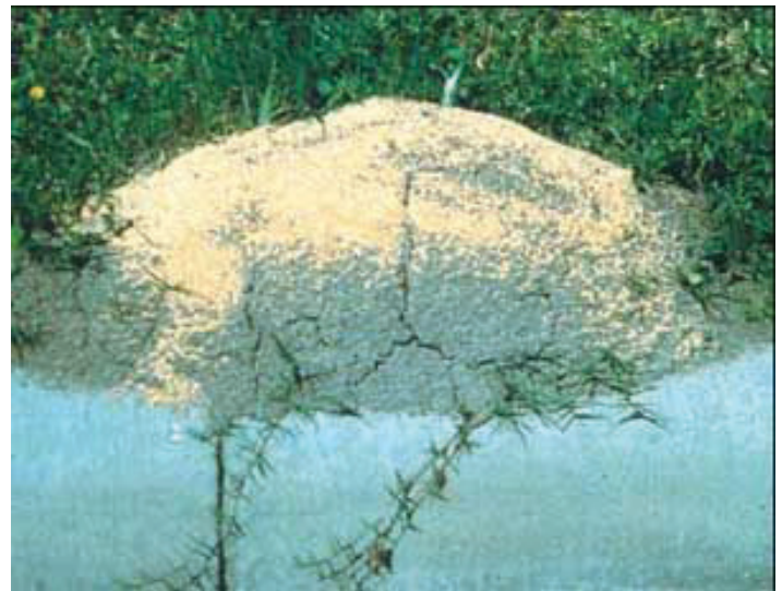
Figure 14. Treatment for fire ants with a granular product.

To treat a single mound with a granular product, measure the recommended amount in a measuring cup labeled “POISON” for pesticide use only. Then sprinkle it on top of and around the mound. Do not disturb the mound. If the label says to water in the insecticide, use a sprinkling can and water the mound gently to avoid disturbing the colony. Several days may pass before the entire colony is eliminated.