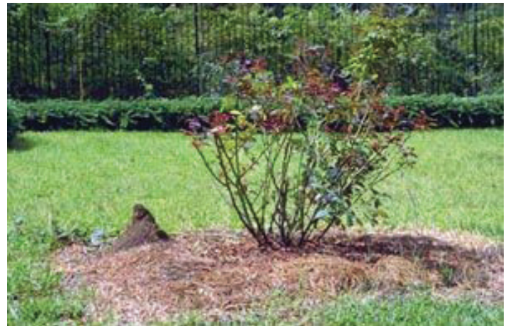
Figure 1. An unsightly mound built by imported fire ants.

The two species of imported fire ants (red imported fire ant, Solenopsis invicta Buren, and black imported fire ant, Solenopsis richteri Forel) and their sexually reproducing hybrid are invasive insects whose stings can cause serious medical problems. Imported fire ants interfere with outdoor activities and harm wildlife throughout the southern United States and elsewhere (see map and History of Control Efforts). Ant mounds are unsightly and may reduce land values. Although fire ants do prey on flea larvae, chinch bugs, cockroach eggs, ticks and other pests, the problems they cause usually outweigh any benefits in urban areas. While it may not be possible to eradicate fire ants, we can make them easier to live with. The best management programs use a combination of non-chemical and chemical methods that are effective, economical, and least harmful to the environment.