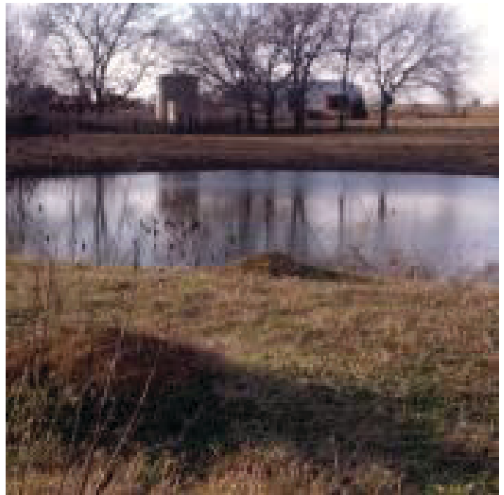
Figure 7. Imported fire ant mounds near farm pond.

To decrease the risk of pesticide runoff into waterways, apply baits when ants are actively foraging. Read the label carefully and do not apply closer to the edge of the body of water than allowed on the label. When treating individual mounds near the water's edge or in drainage or flood-prone areas, exercise special care and use products such as acephate (Orthene®) that have relatively low toxicity to fish and apply the product according to label directions. Pyrethrins, pyrethroids and rotenone products should be avoided because of their high toxicity to fish. Do not apply surface, bait or individual mound treatments if rains are likely to occur soon after treatment. Nearly all insecticides can be toxic to aquatic organisms if applied improperly.