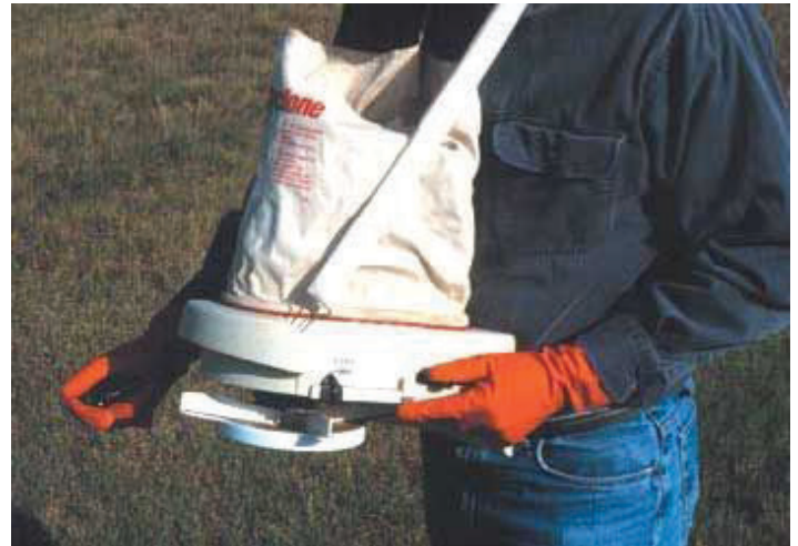
Figure 3. Hand-held bag sprayer for fire ant treatment application.

Properly identifying an ant species is the first step in determining whether the ants should be managed and how to do so (see the section on Fire Ant Biology and Identification). Doing nothing is an option that should be considered in areas where imported fire ants are not present or are present in very low numbers and do not pose a problem. Most management options require repeated treatments to maintain suppression, which requires a commitment to continued labor and expense. In the following sections are options for managing various kinds of imported fire ant problems. There may be other effective methods not mentioned, and there is rarely a single best method of control.