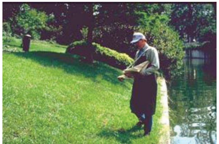
Figure 8. Man applying fire ant bait near water using a hand-held spreader.