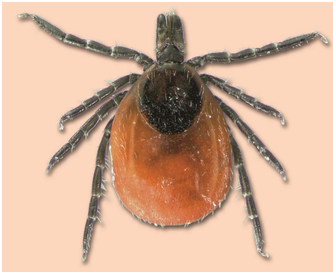
Figure 2. Black-legged deer tick female.