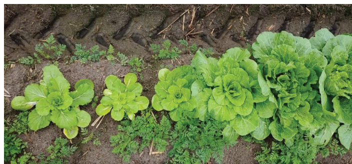
Figure 4. Stunting and mild chlorosis (yellowing) of cabbage plants late in the growing season due to root-knot nematode infestation. Plants on left are more severely damaged than those on the right due to varying nematode populations and environmental factors.

Root symptoms induced by sting or root-knot nematodes are often more specific than aboveground symptoms. Sting nematode can be very injurious, causing infected plants to form a tight mat of short roots that are often swollen at the tips (Figure 8). New root initials are often killed by heavy infestations of the sting nematode, resembling fertilizer salt burn (Figure 9). Root symptoms induced by root-knot