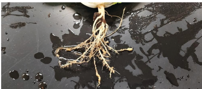
Figure 10. Severe galling (irregularly shaped swellings) of cabbage roots due to root-knot nematode infestation