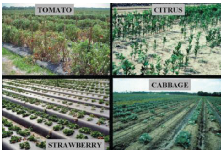
Figure 5. Plant stunting caused by sting ( Belonolaimus longicaudatus ) or root-knot nematode ( Meloidogyne spp.) in various field crops. Note irregular or patchy field distribution of stunted plants rather than throughout the entire field.

nematodes include swollen areas (galls) on the roots of infected plants (Figure 10). Gall size may range from a few spherical swellings to extensive areas of elongated, convoluted, tumorous swellings that result from exposure to multiple and repeated infections when root-knot nematode abundance is substantial. Symptoms of root or tuber galling can provide positive diagnostic confirmation of root-knot nematode presence, infection severity, and potential for crop damage in most cases.