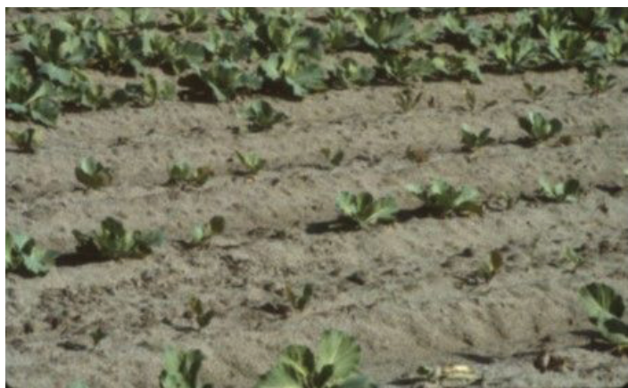
Figure 6. Sting nematode-induced stunting of cabbage and poor stand establishment.