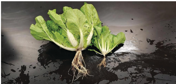
Figure 11. Severe root-knot nematode infestation impairs root function leading to reduced growth (right plant) compared with healthy plant (left plant). The infested plant has a stunted root system with fewer lateral roots and severe galling (irregularly shaped swelling of the root).