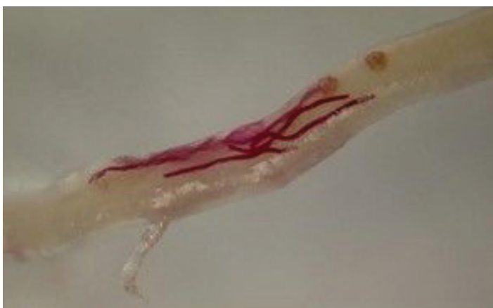
Figure 2. Migratory endoparasites feed with their bodies inside the root and move from site to site in the root to feed. Generally, all life stages are of a relatively similar size.