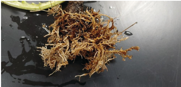
Figure 9. Close-up view of sting nematode damage on artichoke roots. Lateral roots are short with root tips that are swollen and look burned due to severe necrosis (brown, dying tissue). Also note general necrosis of root system.

is said to be susceptible to that nematode; a crop able to maintain yield despite nematode infection and reproduction is said to be tolerant to that nematode.) A summary of the susceptibility of common Florida cole crops to common plant-parasitic nematodes is provided in Table 1, but not all combinations have been tested. Furthermore, for most cole crop and nematode combinations, damage functions (expected yield loss at various nematode population levels) for a given nematode have not been accurately determined. Longer-season crops grown in warmer months tend to be at greater risk for nematode damage because these conditions favor build-up of nematode populations.