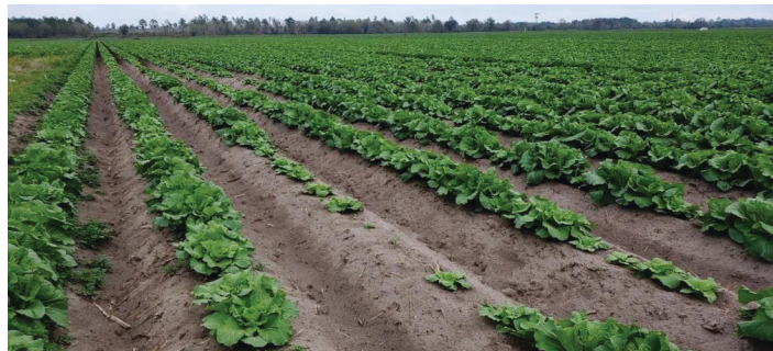
Figure 7. Stunted cabbage and poor stand late in the growing season due to root-knot nematode infestation. Symptoms are patchy with irregular distribution based on nematode populations and environmental factors such as soil moisture.

earlier and more severe the symptoms. Under less severe infestation levels, symptom expression may be delayed until later in the crop season after a number of nematode reproductive cycles have been completed on the crop. In this case, aboveground symptoms will not always be readily apparent early within crop development, but with time and reduction in root system size and function, symptoms may become more pronounced and diagnostic. In some cases, damage symptoms may be too subtle to detect even if yield loss is occurring.