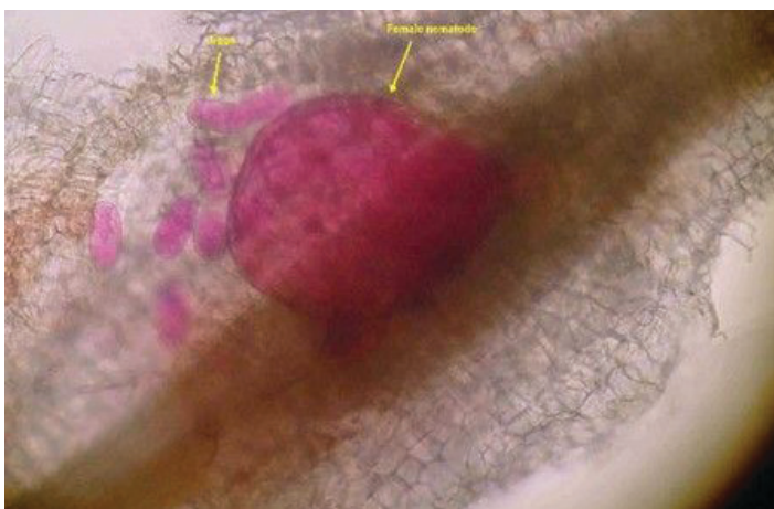
Figure 3. Sedentary endoparasites (root-knot nematode pictured here) establish a complex feeding site in the root as a juvenile or immature female and do not move from that site for the rest of their lives. Adult females enlarge as they feed and produce eggs.