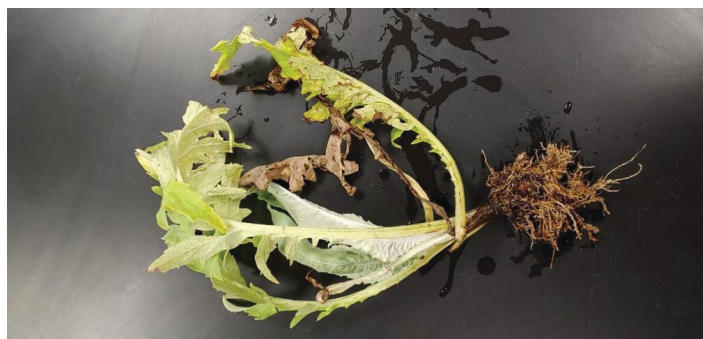
Figure 8. Sting nematode symptoms on artichoke root system. Note stunted, matted, and necrotic (brown, dying tissue) root system as well as lateral root pruning and proliferation, which is illustrated in more detail in Figure 9. Shoot is also severely stunted.